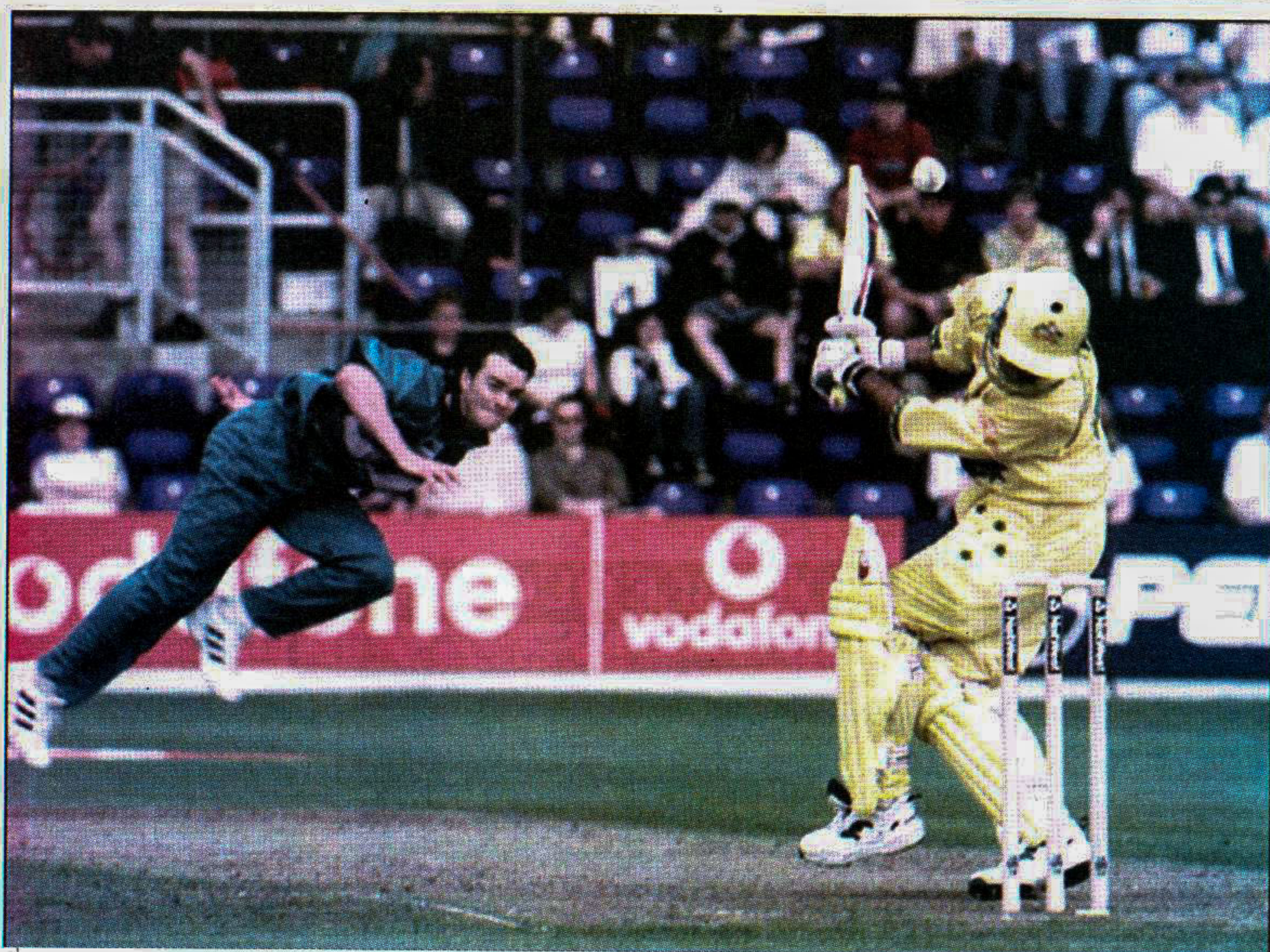
NASTY NASH: Australian batsman Ricky Ponting is surprised by a Dion Nash bouncer at Cardiff yesterday.