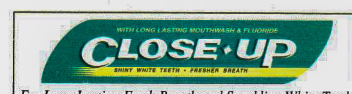
For Long Lasting Fresh Breath and Sparkling White Teeth

Pakistan's second successive win in group B following their 27-run defeat of the West Indies put Wasim Akram's men in line