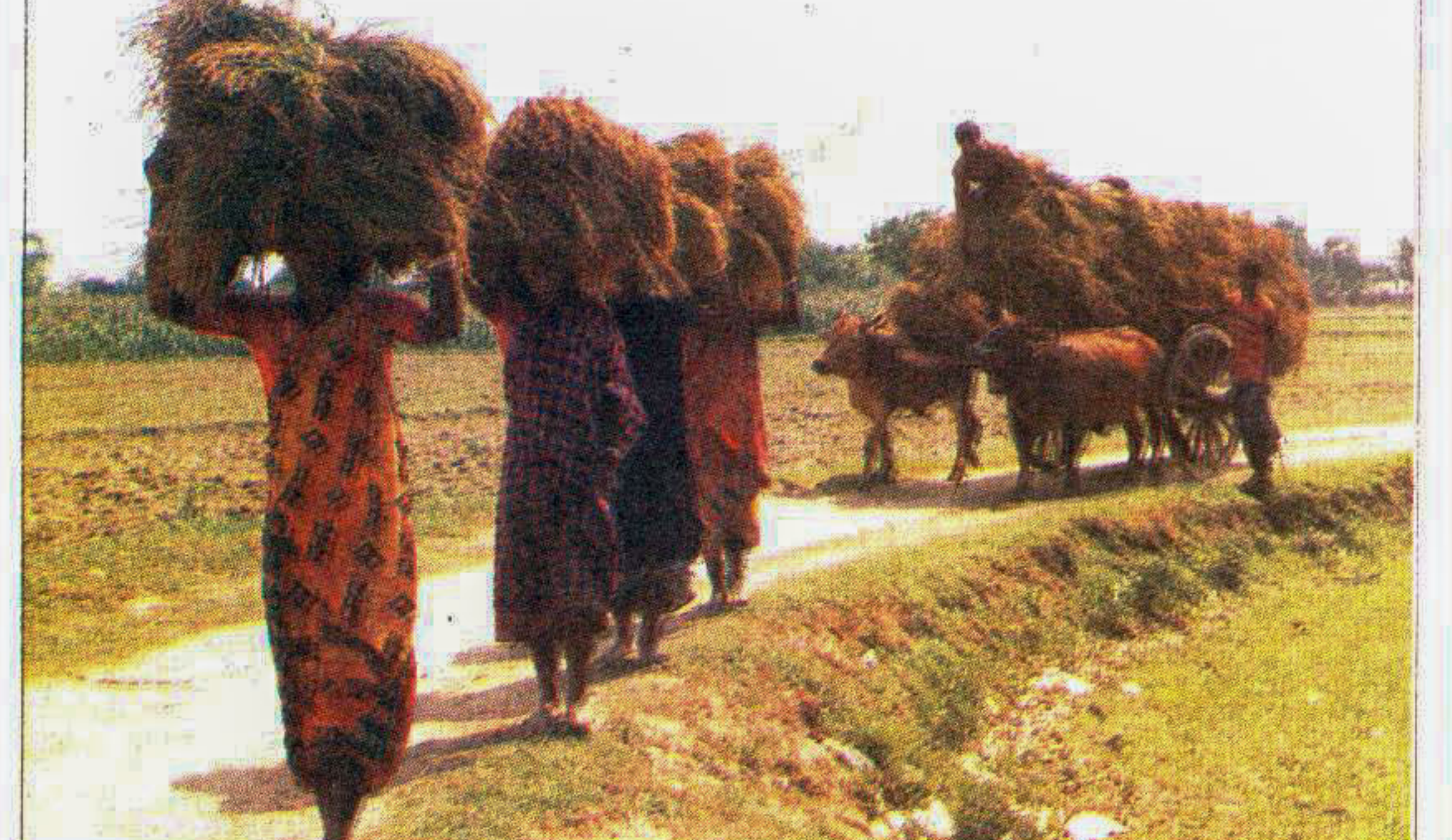
BUMPER HARVEST: Farmers taking home paddy in Birganj, Dinajpur. The picture was taken on Tuesday.