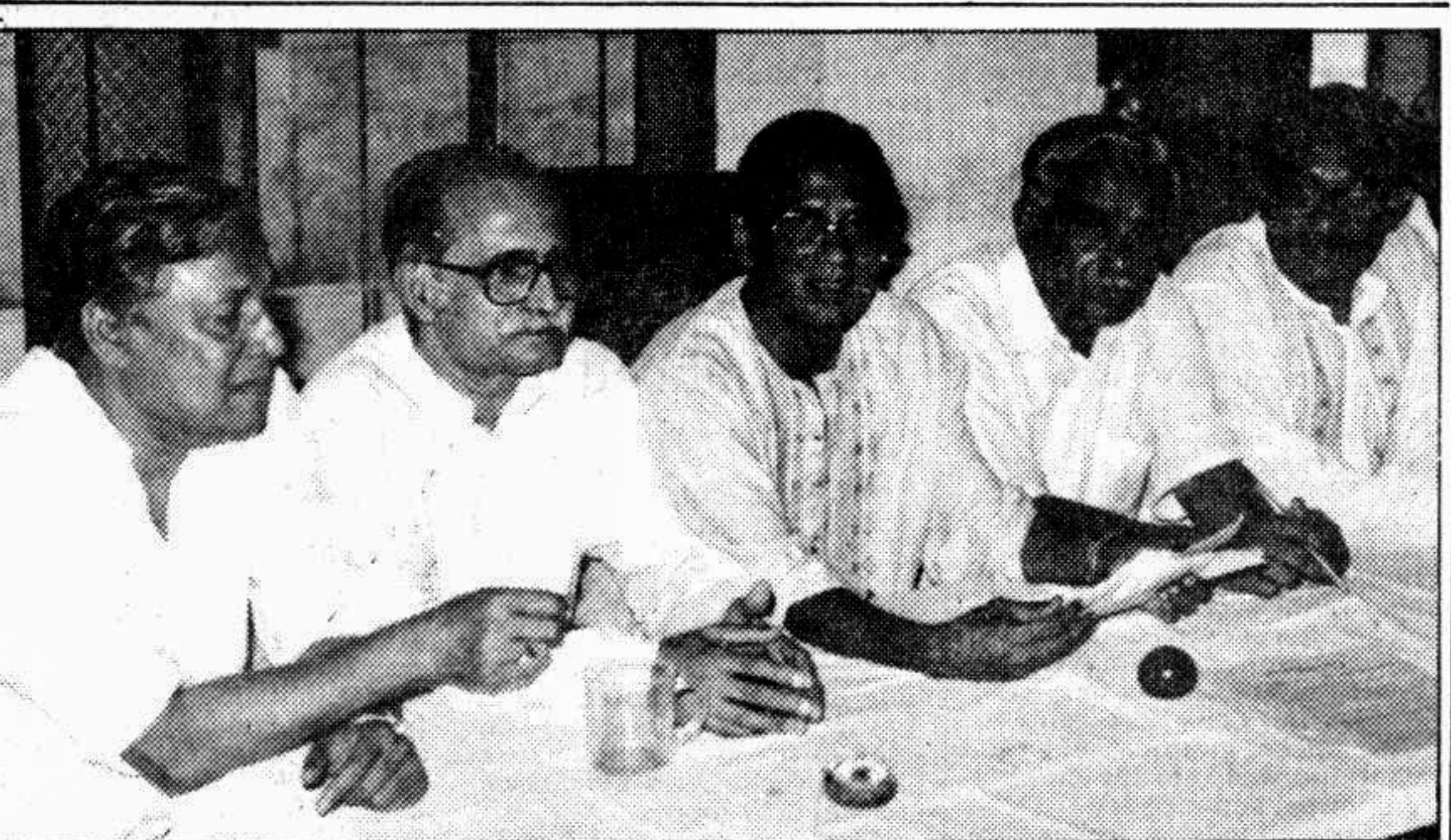
SKOP leaders at a press conference yesterday threatened that they would go for a strike if their demands were not met immediately.

The Chilean senator was arrested as he recuperated in a London hospital from an operation on his back.