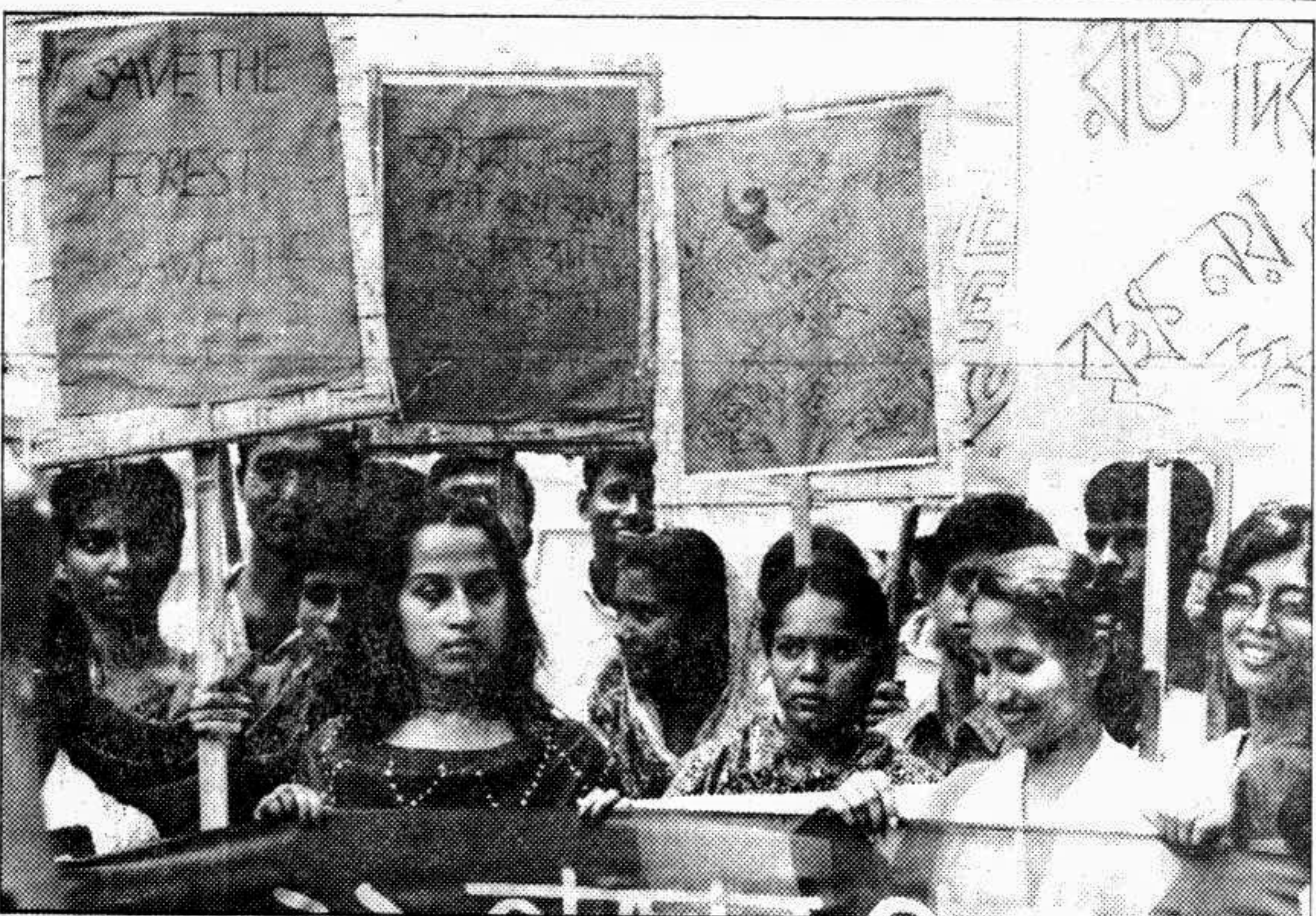
A group of Dhaka University students brought out a silent procession in the city yesterday to protest the government decision to build an international conference hall at Osmany Uddyan by cutting down the trees.

Winfrey, whose annual income is estimated at around 125 million dollars according to Forbes Magazine, hosts a top-rated syndicated talk show, which is watched by some 33 million viewers a week across the United States.