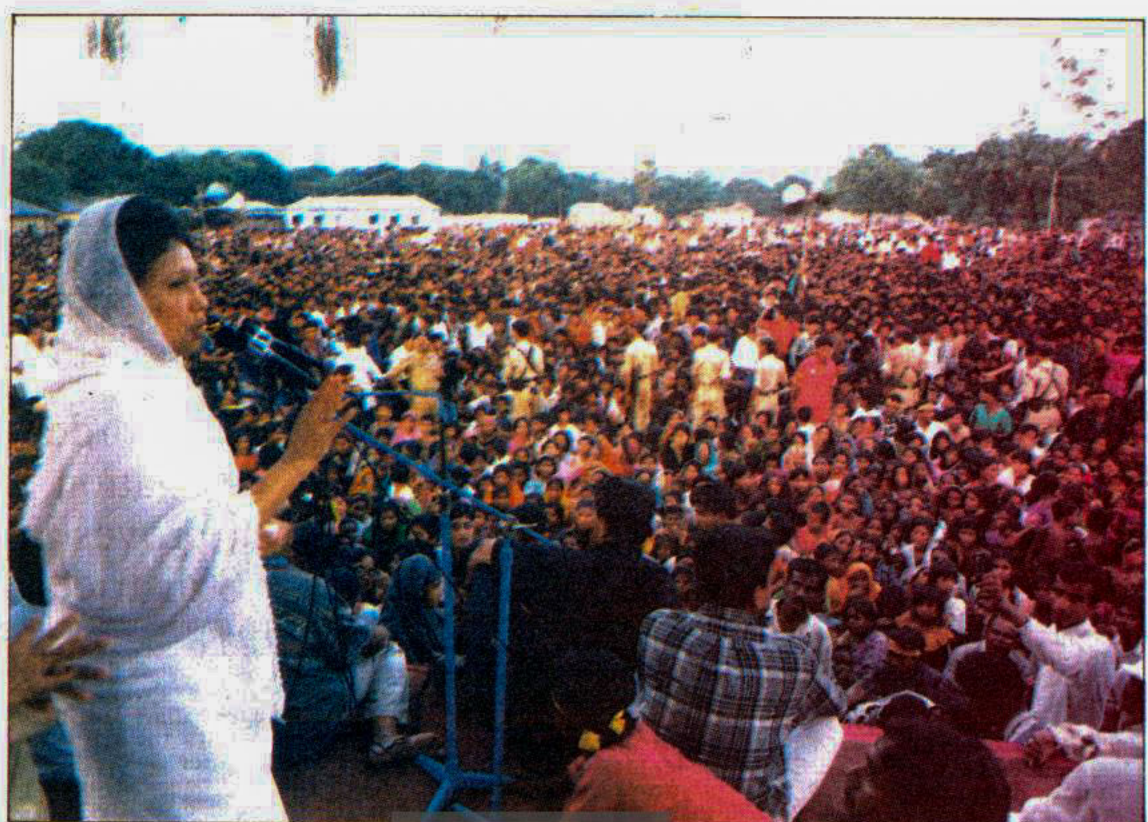
Begum Khaleda Zia addressing a rally at Birampur on the last day of 'road march' yesterday.

Lt. Col (Rtd) Kazi Nuruzzaman, who commanded the freedom fighters in Sector 7 during the Liberation War, recalled that following his letter, the then Prime Minister Tajuddin