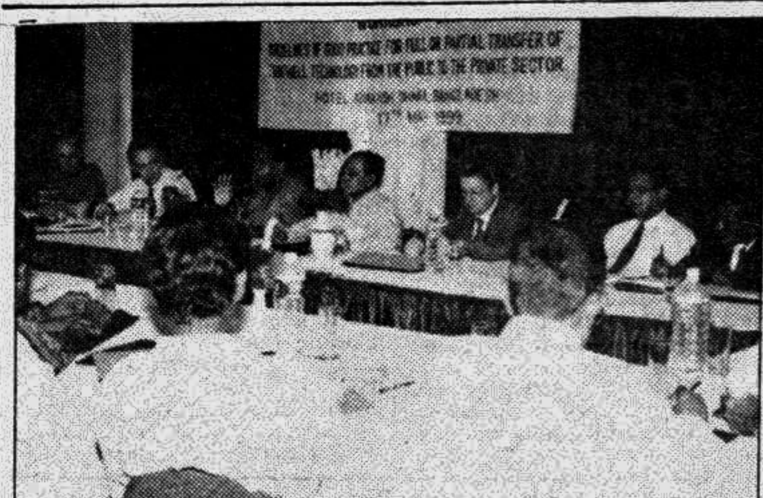
A workshop on 'Good Practice of Groundwater Irrigation' sponsored by DFID and Cranfield University, UK was held at a city hotel yesterday.

The body was sent to hospital for autopsy and a case was filed with Hathazari thana in this connection.