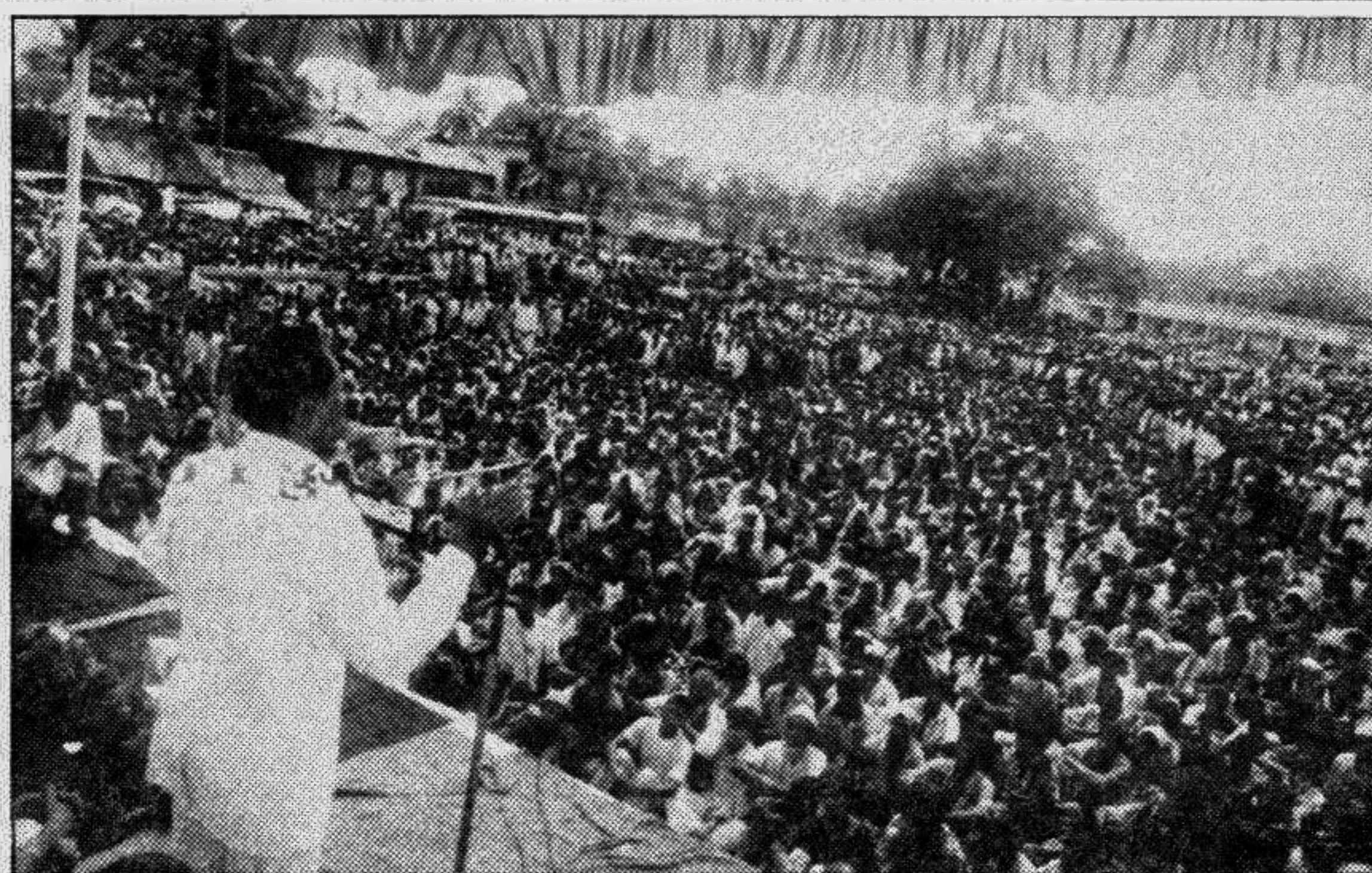
Jatiya Party Chairman HM Ershad addressing a rally at Muktagachha thana of Mymensingh district yesterday. Ershad leading a road march from Dhaka reached Mymensingh on Sunday.