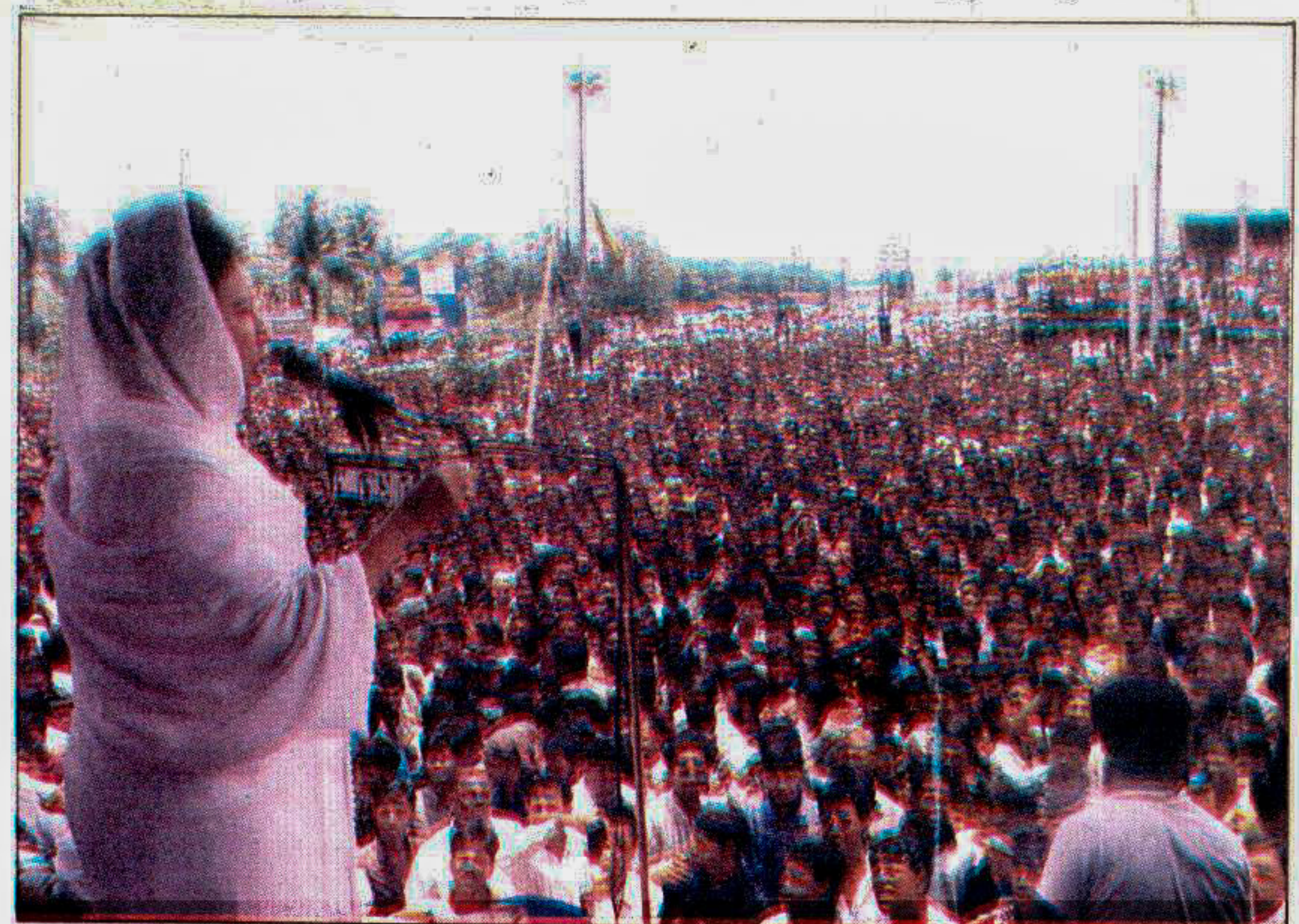
BNP chairperson and Leader of the Opposition in Parliament Begum Khaleda Zia addressing a public meeting at the bus stand crossing at Bogra town yesterday.