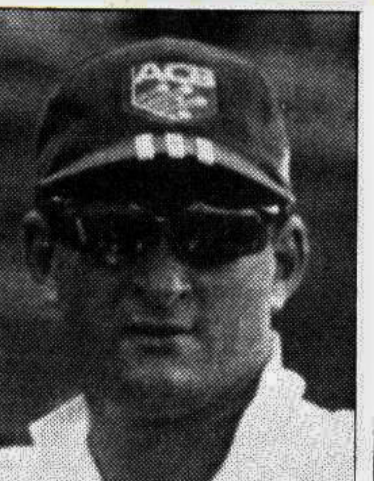
Mark Waugh Man of the Match Australia vs Scotland

The Man of the Match in the Pakistan-West Indies game could not be known till late last night.