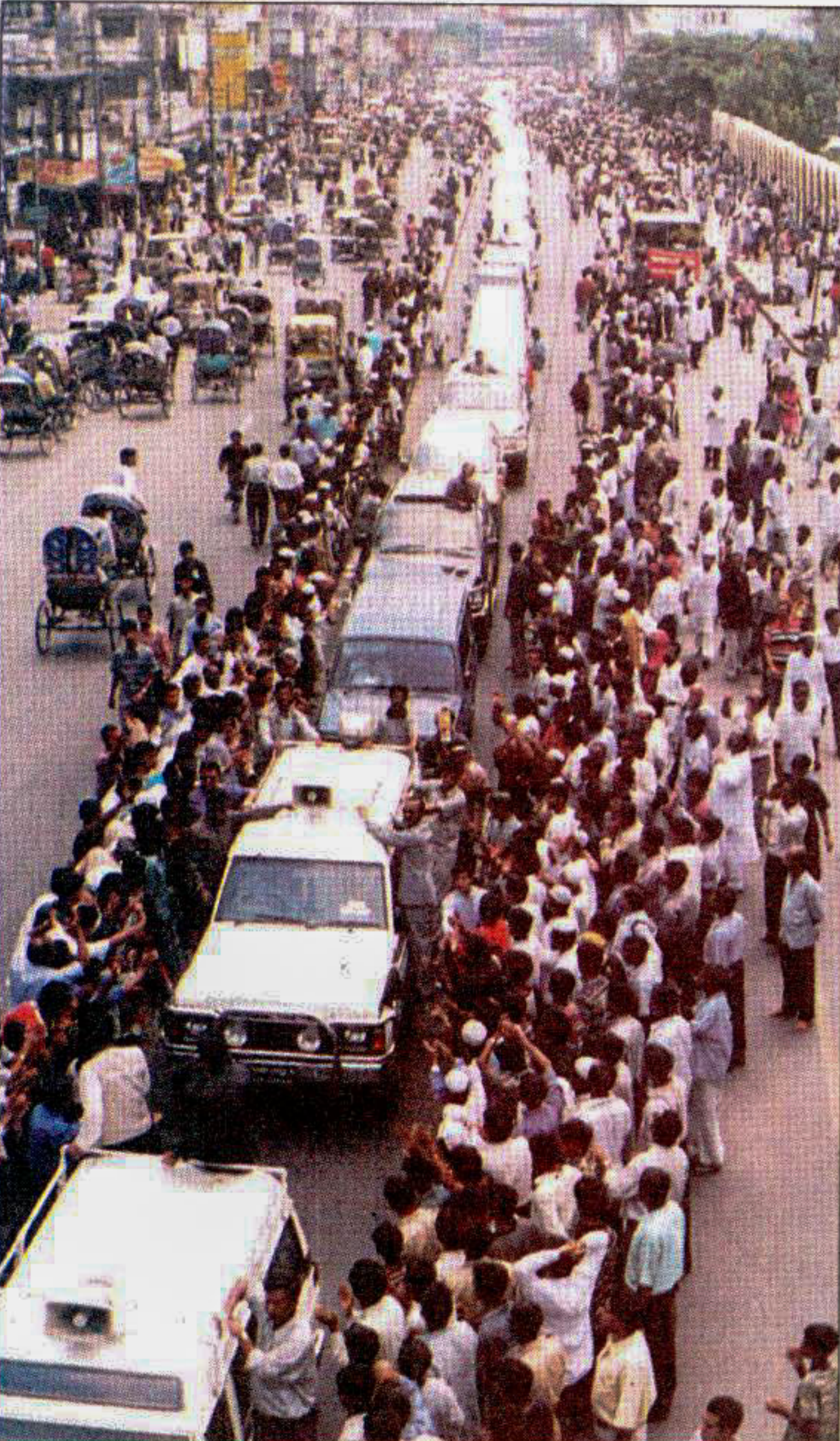
BNP 'road march' led by party chief Begum Khaleda Zia leaving the city for Panchagarh yesterday.

A huge convoy of 328 motor vehicles crossed the Bangabandhu Bridge peacefully yesterday under the personal supervision of BNP chief Khaleda Zia as she led the road march to northern Bangladesh, launching a campaign to project "government's failures".