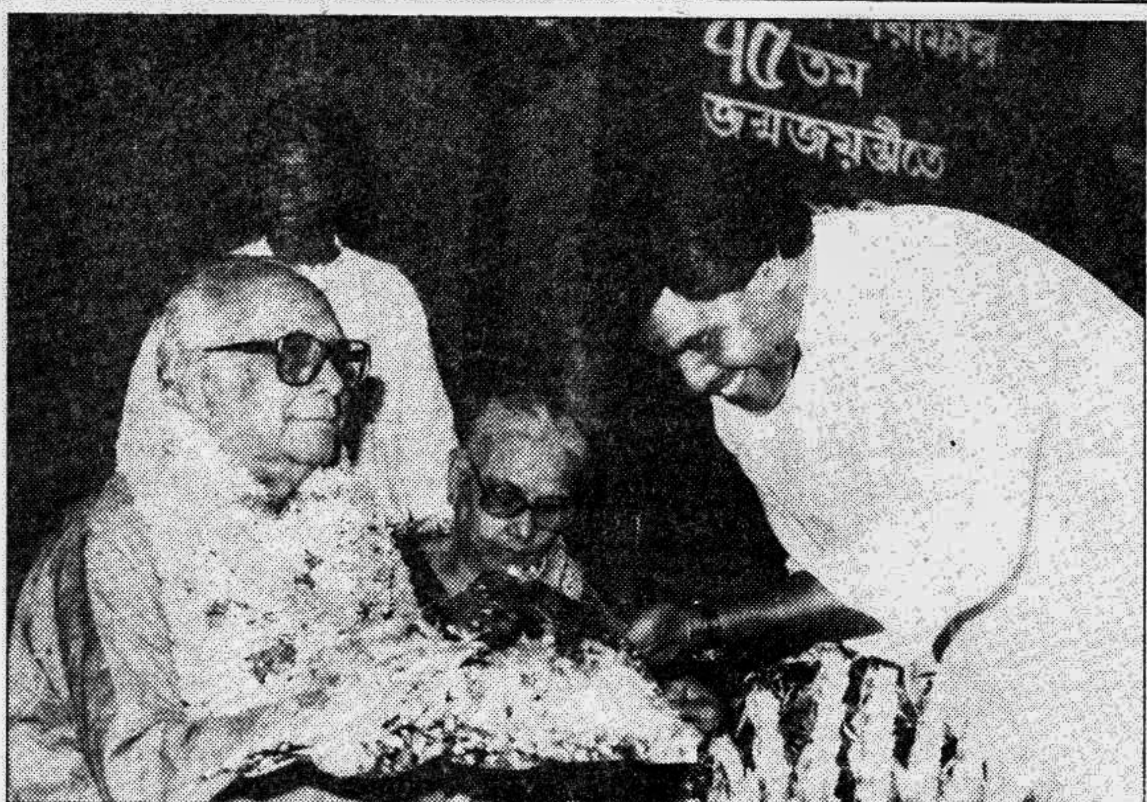
Noted Tagore singer Kalim Sharafi is being presented with a bouquet on the occasion of his 75th birth anniversary at the auditorium of the National Museum in the city yesterday.

The agenda suggested prevention of proliferation and use of conventional weapons including light weapons, small arms and guns and safeguarding of personal security.