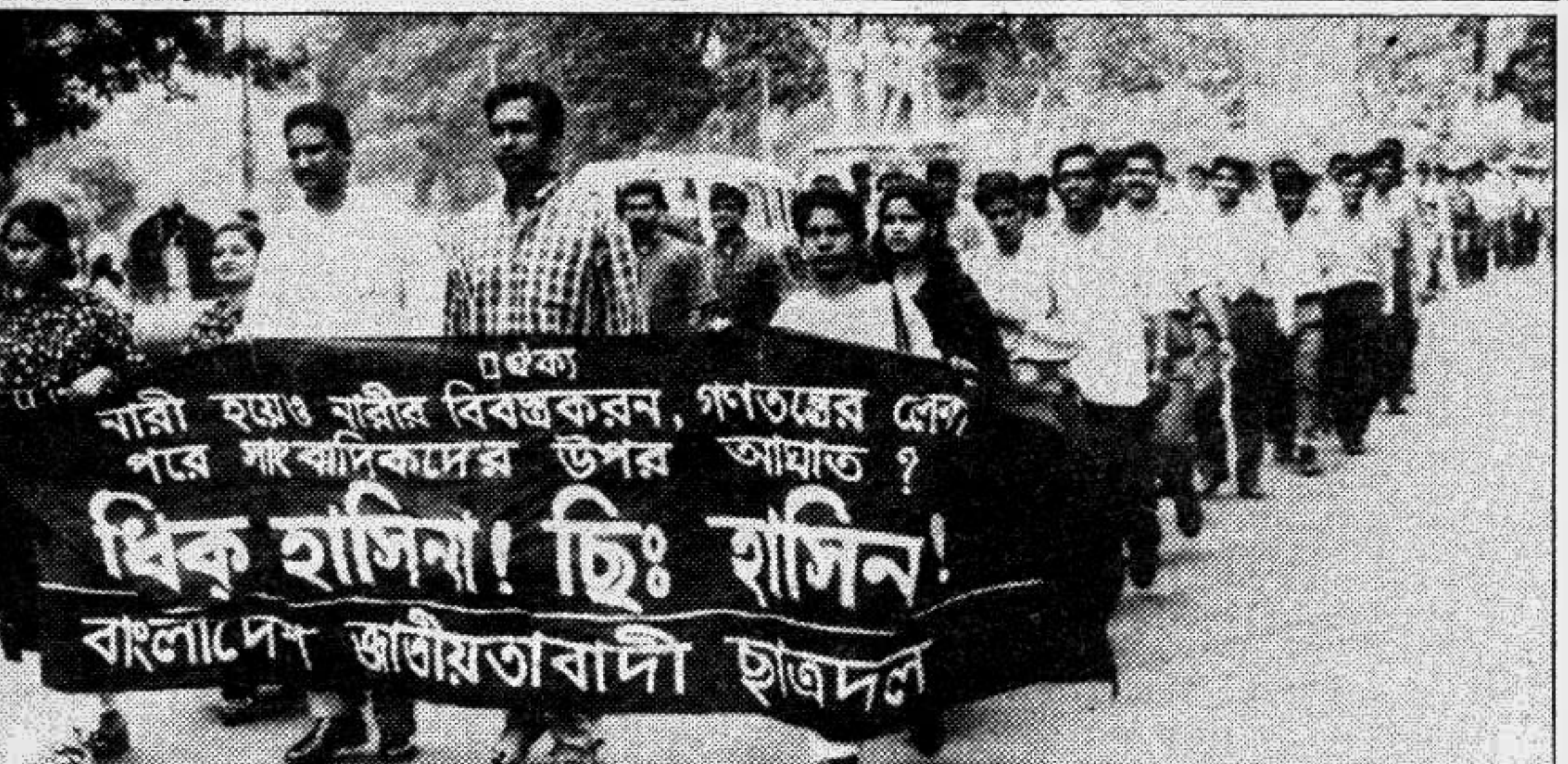
Jatiyatabadi Chhatra Dal (JCD) brought out a silent procession yesterday protesting the police action on women and journalists during May 11 hartal in the city. — Star photo

Jatiyatabadi Chhatra Dal (JCD), student wing of main opposition BNP, brought out a silent procession on the Dhaka University campus yesterday to protest the police action on women BNP activists and journalists in the city during Tuesday's half-day hartal.