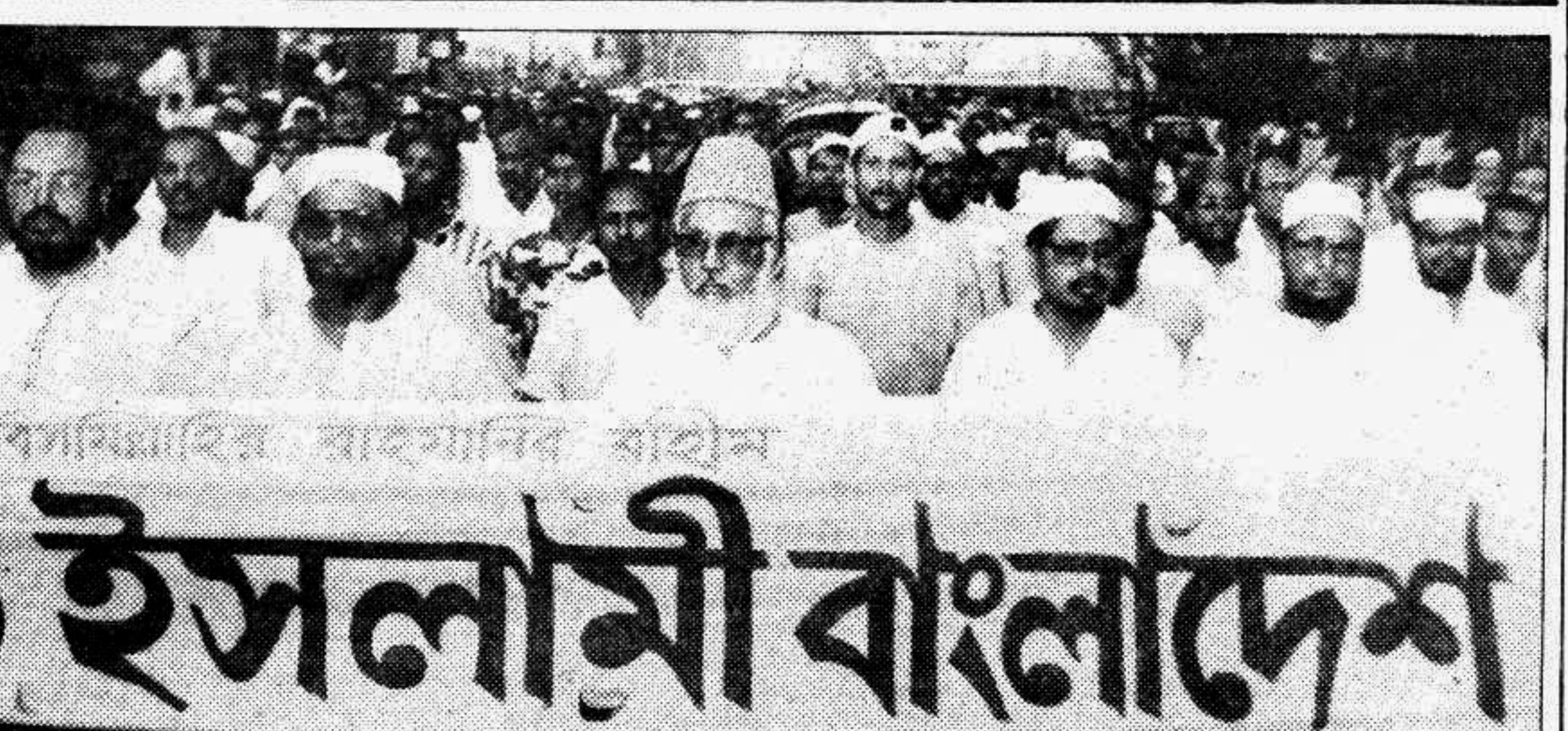
A Jamat-e-Islami Bangladesh procession protesting the police action on a BNP procession and assault on journalists during Tuesday's hartal.