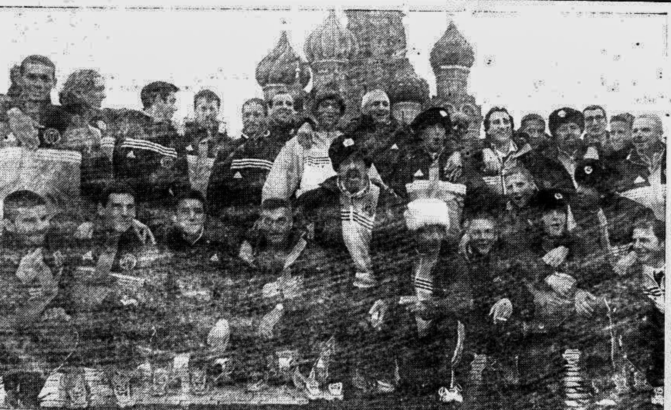
MARSEILLE IN MOSCOW: Olympique Marseille booters posing at Moscow's historic Red Square yesterday.