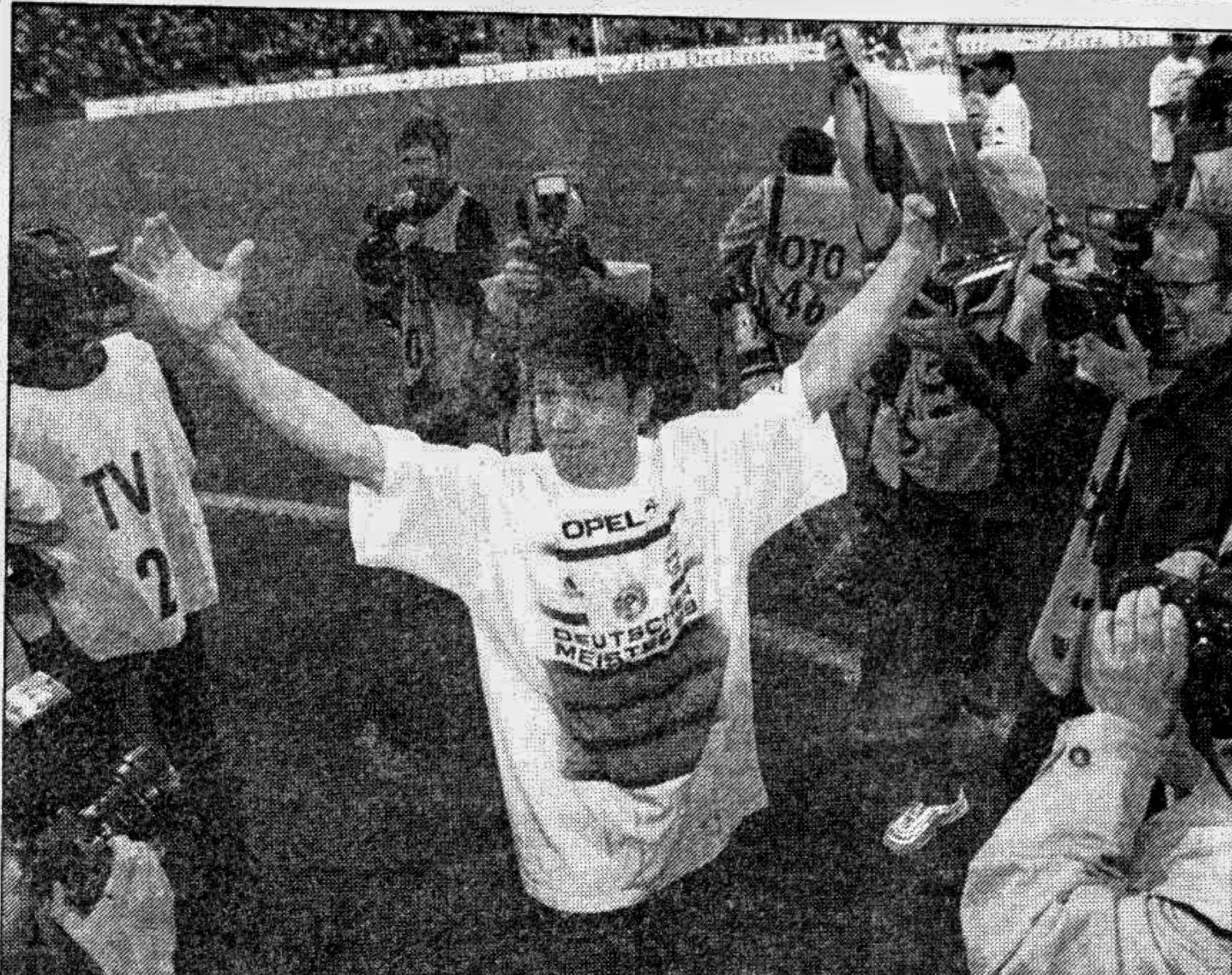
BAYERN RULES BUNDESLIGA: Veteran Bayern Munich libero Lothar Matthaus leads the celebration after his team ensured the Bundesliga title with a 1-1 draw against Hertha Berlin at Munich on May 9.