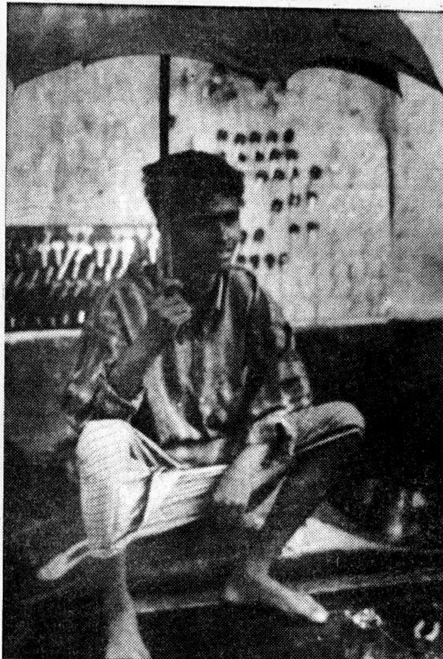
A vendor sits helplessly on the pavement as yesterday's downpour forced him to pack up for a few hours.

BNP Standing Committee members, central and local leaders will join the procession.