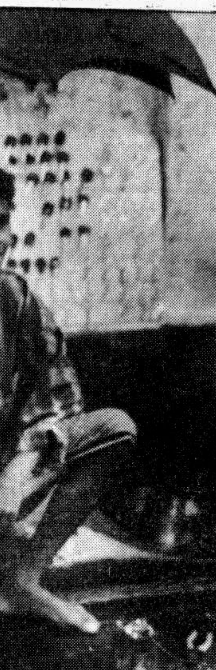
The day's programme began with the ceremonial hoisting of the national and Red Crescent flags at the premises of Holy Family Red Crescent Hospital Nursing School.