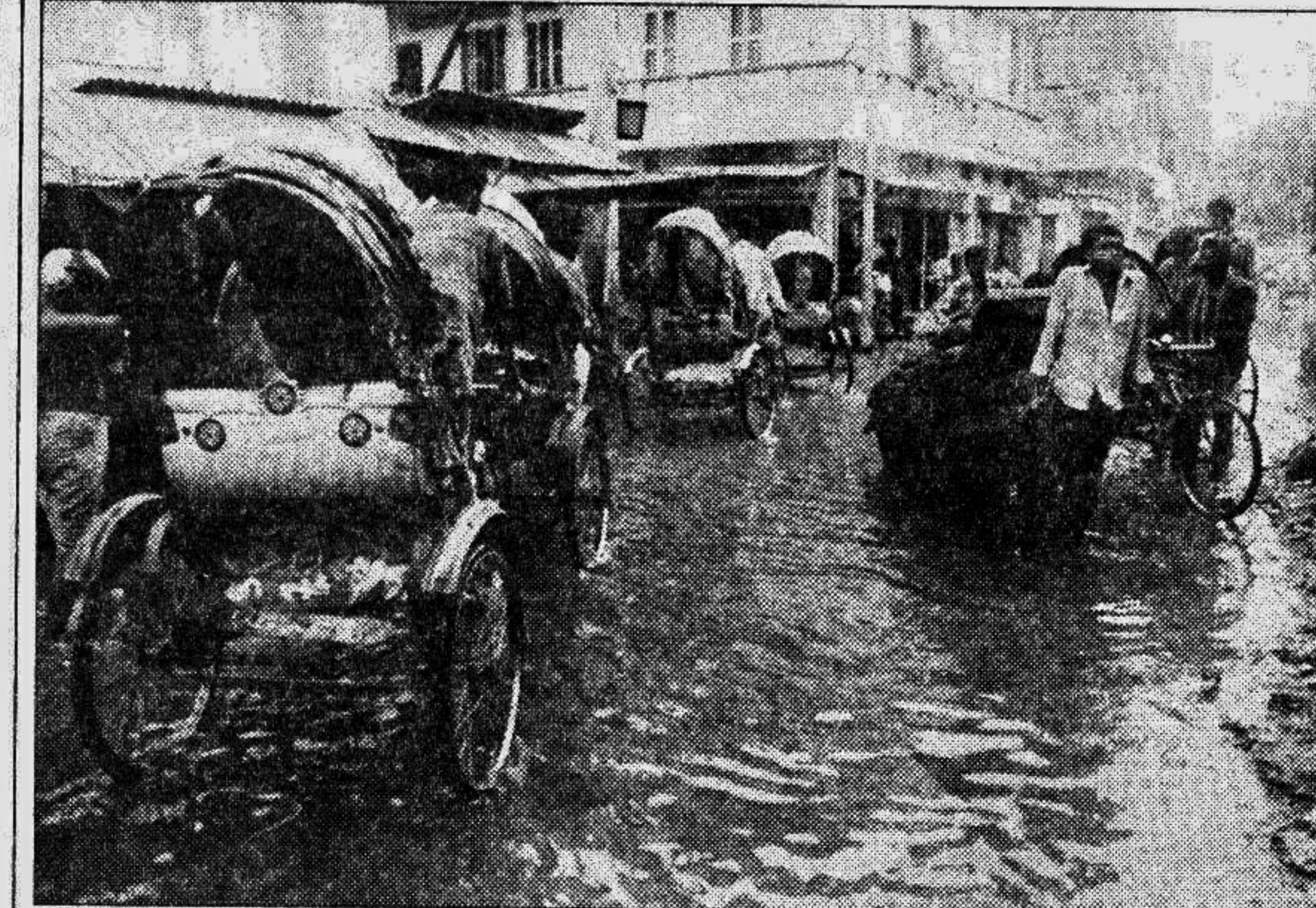
Although the shower brings relief to people amidst unbearable dry spell, some city areas went under water following yesterday's rain. The picture was taken from Nittali area.

Apart from apprising the successes of the government during the last three years and its frantic effort to overcome present power crisis, they will also tell people about the "conspiracy being hatched by the opposition."