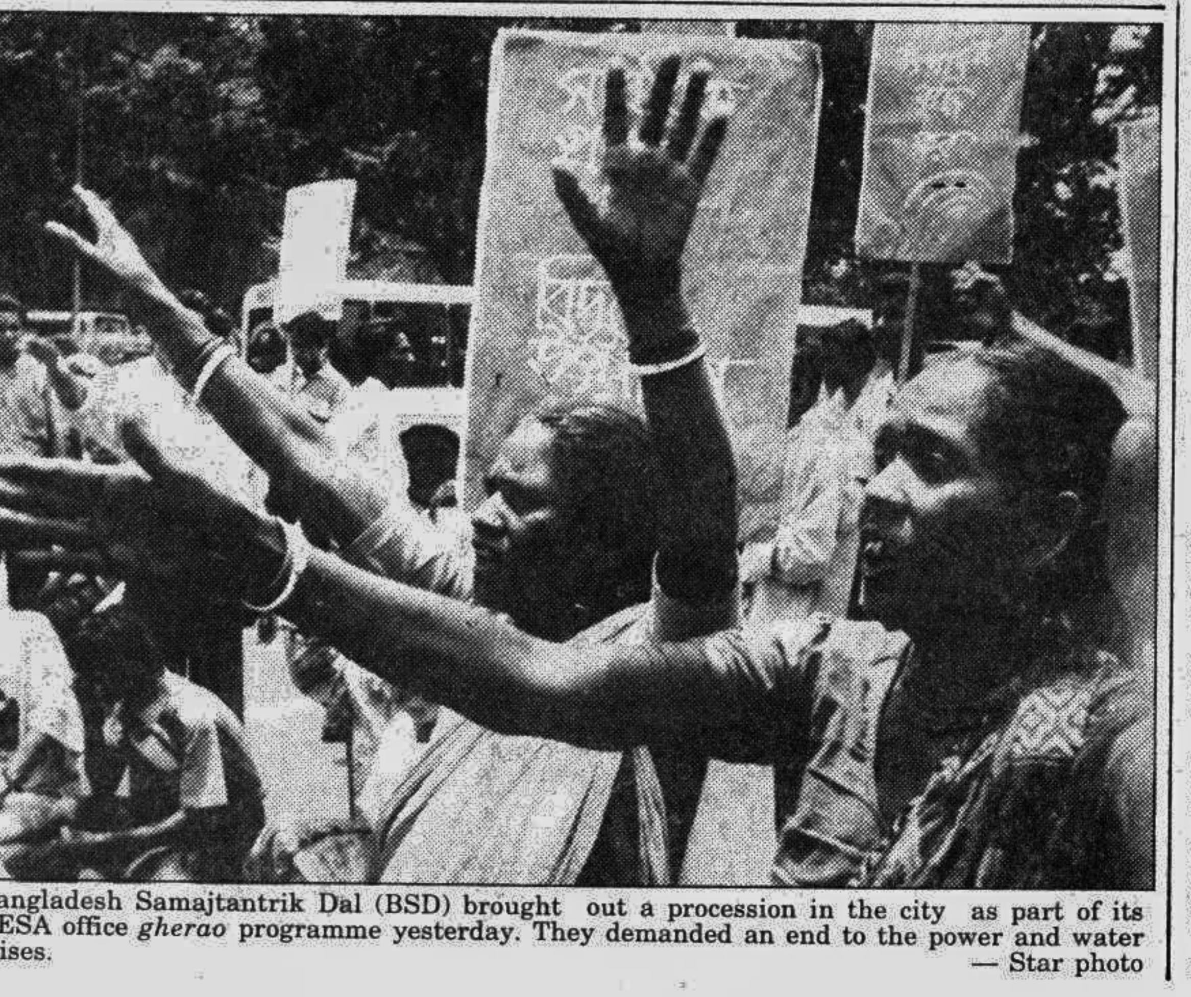
Bangladesh Samajtantrik Dal (BSD) brought out a procession in the city as part of its DESA office gherao programme yesterday. They demanded an end to the power and water crises.

Minister of State for Information Prof Abu Sayeed yesterday urged BNP chief Begum Khaleda Zia to pursue sound and healthy democratic political activities instead of indulging in indecent, distasteful and anti-state politics, reports BSS. In a statement, the state minister pointed out that as the people's organisation the Awami League had struggled for protecting the rights of the people, liberated the country and finally established democracy on a sound footing through bringing an end to autocracy. Prof. Sayeed said yesterday the Awami League under the leadership of Prime Minister Sheikh Hasina has been putting in relentless efforts to find solutions to the accumulated problems left by the post-75 governments by institutionalizing democracy, introducing rule of law, ensuring the right to vote and food. But at the same time Begum Zia is dreaming to recapture power through killings, coups and conspiracies, which the people will never let it happen. The state minister condemned the BNP chief Begum Zia for her recent 'undemocratic, false, concocted and motivated statements and said these have reflected the mental imbalance of Begum Zia.