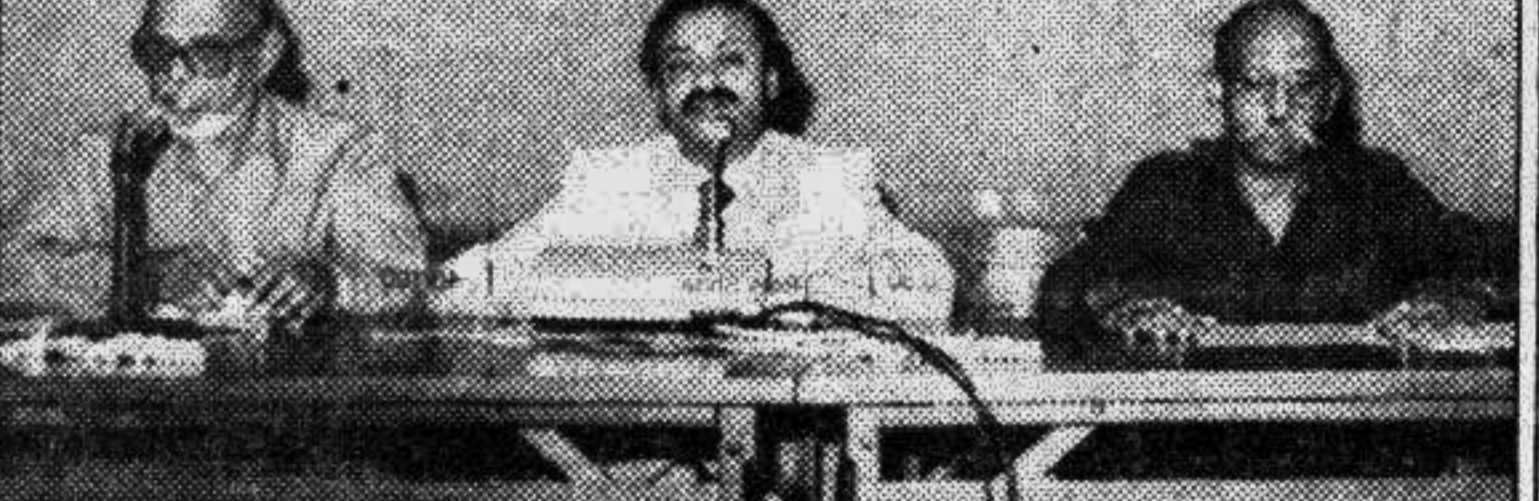
Abul Hasan Chowdhury, Minister of State for Foreign Affairs speaking at a roundtable on 'Kosovo Crisis: Aspects of Concern', organised by the Centre for Strategic and Peace Studies at the CIRDP auditorium in the city yesterday.