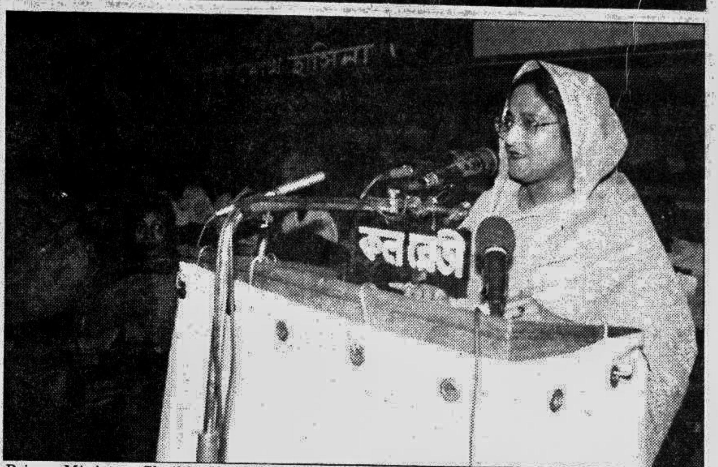
Prime Minister Sheikh Hasina addressing the eighth national conference of the Bangladesh Teachers' Association at Mirpur Shaheed Suhrawardy Indoor Stadium yesterday.

SIRAJGANJ, May 5: Minister for Home, Post and Telecommunications Mohammad Nasim today categorically said the Upazila elections would be held on time with the all-out participation of the people, reports BSS. He said the nation had widely participated in the Poursava polls without caring about the hartal called by the oppositions and they would also demonstrate the same spirit during the coming Upazila polls. The nation wants peace and tranquillity, not hartal or similar programme which are detrimental to development now being carried out by the present government to achieve the national goals, the minister said while addressing four separate public meetings in Tangal and Sirajganj districts today. The meetings were organised in connection with opening two new thanas both East and West sides of the Bangabandhu Bridge and inaugurating the new building of Ullapara thana under Sirajganj district. Besides, the minister addressed a large public meeting at Ullapara College Ground organised by the local unit of Awami League. The meetings were also addressed by Abdul Mannan MP, Chairman of the Parliamentary Standing Committee on Home Ministry Advocate Rahmat Ali MP, Abdul Latif Siddiqi MP, Abdul Latif Mirza MP, Inspector General of Police A Y B Siddiqi and Local Awami League leaders.