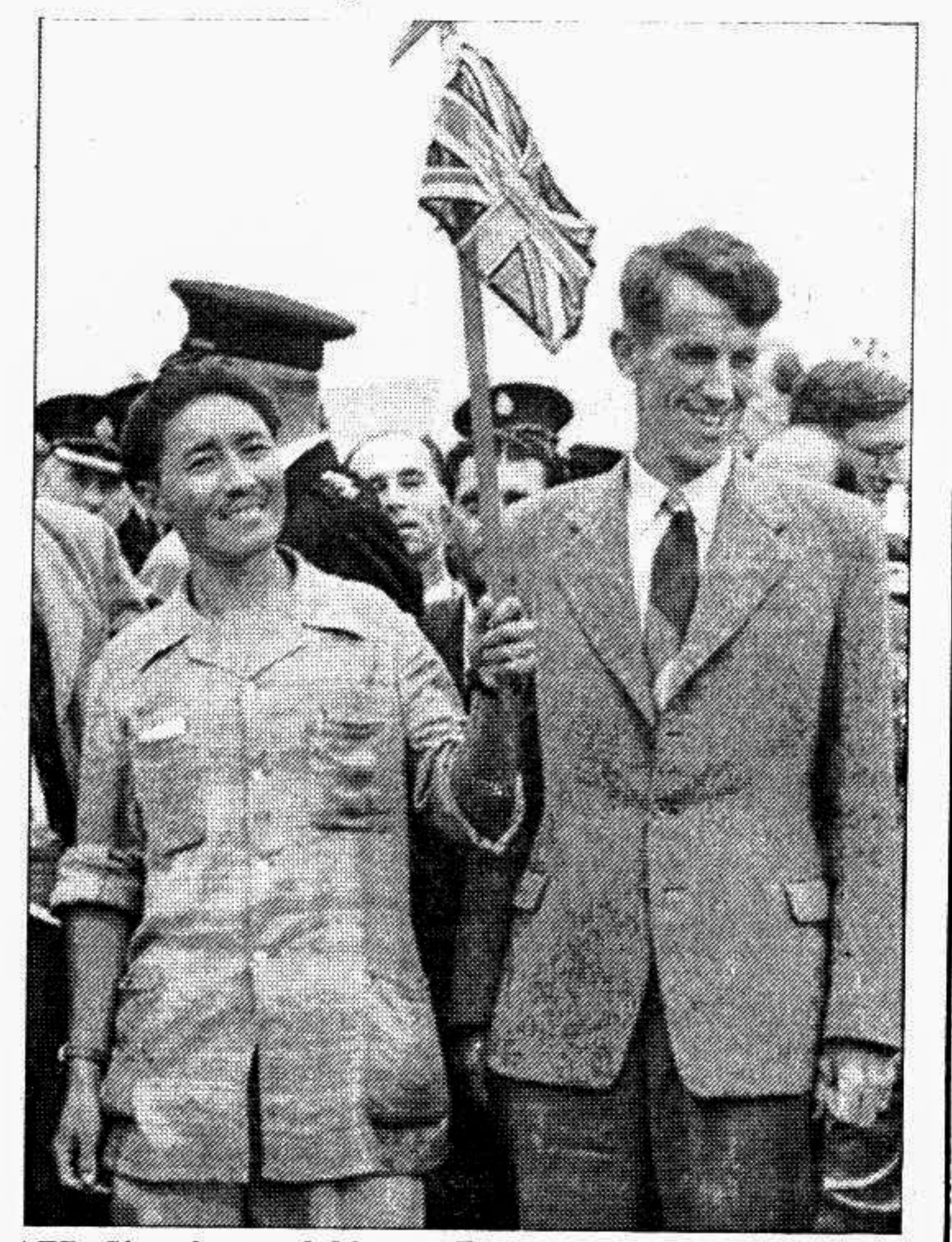
AFP file photo of Mount Everest conquerors Edmund Hillary (R) and Sherpa Tenzing Norgay (L) at London's Heathrow airport on their arrival from the expedition on July 3, 1953.

"I've always regarded him with great admiration as the original hero of Everest."