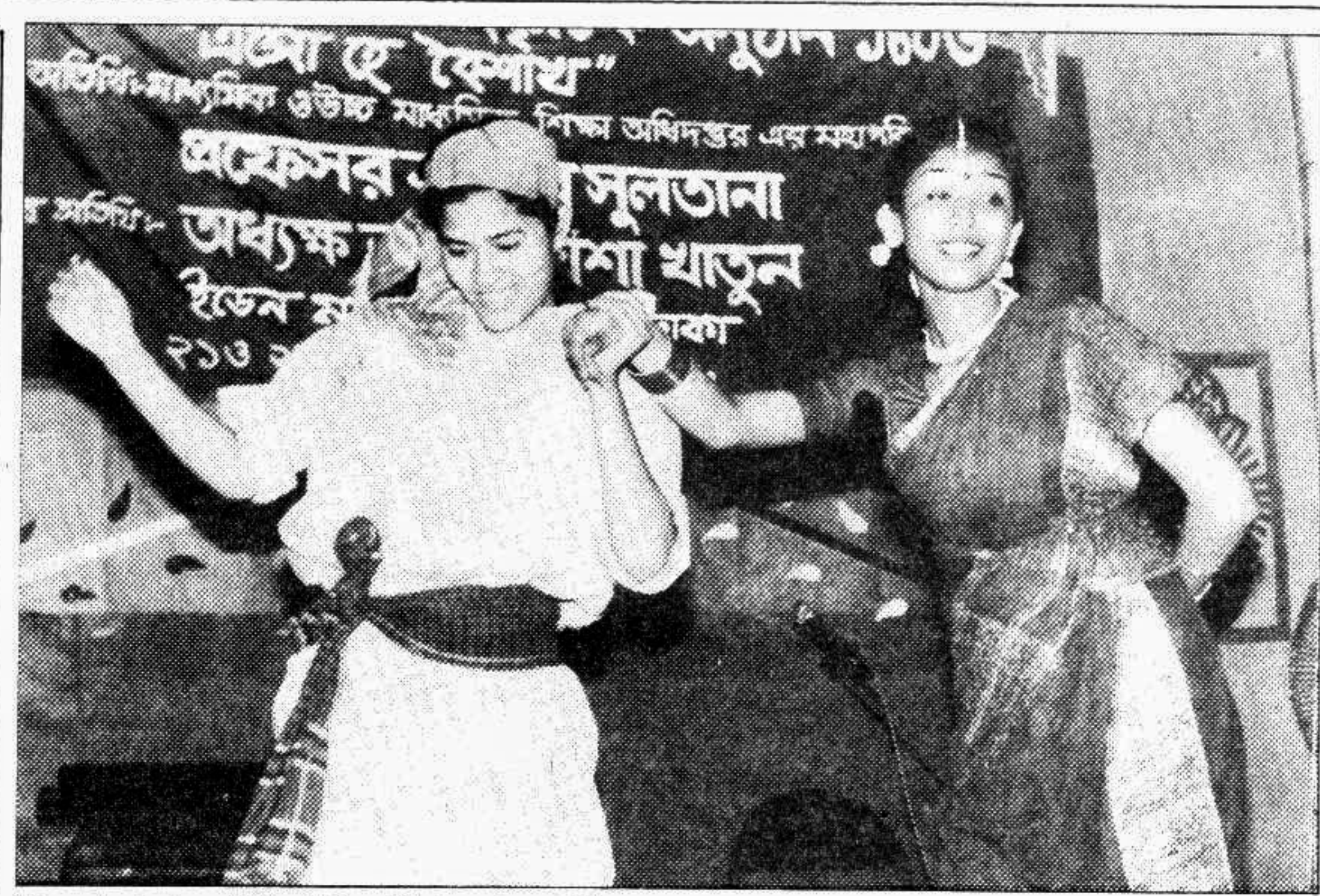
The students of the Eden University College held a cultural function on the campus yesterday welcoming the freshers and the Bangla New Year.

A bit of prudent use of electricity, keeping the consumption to the minimum, could save a lot, experts say. But no one seems to be paying any attention to that.