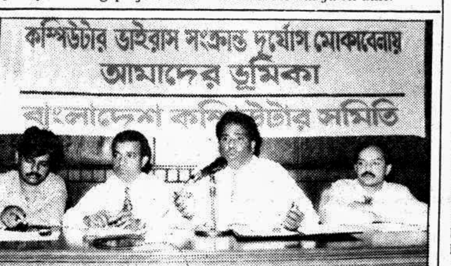
Bangladesh Computer Samity members speaking on its role to face computer virus at a function in the city yesterday.

A milad mahfil marking the death anniversary will be held on Friday, after Asr prayers at Khehlagar premises of the Officers' Club, Bally Road in the city. He died on May 3, 1998.