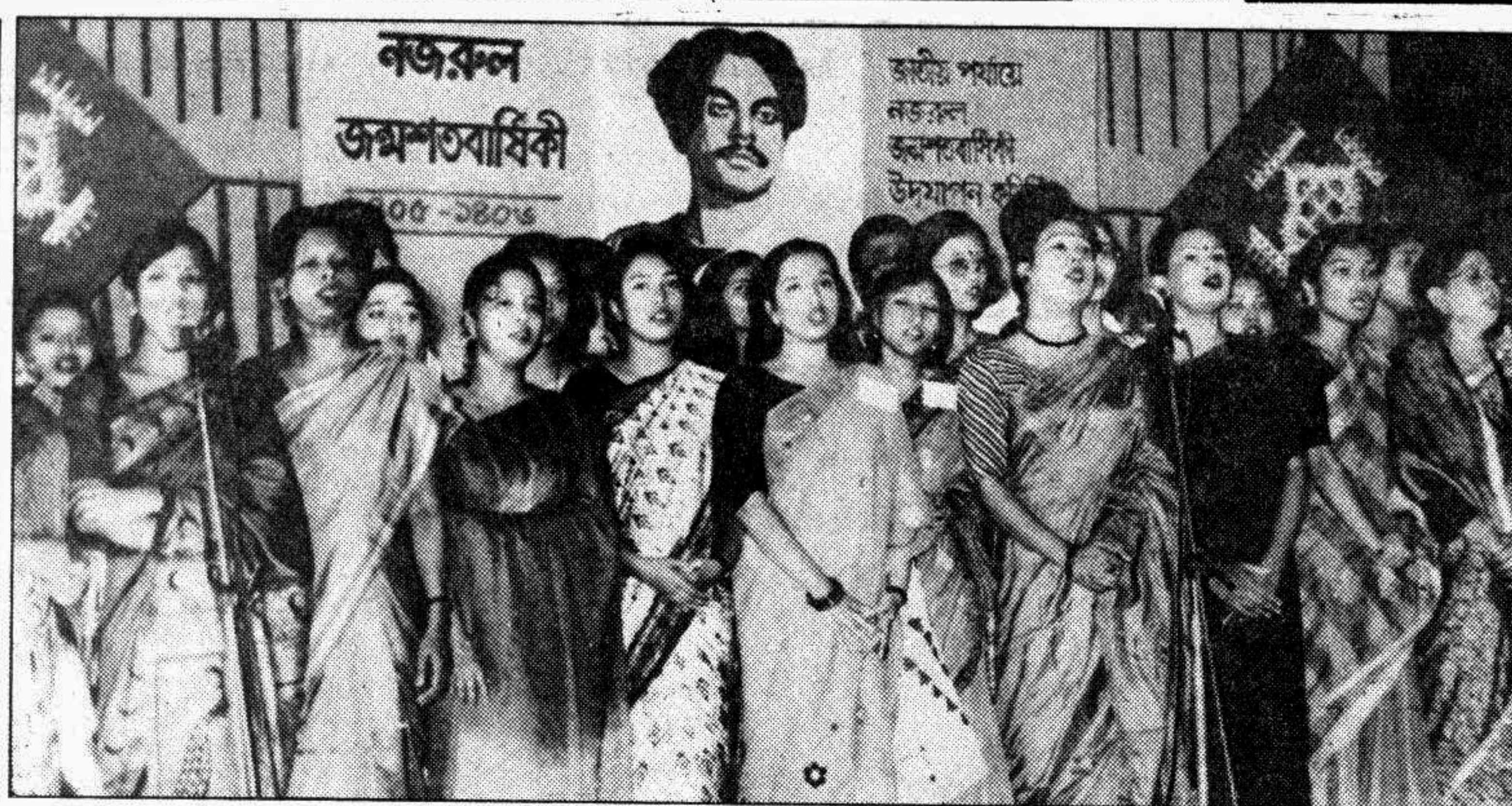
The committee to observe the birth centenary of the National Poet Kazi Nazrul Islam at national-level held a cultural evening at the auditorium of the National Museum in the city yesterday.

Ahern, pledging greater involvement by Ireland in a Palestinian state, said the hour-long talks had reviewed the problems faced by the Palestinian people, including economic, political and social issues.