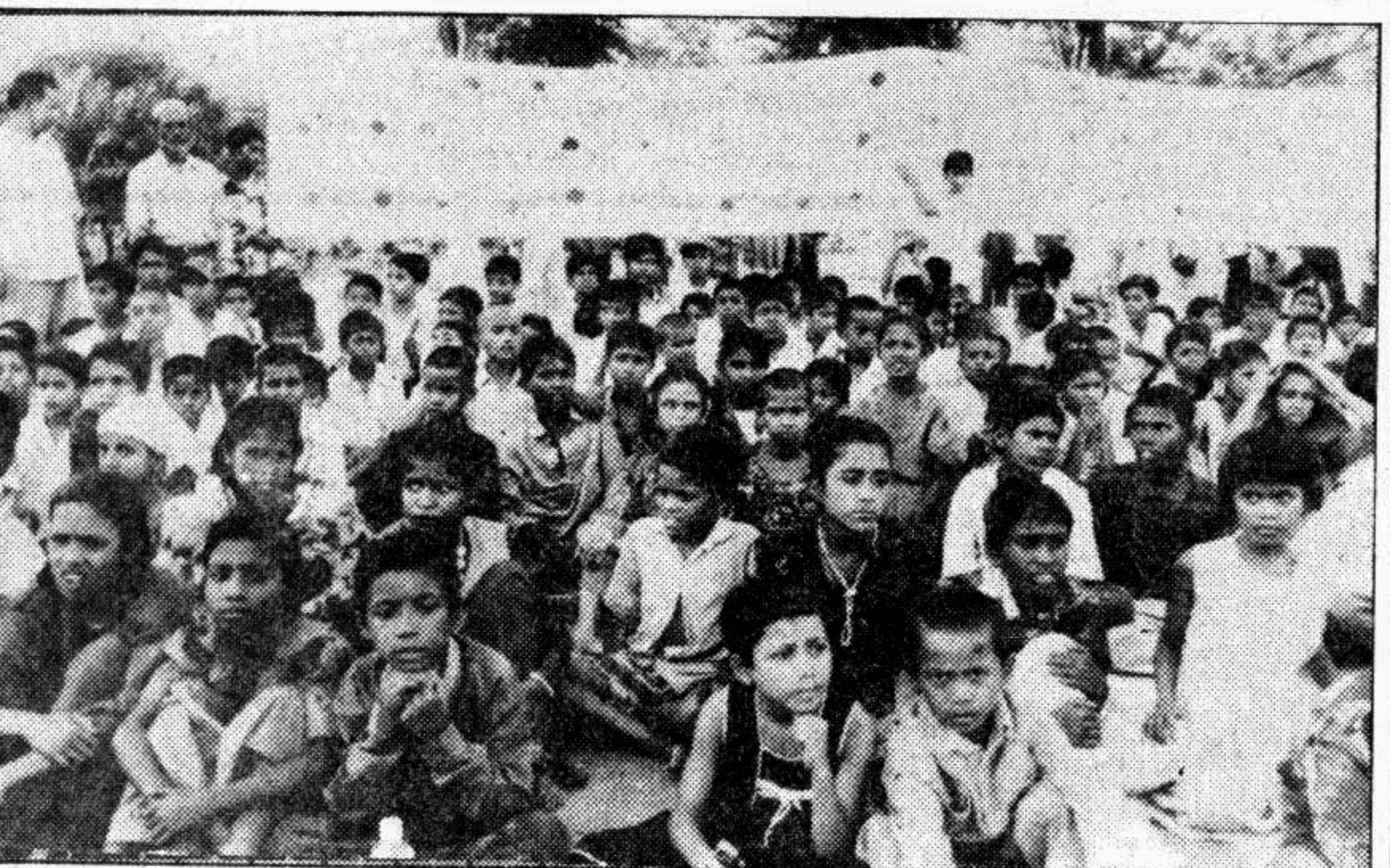
A child juvenile rally at the Central Shaheed Minar marking the birth anniversary of Shaheed Janani Jahanara Imam.

In another enquiry on 2.67 acres of land under Kamta Mouja, local people told the committee they did not see any house on this land at any time. But, over Tk 40 lakh was withdrawn from trees and over Tk 33 lakh taken away as compensation for houses.