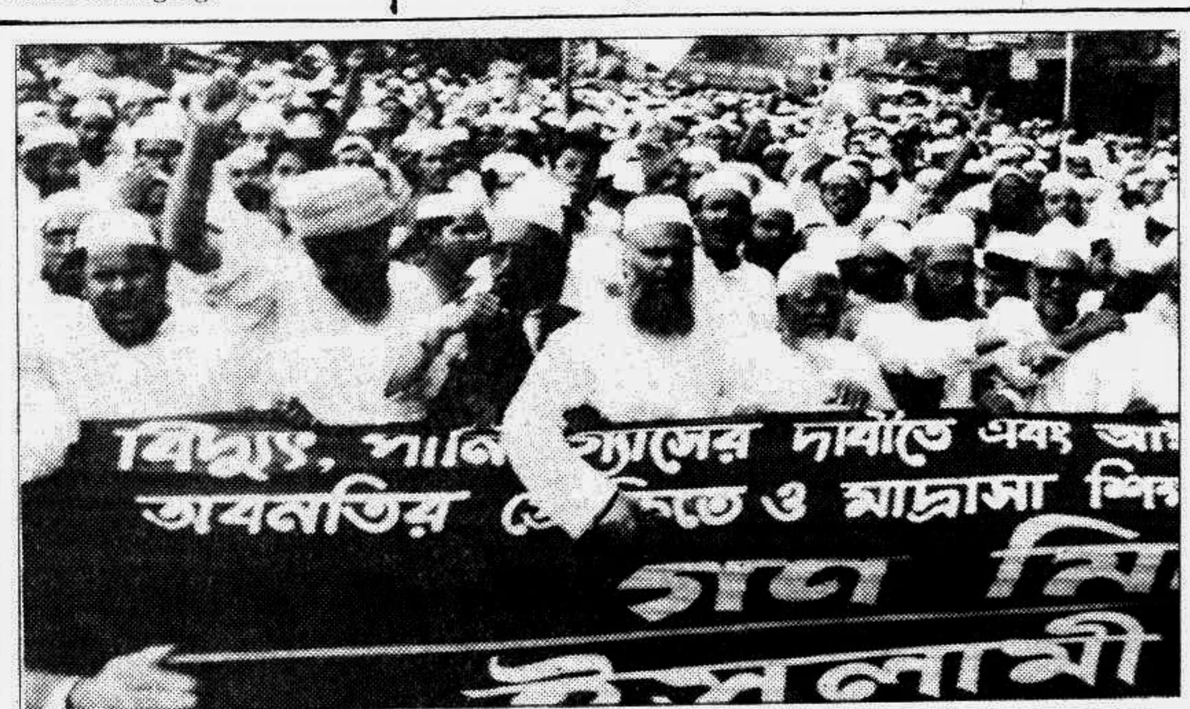
Islamic Oikya Jote (IJO) brought out a procession as part of 4-party called Mass Procession programme demanding smooth supply of electricity, gas and water in the city yesterday.

All preparations have already been completed in the district for holding this examinations scheduled to begin on May 6. About 12,000 students will appear at the examination under 27 centres this year.