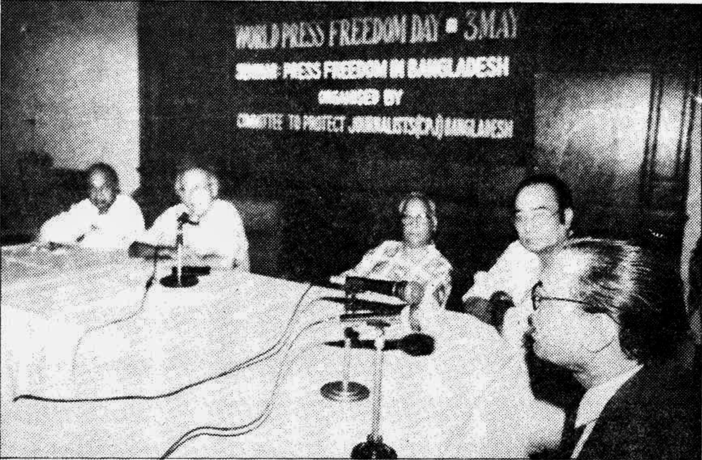
Committee to Protect Journalists, Bangladesh held a seminar on 'Press Freedom in Bangladesh' at the National Press Club in the city yesterday marking the World Press Freedom Day.