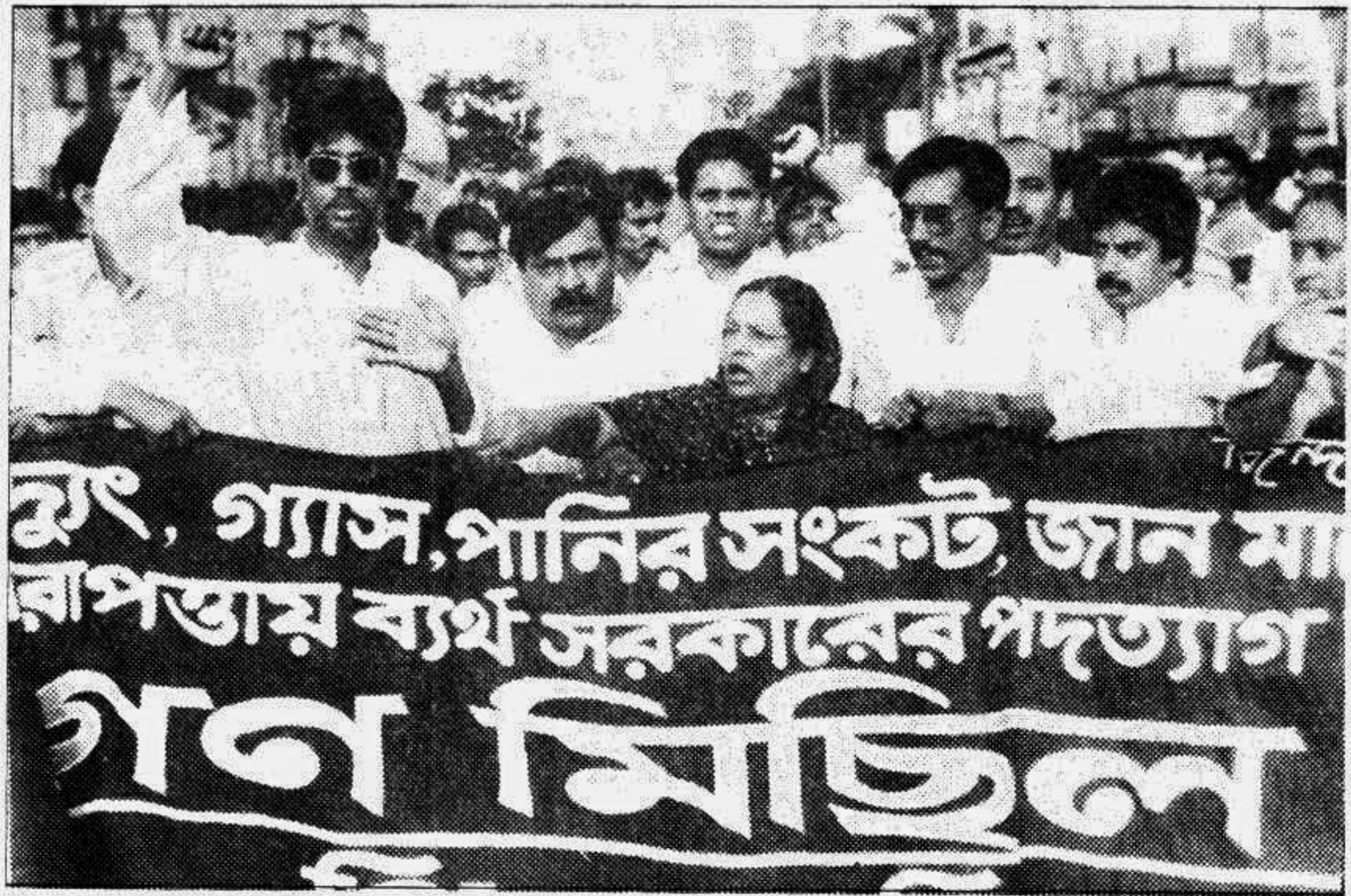
A PNP mass procession demanding smooth supply of power, water and gas in the city yesterday.