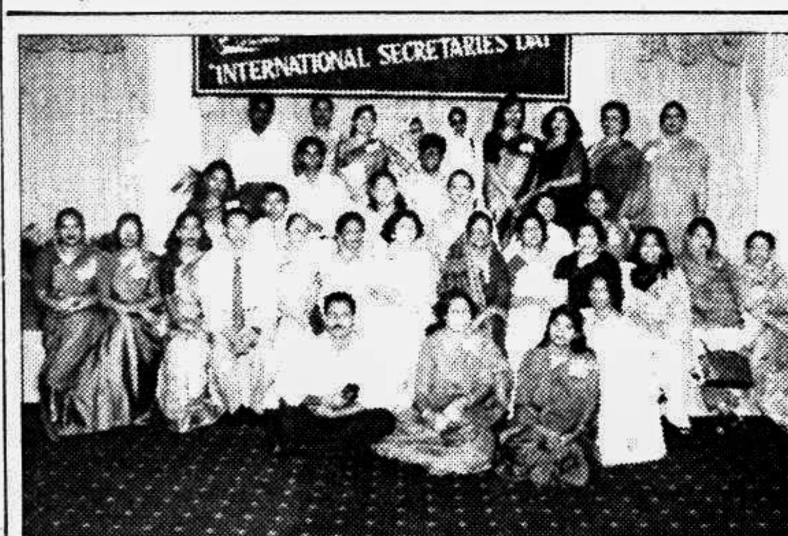
Members of Professional Secretaries Welfare Association (PSWA) attended a lunch at Hotel Sheraton on the Occasion of International Secretaries' Day on Saturday.