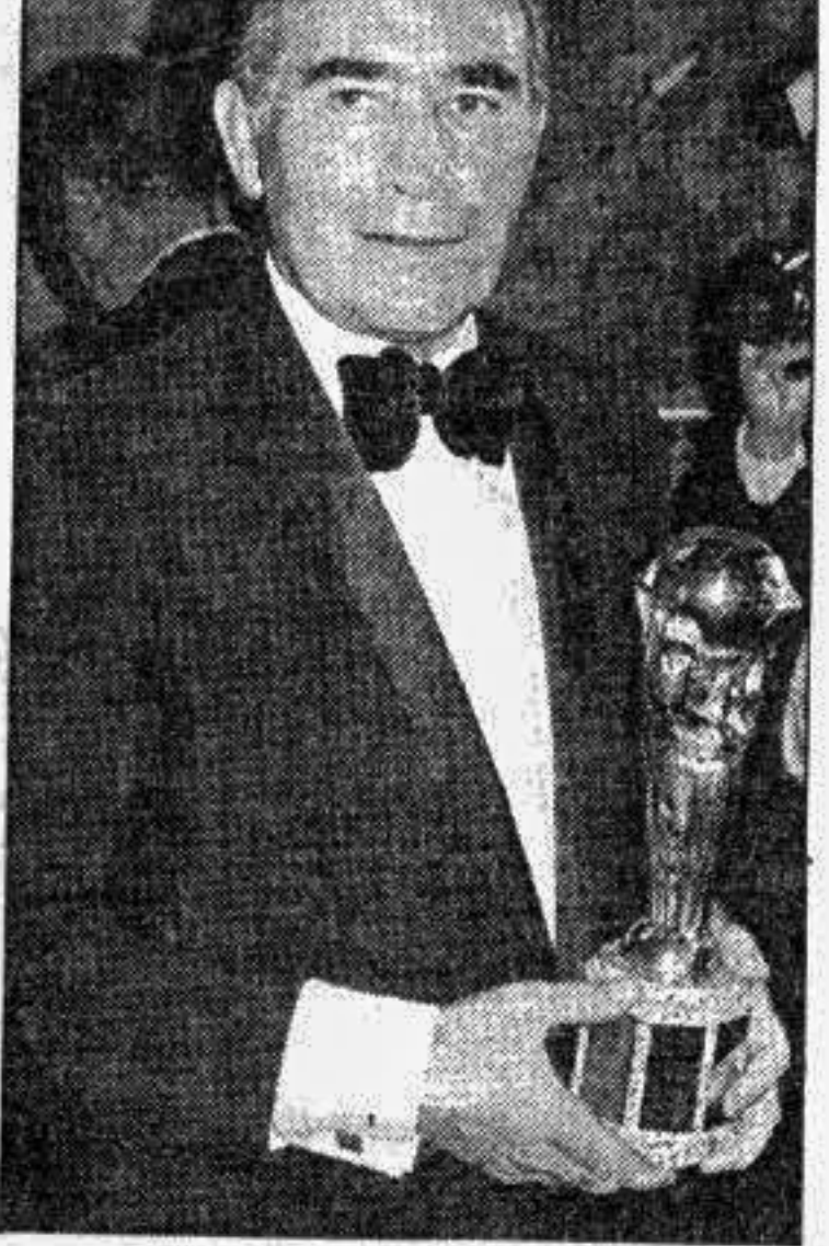
SIR ALF RAMSEY

him described Sir Alf as a quiet, determined and brilliant manager.