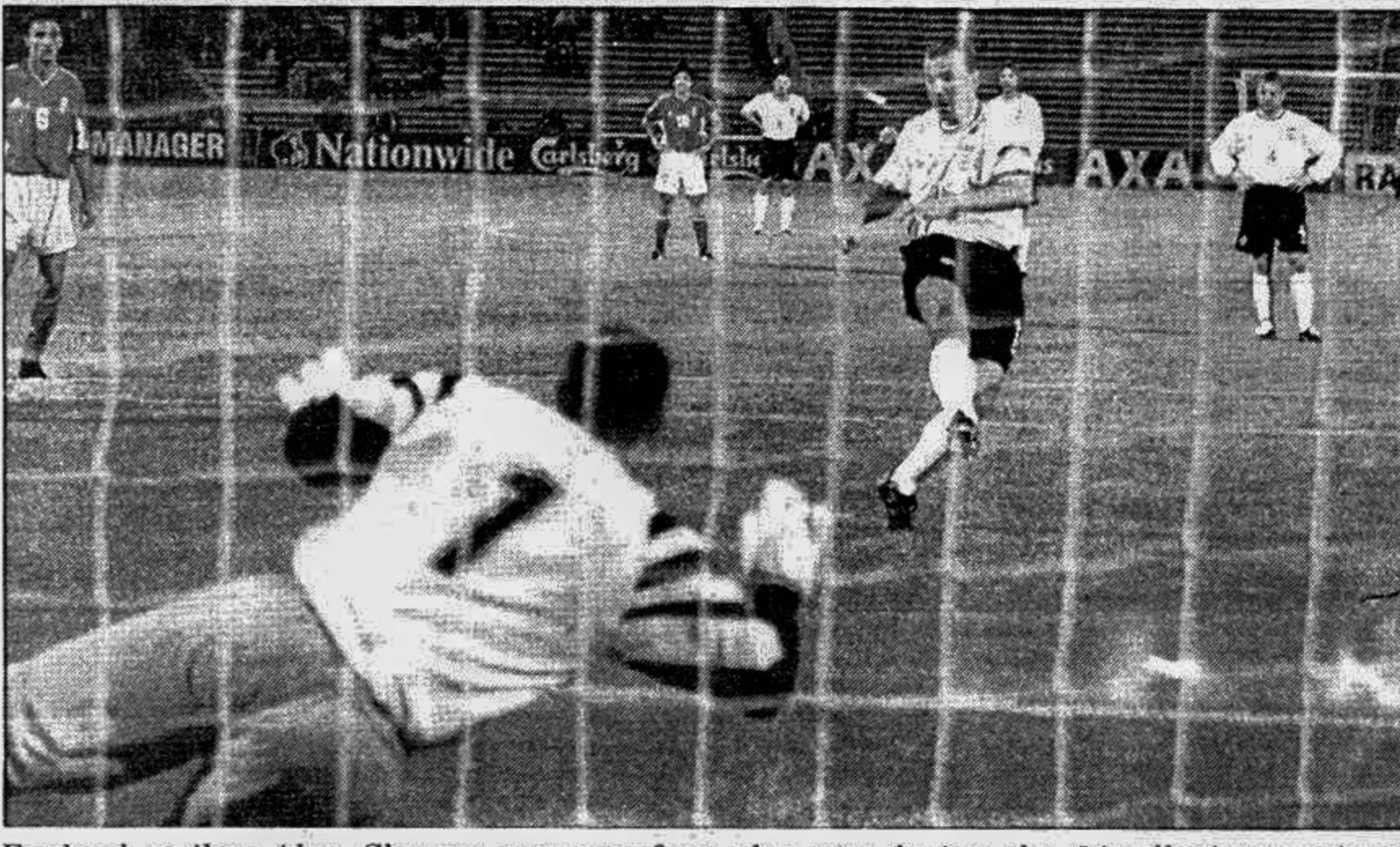
England striker Alan Shearer converts from the spot during the friendly international against Hungary on April 28. The match ended 1-1.