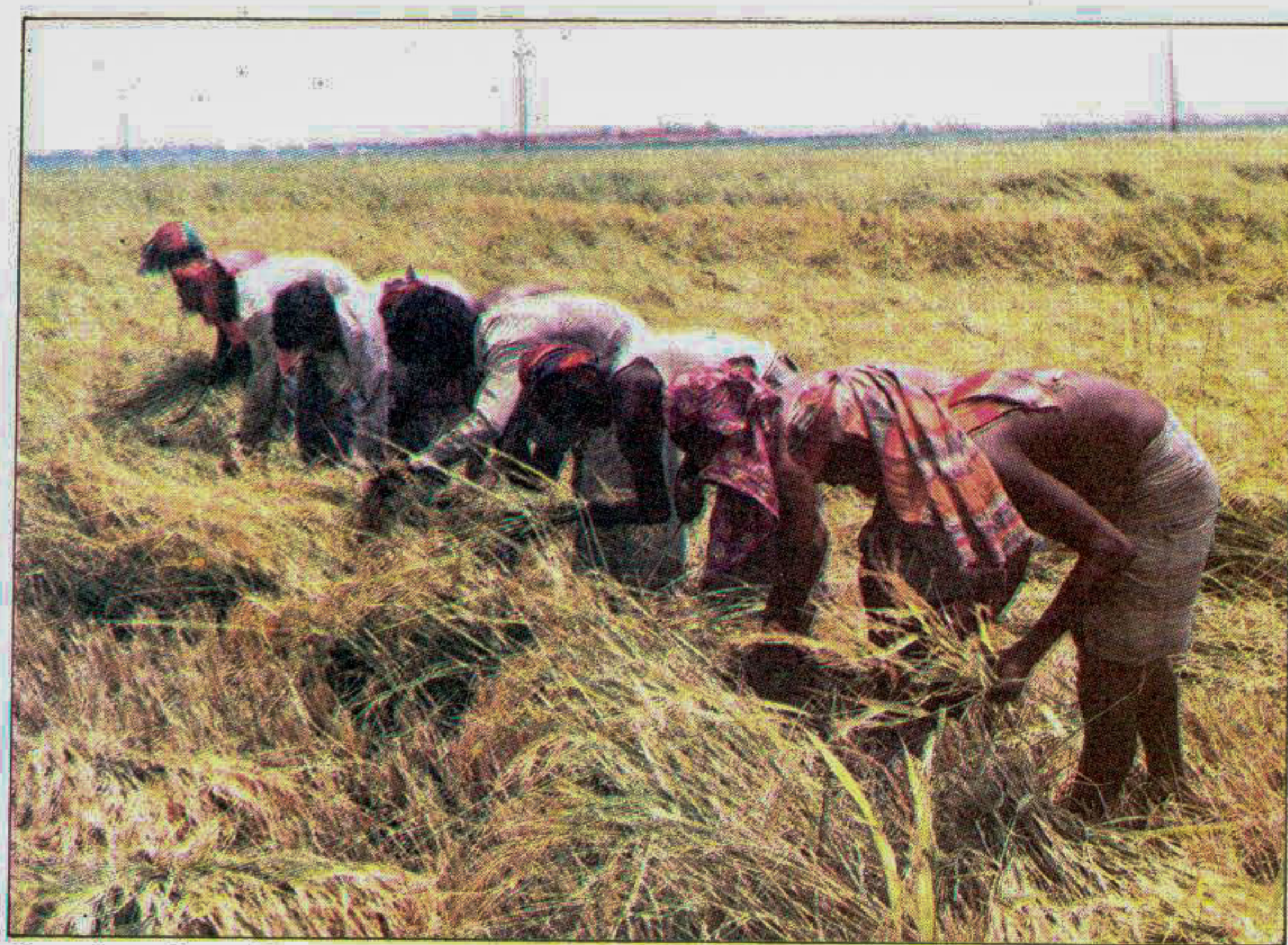
Reaping the toils