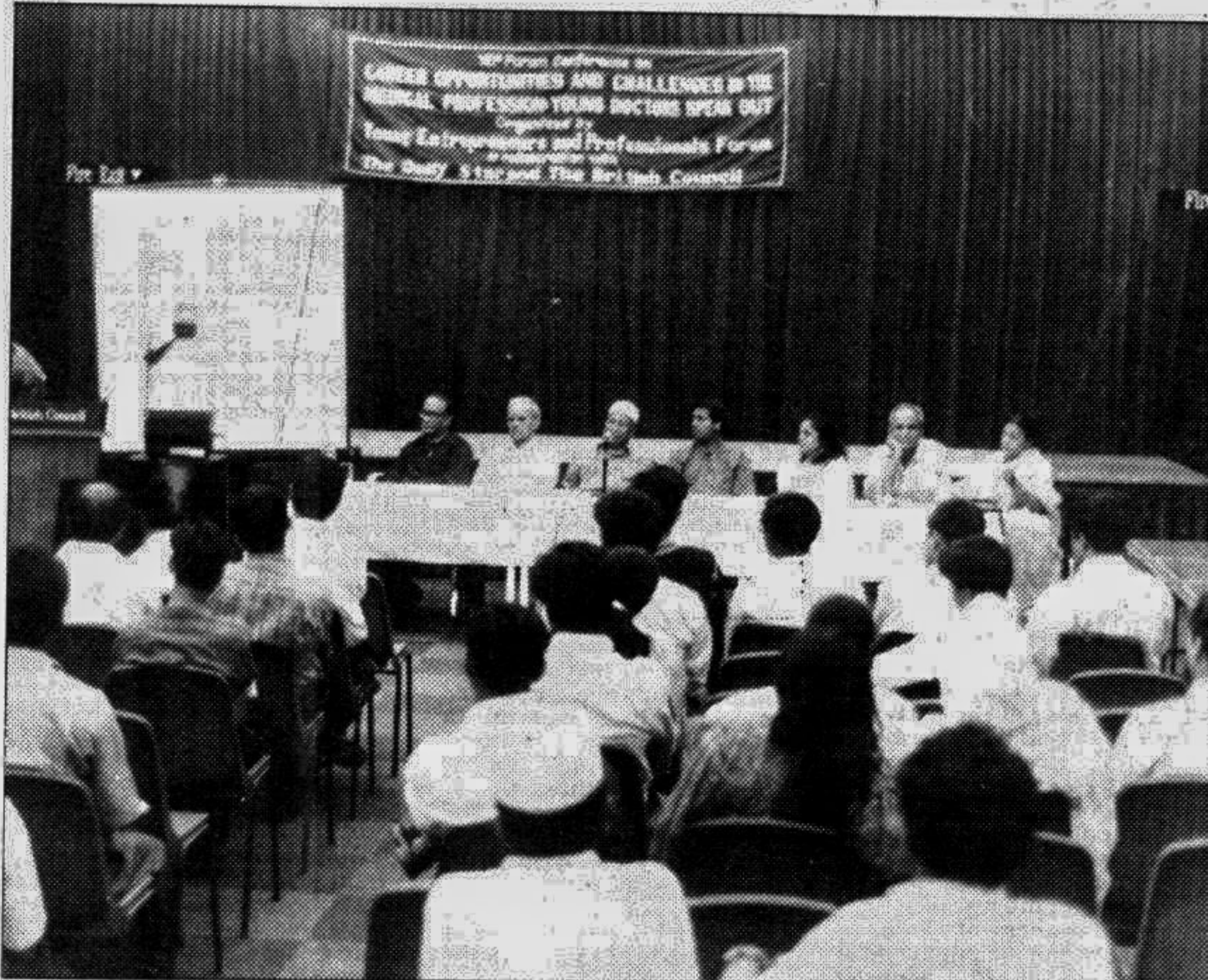
Young doctors' conference in progress.

Approximately eighty young doctors participated in the conference.