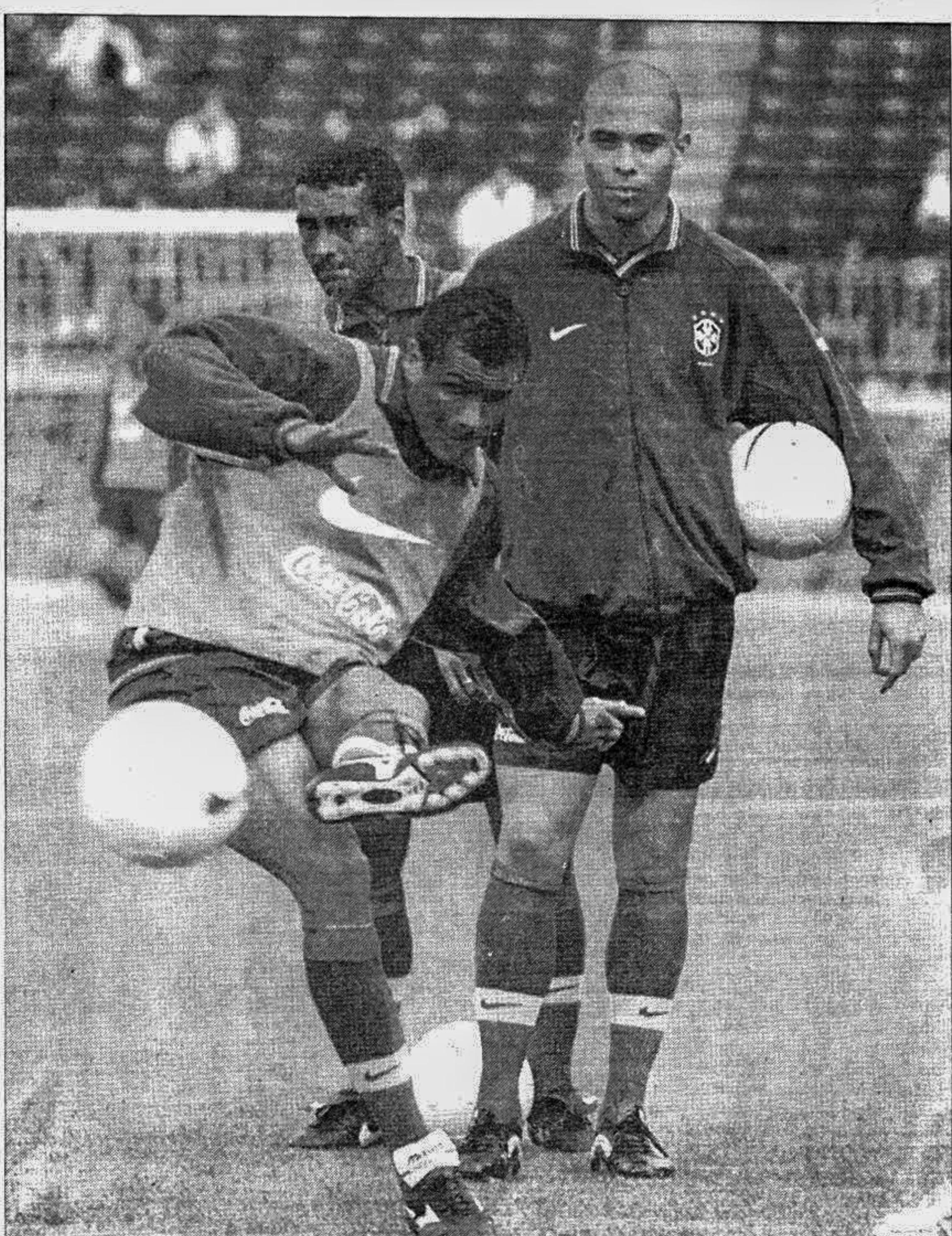
AWESOME, THREESOME, R-SOME! Superstrikers Rivaldo (front), Ronaldo (R) and Romario practicing during Brazil's practice at Nou Camp on April 27. Brazil play Barcelona on April 28.