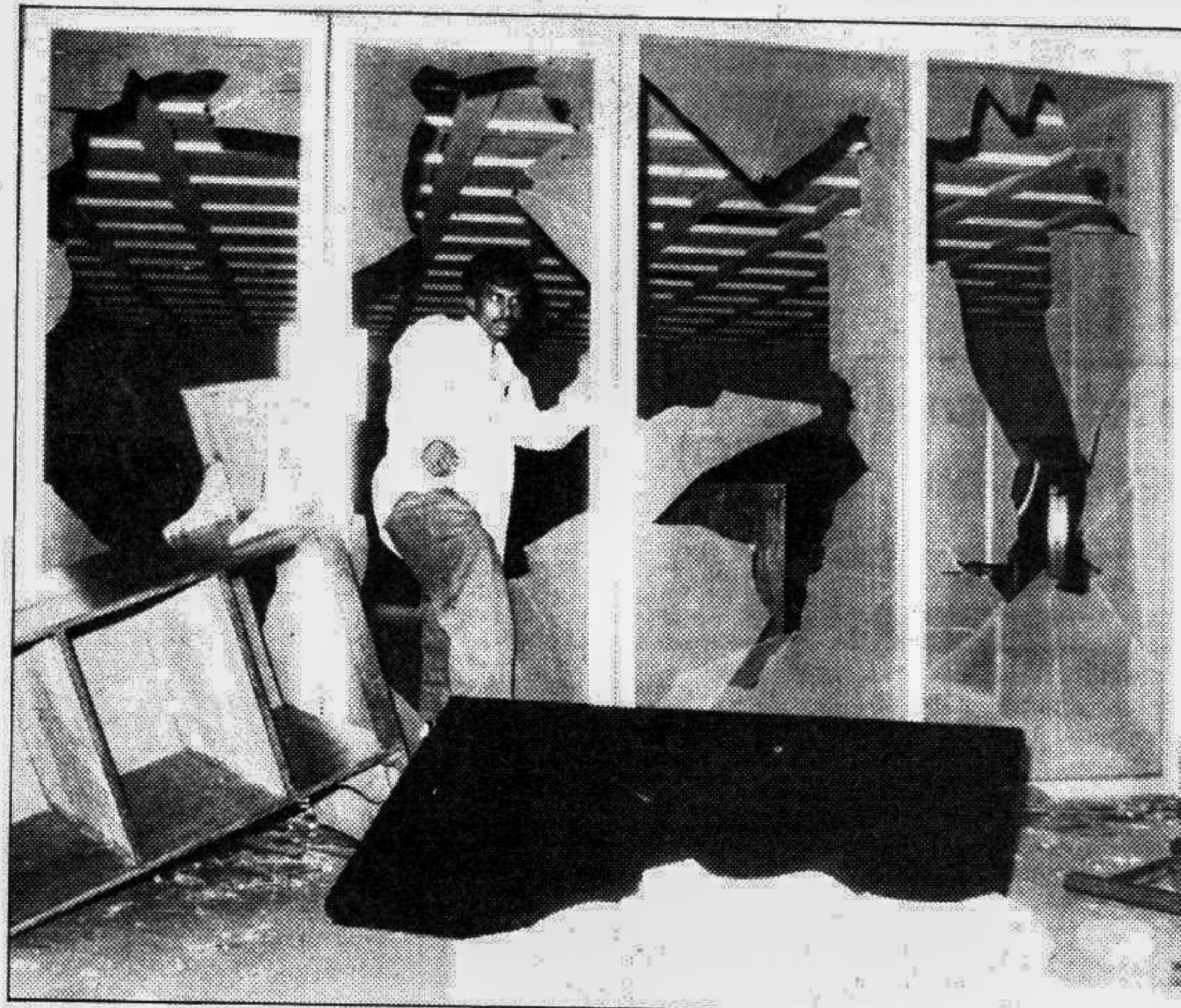
Shattered door glass of the Council Office at BUET after the rampage by students in protest of the temporary expulsion of a pupil.

The student, who was initially expelled for two years, later got his punishment reduced to one year following students' appeal to the university's See Page 12 Col 7