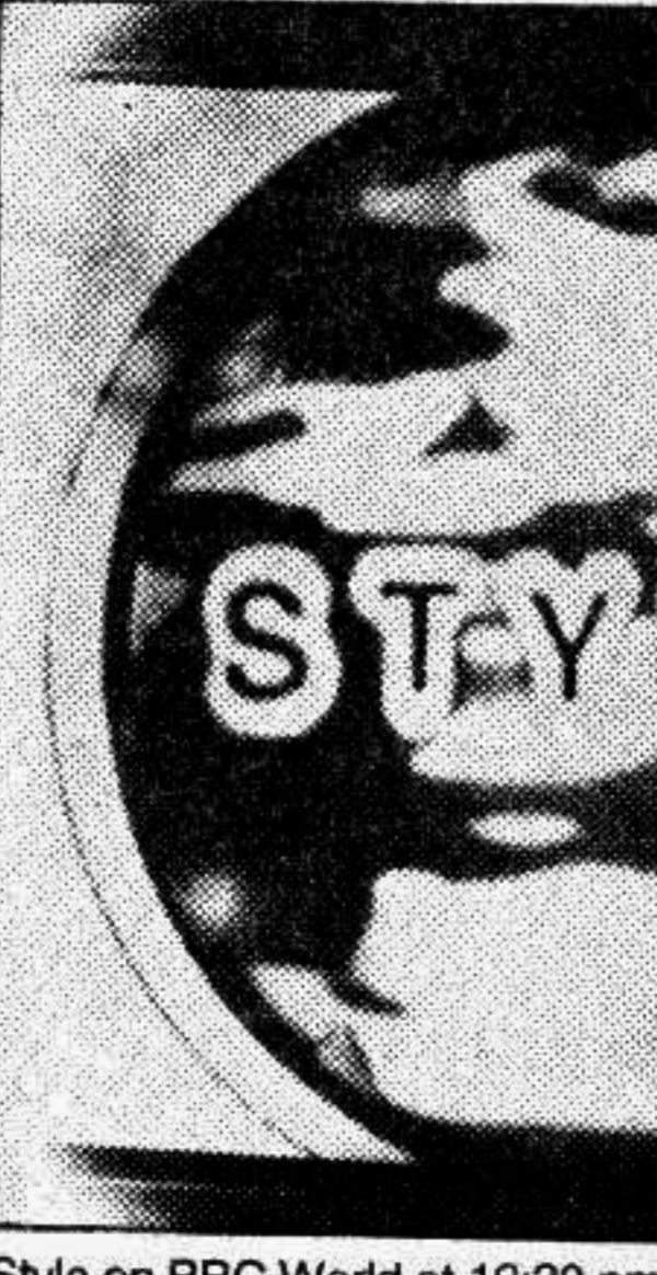
Style on BBC World at 12:30 pm

6:00 Islamic Programme 7:00 Drama Serial 8:00 Priyo Shilpi Priyo Gan 8:30 Haraye Khunji 9:00 Ladies Prog 9:30 Horoscope Prog 10:00 Bangla Film: Mohanayok