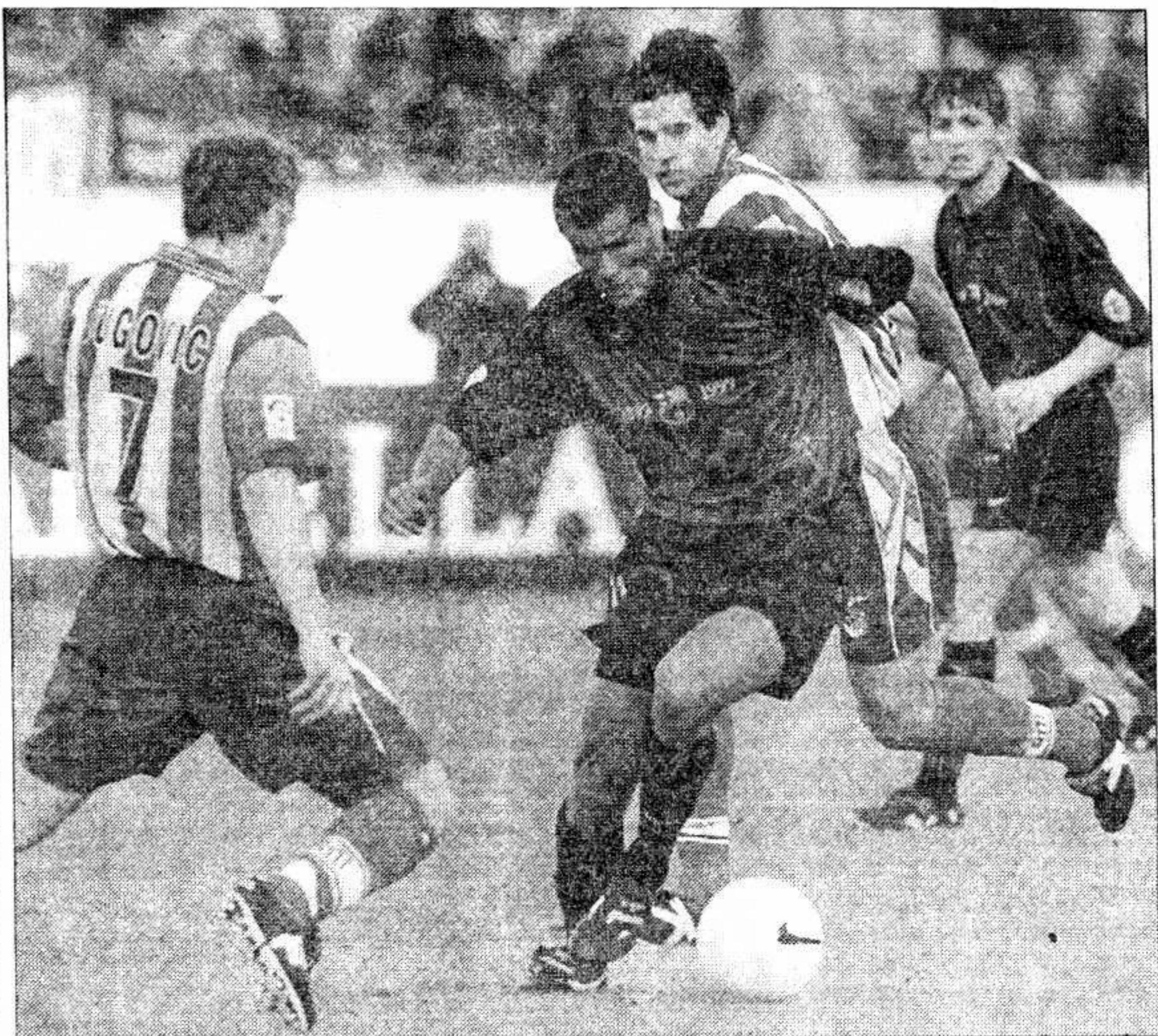
Barcelona's Brazilian superstar Rivaldo (C) looking for a way through a number of Atletico Madrid defenders during their Spanish Primera Liga clash at Madrid on April 25.