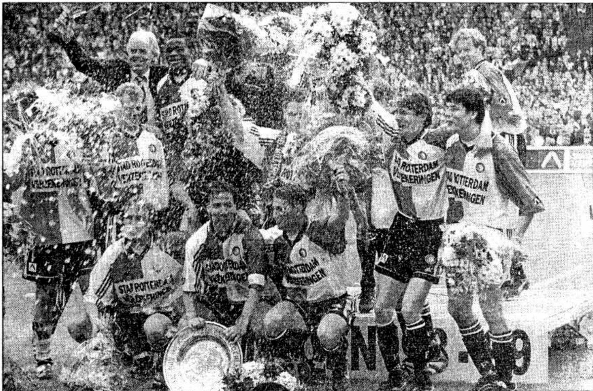
WE ARE THE CHAMPIONS: Jubilant Feyenoord players are showered with champagne at the victory podium after securing the Dutch First Division title at Rotterdam on April 25 with a 2-2 draw with NAC Breda.

Vitesse Arnhem gave up the title ghost when they lost 3-1 at Nijmegen.