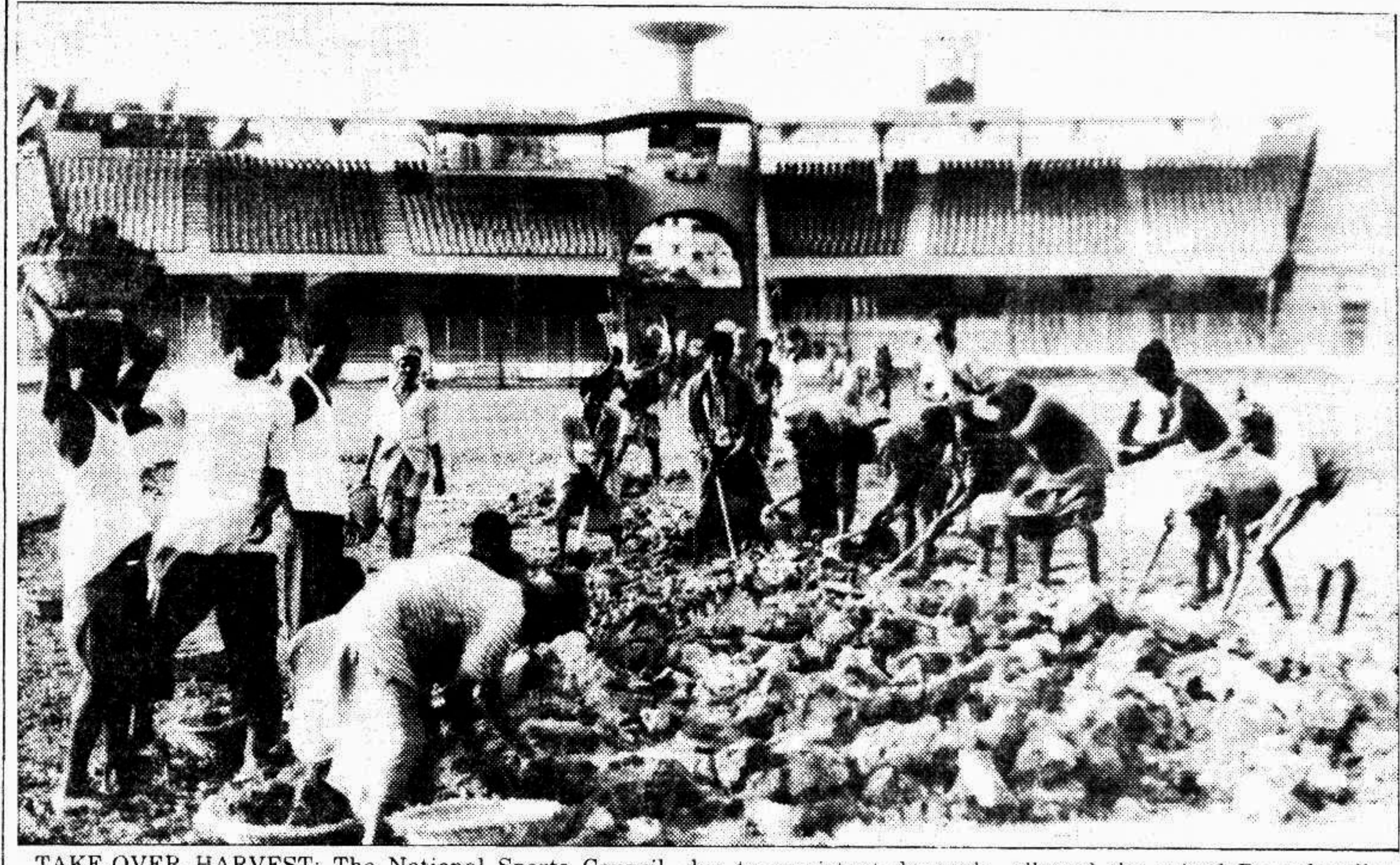
TAKE-OVER HARVEST: The National Sports Council, due to persistent demands, allotted the prized Bangabandhu National Stadium to football from April 25, prior to which it was being used for cricket matches. In greater national interest, the Bangladesh Football Federation has saved three cricket strips and the fourth will only have partial treatment for laying grass. The digging by workmen yesterday, however, belies the good intentions of the BFF.

Sports Reporter Dhaka Bank Green defeated Dhaka Bank Red by seven wickets in a friendly cricket match played at the Uttara Friends Club ground. Batting first, the Red team scored 163 before they were all out in 29 overs. In reply, the Green team scored 164 losing only three wickets. Rashed Imam top scored for the winners with 41 followed by Hannan, who chipped in with 29.