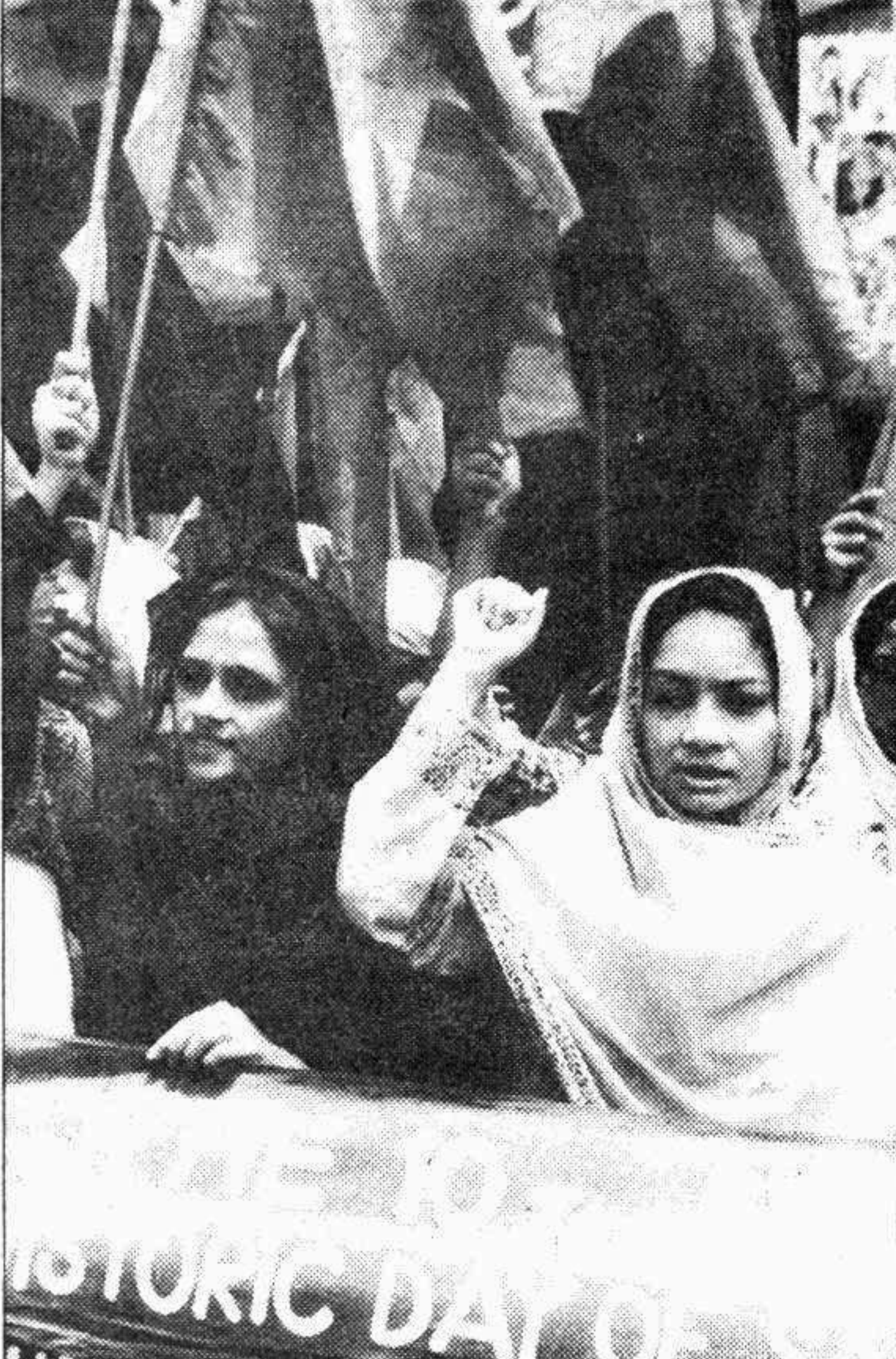
A procession was brought out in the city yesterday on the occasion of 'Holy Ashura'.

JESSORE, Apr 26: A daylong hartal was observed peacefully in the district town today, reports UNB. Offices, educational institutions and shops remained closed during the dawn-to-dusk hartal while all modes of transport did not ply on the roads.