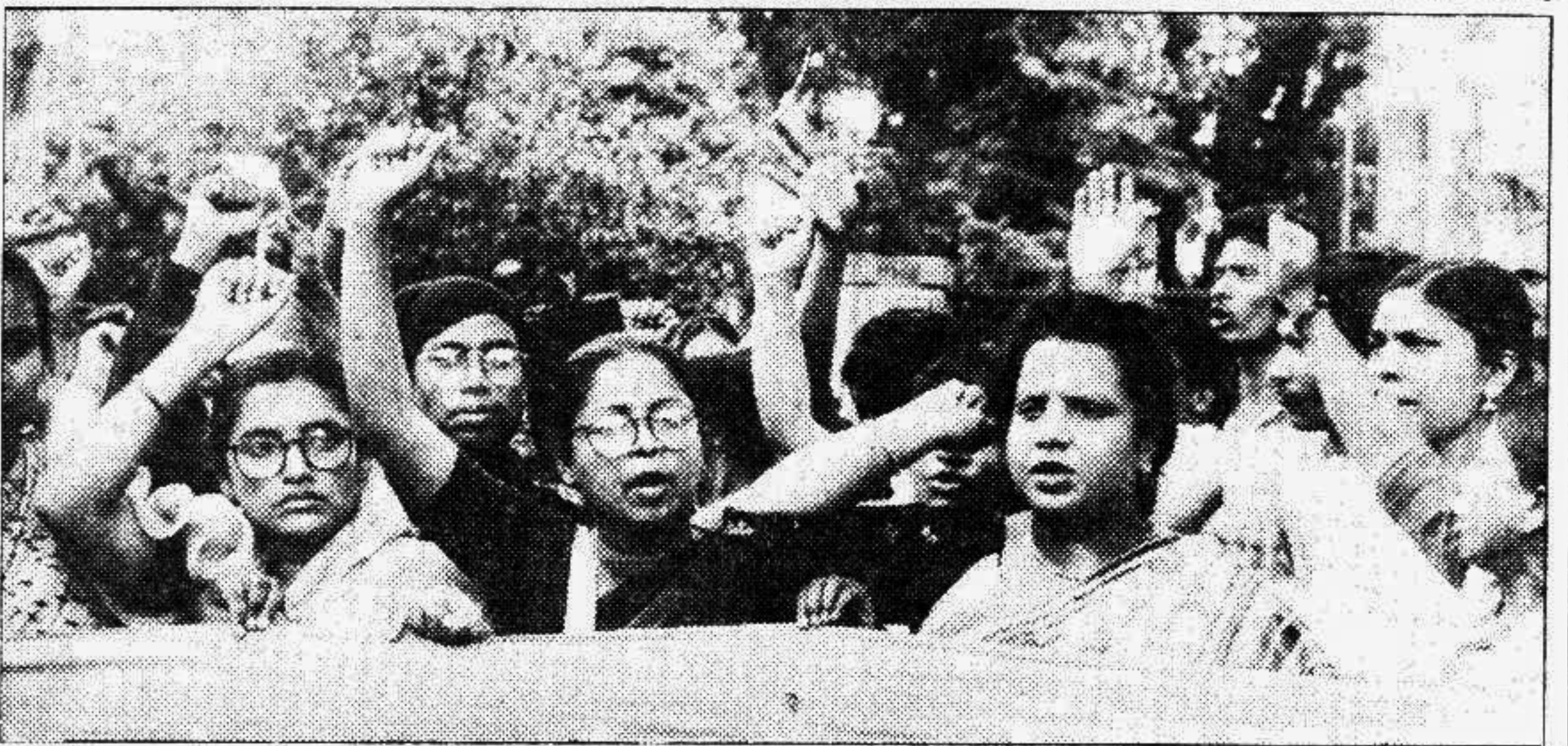
A group of female workers of GSS brought out a procession in the city yesterday in support of Gono Shahajjo Sangstha (GSS) management.