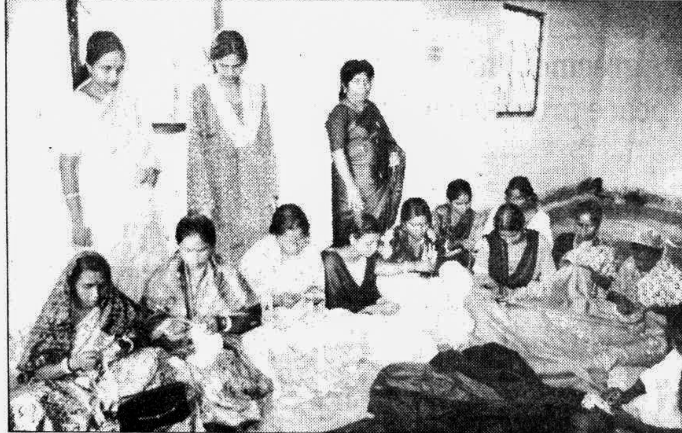
NETRAKONA: Participants in the training programme run by the District Women Affairs Department.