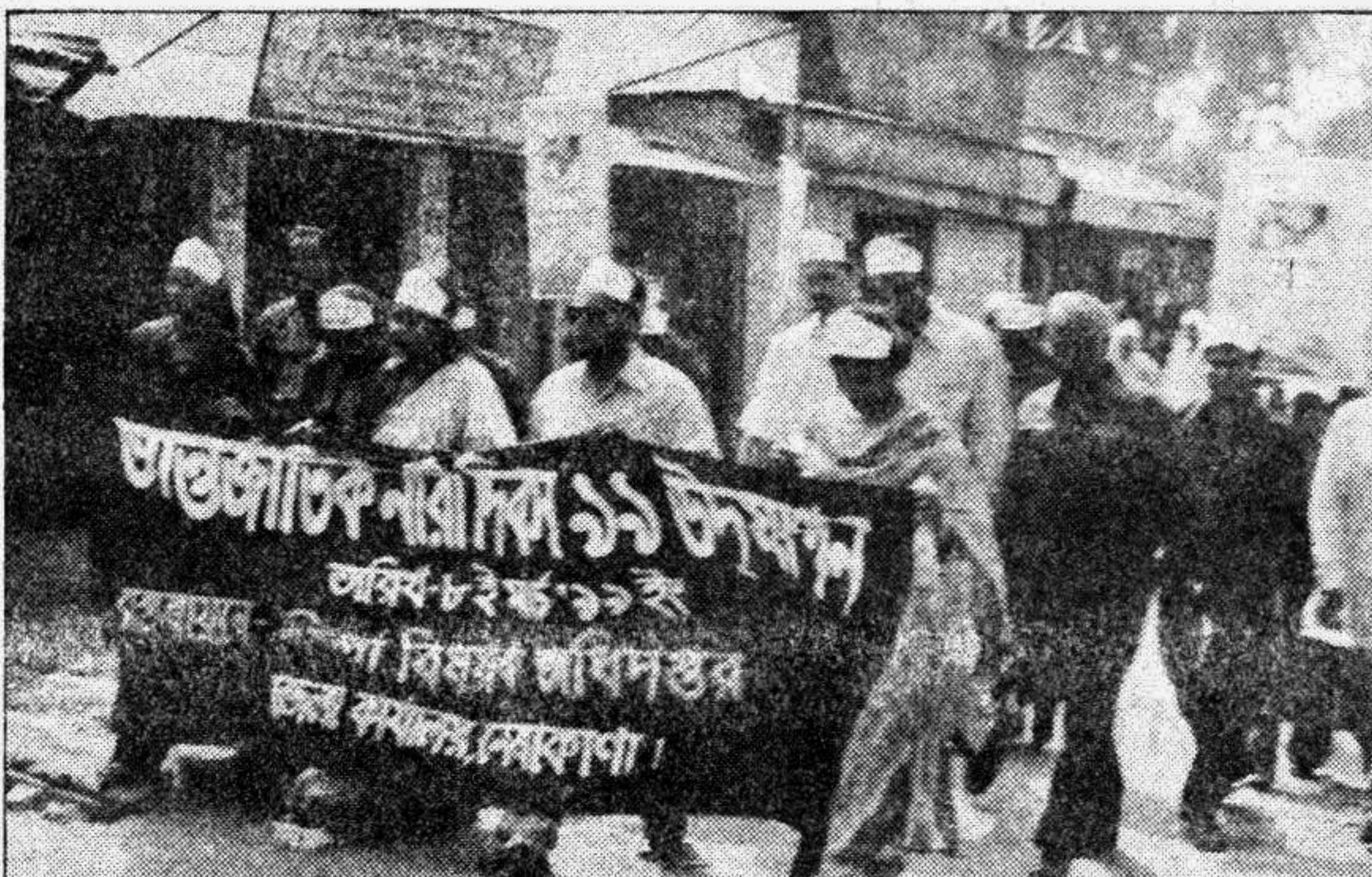
NETRAKONA: A procession was brought out in the town to mark the International Women's Day.