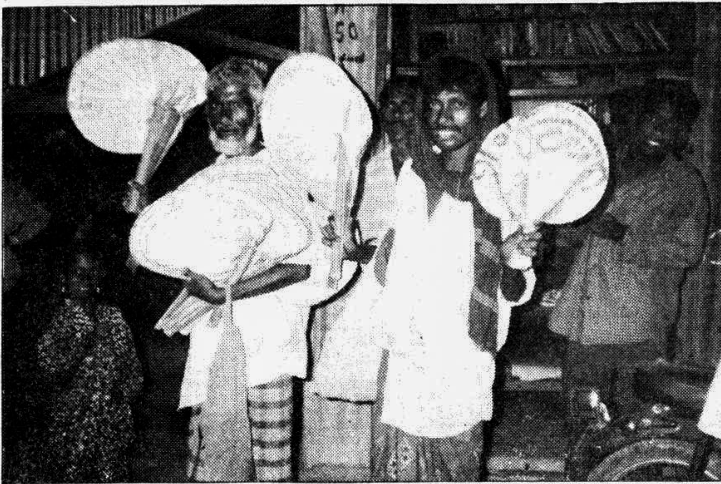
MAGURA: As hot spell continues across the district, the vendors are doing brisk business selling hand fans.

CHAPAINAWABGANJ, Apr 25: Acute scarcity of water has been prevailing at the Nawabganj municipality area here since long causing suffering to the dwellers, reports UNB. The pourashava authority is supplying water only one-fourth of the requirement of the people. Besides, drought and hot spell have intensified the problem. Municipality sources said a total of 16 deep tubewells have been installed to supply pure water among the dwellers. Of the tubewells, four were sealed due to arsenic contamination and the other six could not be operated due to lack of power connection. The dwellers are getting the supply of 7.2 lakh gallons of water against the total requirement of over 28 lakh gallons daily. Besides, there are 1,675 hand driven tubewells, of which 50 are lying inoperative. It is also very difficult to get water from the ground, as the water level has fallen alarmingly.