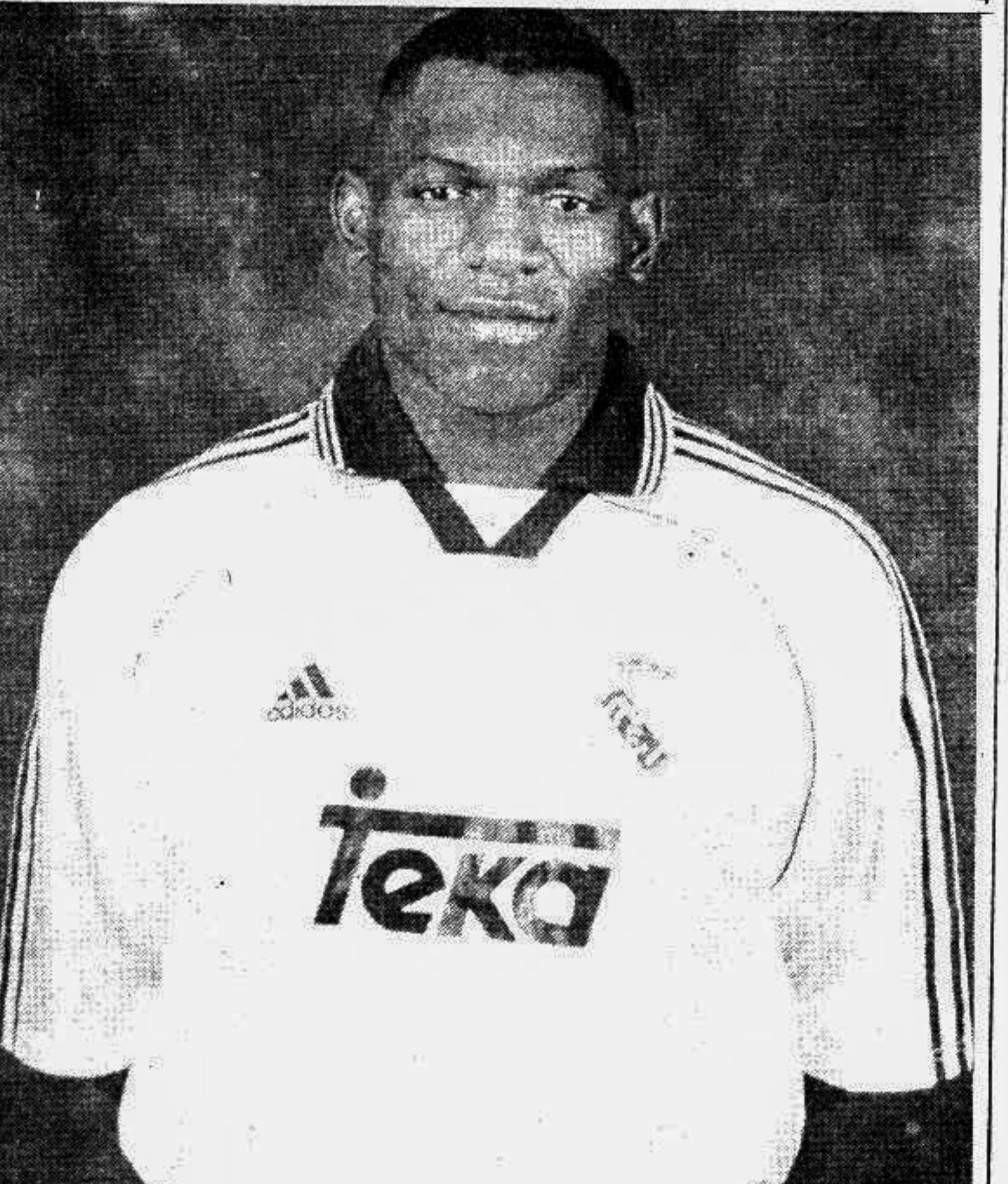
Cameroon international defender Geremi Ndjitap poses wearing the Real Madrid jersey on April 22 after signing a contract with the Spanish giants soccer club for the next 5 seasons.