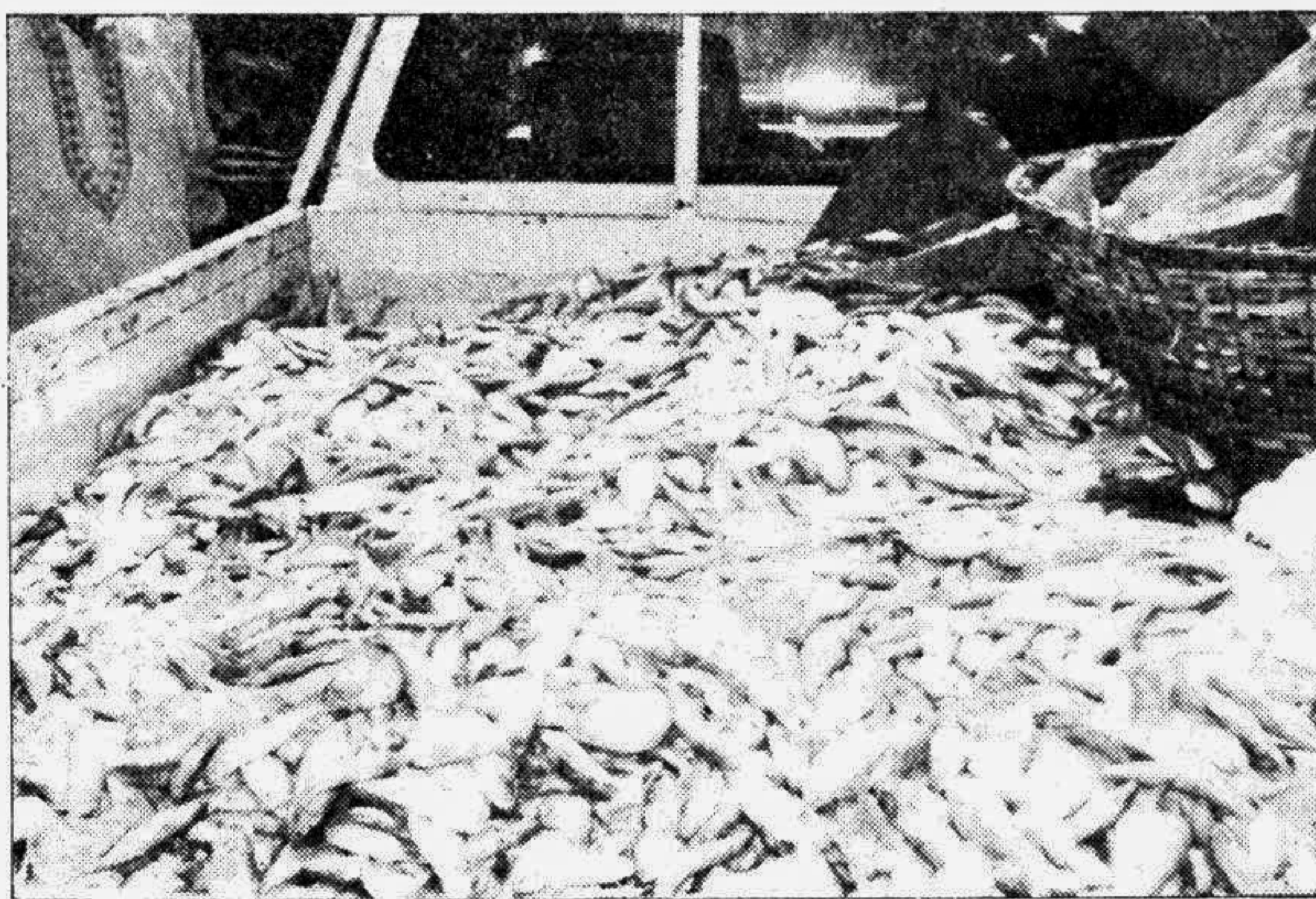
CHANDPUR: Huge quantity of jatka being caught from the rivers Padma and Meghna everyday using current nets.

suring 4 cm to 10 cm are called jatka. Some unscrupulous fishermen catch jatka flouting the government ban. Unauthorised use of current nets for catching fish fries has become widespread, specially in the rivers Padma and Meghna. In the country, there are two big nursery grounds for small hilsa. The largest one is in between haimchar to Shaitnal in Chandpur and the other is located in Kuakata in Patuakhali district. Jatkas remain in the water of Padma and Meghna from March to June. After this period they migrate to the sea. The average catch of jatka is estimated at about four thousand metric tons in a year. If 30 per cent of the haul can be protected each year, an additional production of hilsa worth about Tk 500 crore can be obtained.