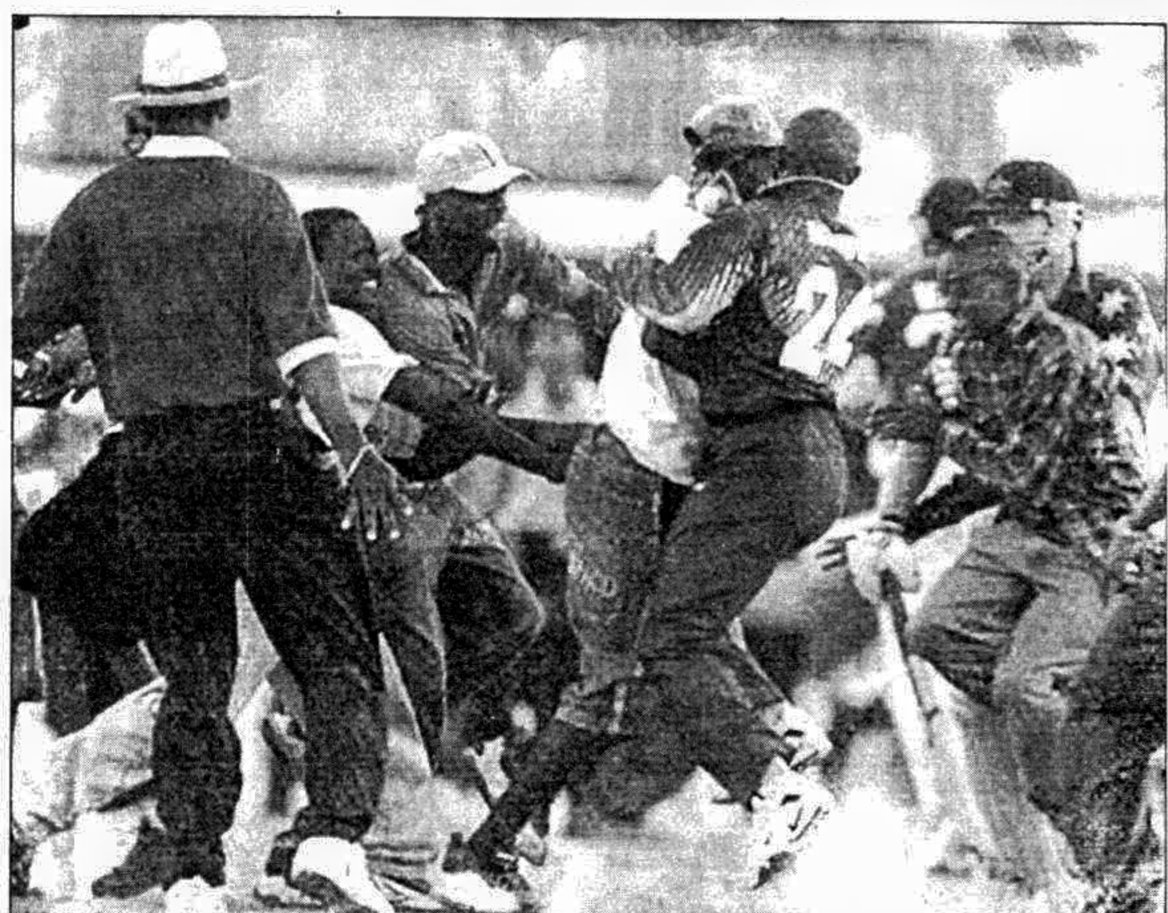
PANDEMONIUM: Keith Arthurton (C) of the West Indies is pushed by the notorious Guyana crowd as he tries to get a stump while Australian skipper Steve Waugh (R) scampers to complete a run during the fifth one day international at Georgetown on April 21.