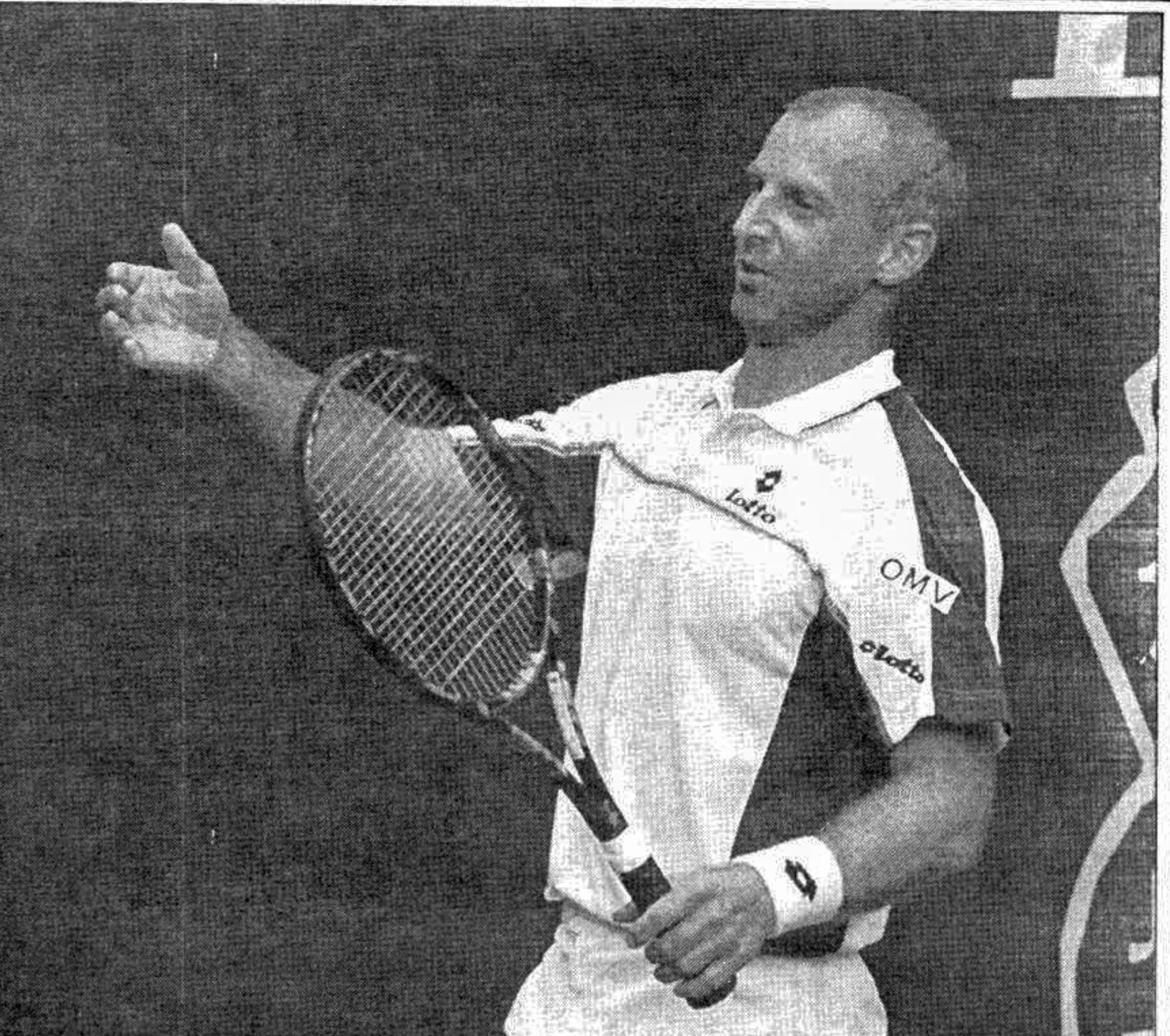
Thomas Muster of Austria gestures during his Monte Carlo Open Match against Karim alami on April 21. Muster lost 3-6, 3-6.