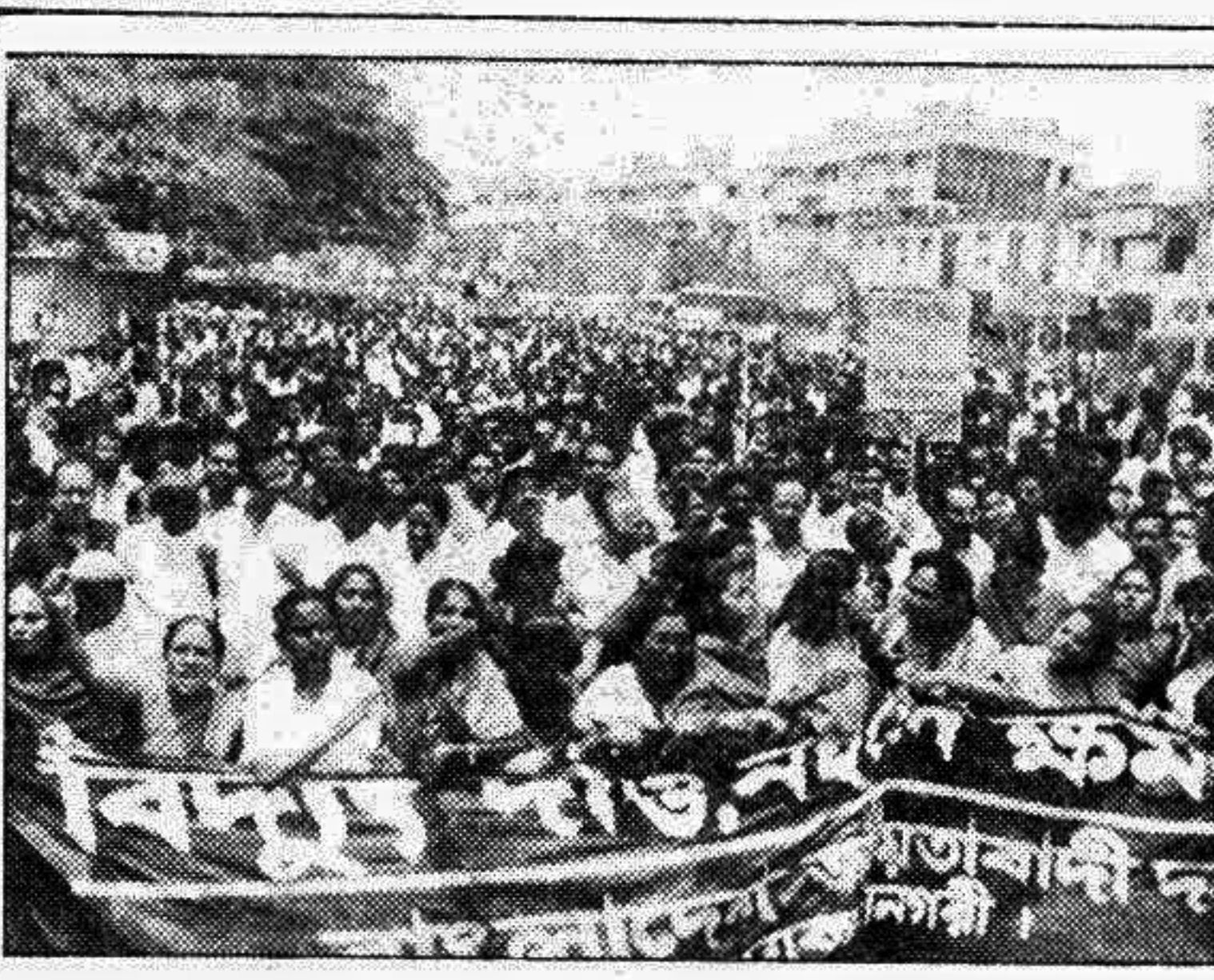
A BNP demonstration in the city yesterday as part of the party's protest programme that included laying siege to the office of Power Development Board (PDB) yesterday.

The discussion meeting on Shaheed Madhusudan Dey, popularly known as Madhuda, has been postponed, said a press release yesterday.