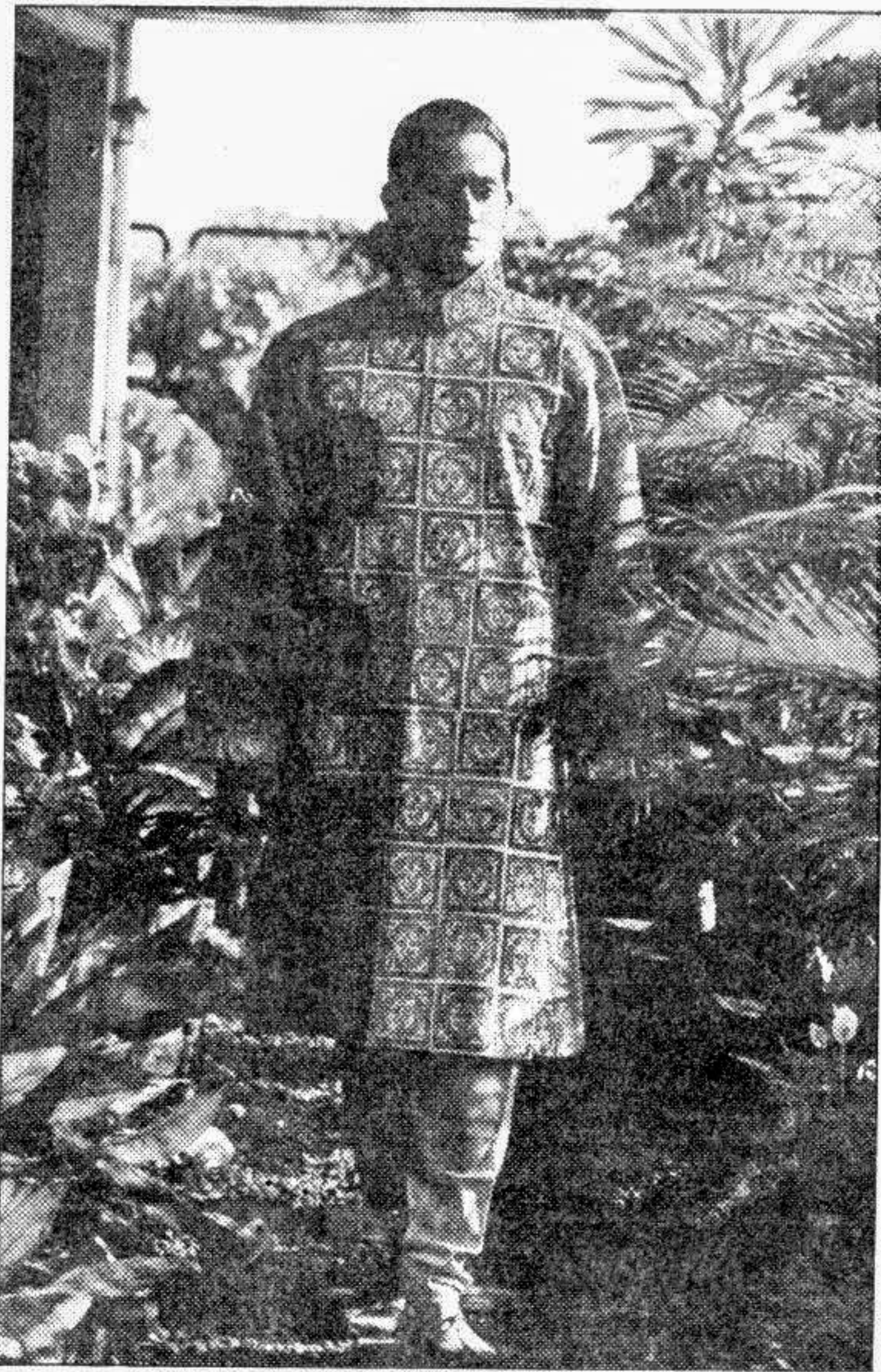
Wearing a Sharbari creation is wearing more than a new look. It is sleeping into glamour.

Sharbari intends to give 20 per cent of the proceeds from