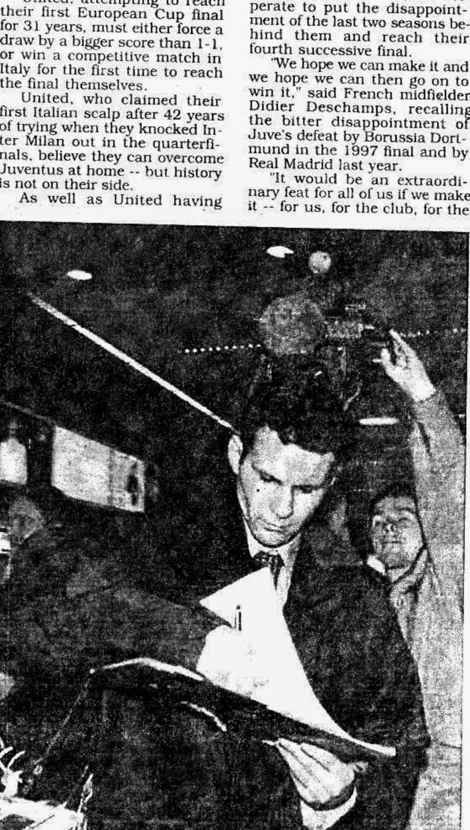
Manchester United's Welsh international star Ryan Giggs signing autographs at the Manchester Airport on April 19 prior to the team's departure for Turin to play the Champions' Cup semifinal second leg match against Juventus.

never won in Italy, Juventus have not lost a home European Cup match that mattered since 1968 -- and they have not lost at home to an English side since Arsenal beat them in the European Cup Winners' Cup semifinal in 1980.