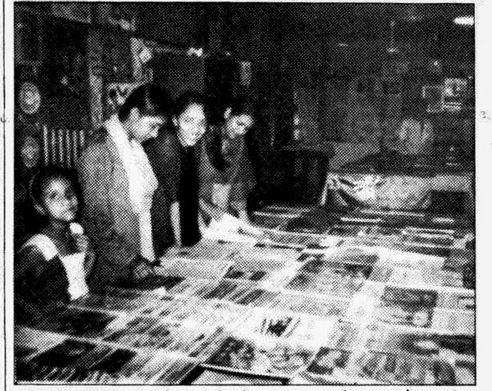
HABIGANJ: A fortnight-long magazine and poster exhibition was held at the Habiganj Press Club recently on the occasion of the Independence Day.

MAGURA, Apr 20: The Office-in-Charge of Shalikhathana was closed in Police Line here today on charge of negligence and failure to discharge his duty, reports UNB.