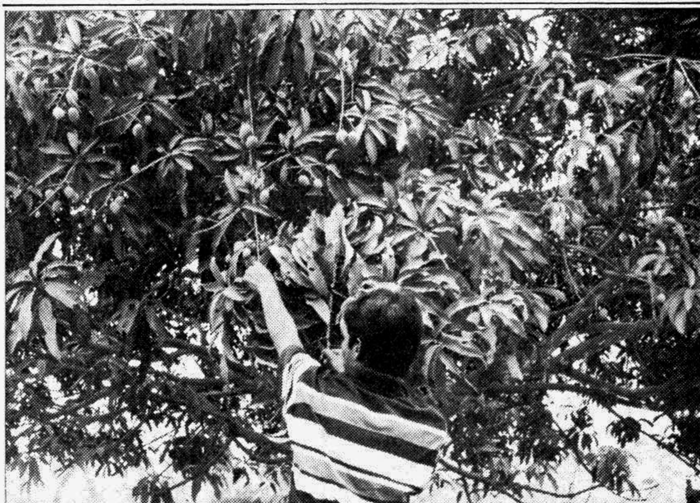
NATORE: Despite drought, a bumper production of mango is expected throughout the greater Rajshahi region this year. The photo shows a fruit-bearing mango tree.

From Our Correspondent CHANDPUR, Apr 20: The IRRI-boro cultivation in the district is being hampered seriously because of prolonged drought. Farmers failed to prepare their lands for planting seedlings as rivers, canals and ponds are now almost dry.