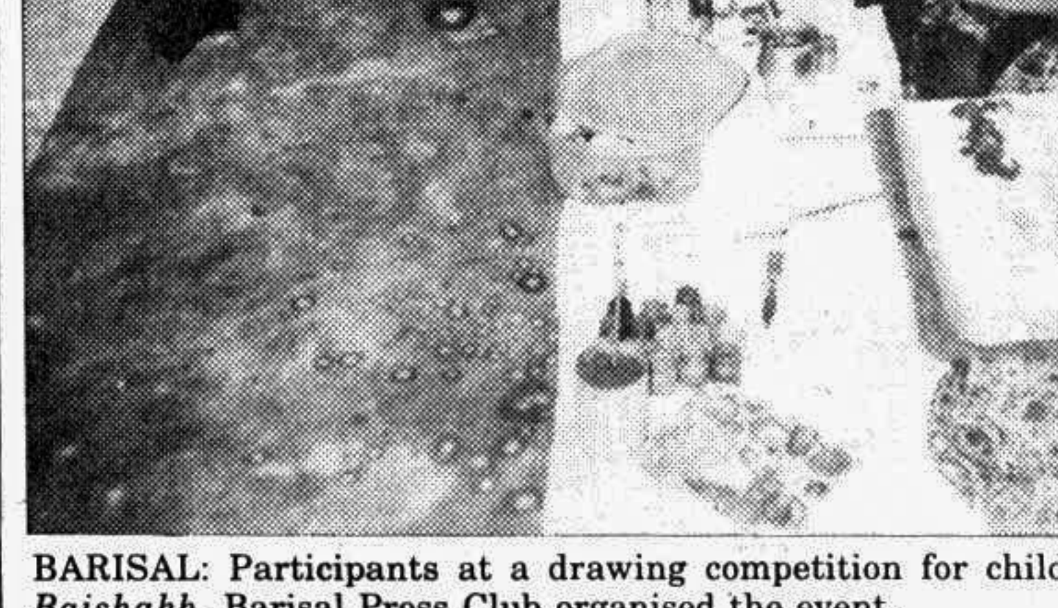
BARISAL: Participants at a drawing competition for children on the occasion of Pahela Baishakh. Barisal Press Club organised the event.

From Our Correspondent MYMENSINGH, Apr 20: A total of 3,323 crimes were committed in the district during last six months from September last year to February this year, according to police sources.