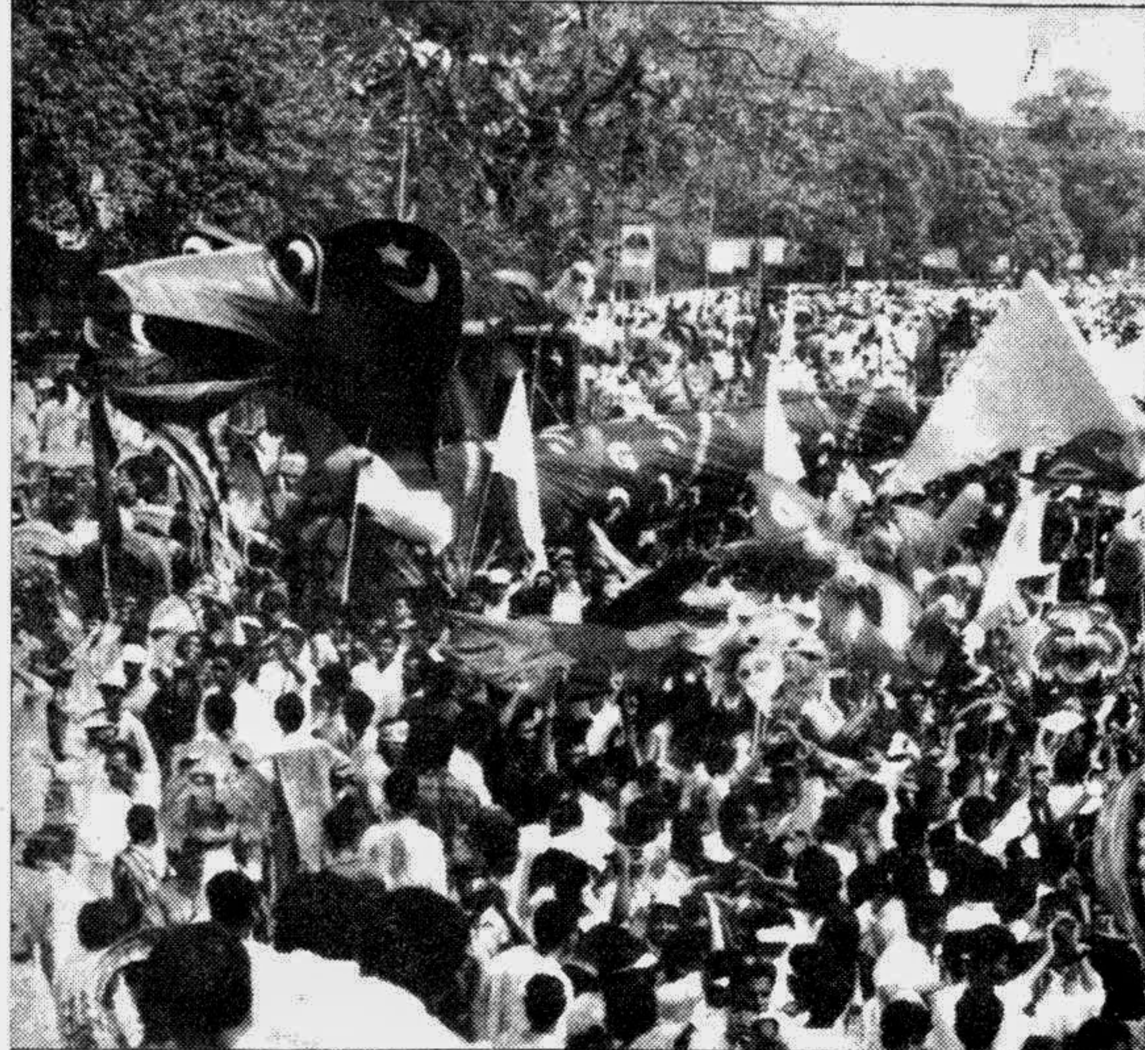
Welcoming the Bengali new year the Fine Arts Institute style

Back in college premises in Shahbag, a couple of students were seen beating drums and singing everything from Shadher lau banailo morey to Kando kaney mon. As they sang and danced, others joined in to celebrate the first day of the year. There was a sense of liveliness in the air, a sense of happiness and a sense of blissfulness amidst the excruciating heat and humidity. Kudos to all