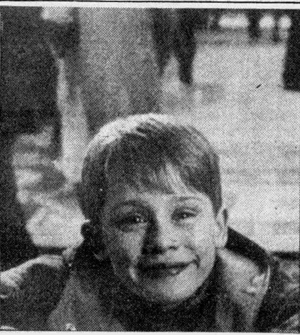
Comedy: Home Alone on Star Movies at 9:30 am

Shehnaz/Amrita/Nikhil 12:30 MTV Hit Film Music 1:30 Made In India VJ Cyru 2:00 MTV Hipshakers 2:30 MTV Select VJ Malaika 4:00 Non-Stop Hits 4:30 Pepsi Dance Connection Special-TV MTV 5:30 MTV Most Wanted VJ Nadya 6:30 MTV Chill Out VJ Shehnaz/Amrita/Nikhil 7:30 MTV- Chito Chat VJ Amrita/Cyru 8:30 MTV In Control 9:30 MTV Hit Film Music 10:00 Housefull VJ Nafisa 10:30 Non-Stop Hits 11:30 The Grind (Beach Show) 12:00 Club MTV VJ Malaika 1:00 Non-Stop Hits Continue