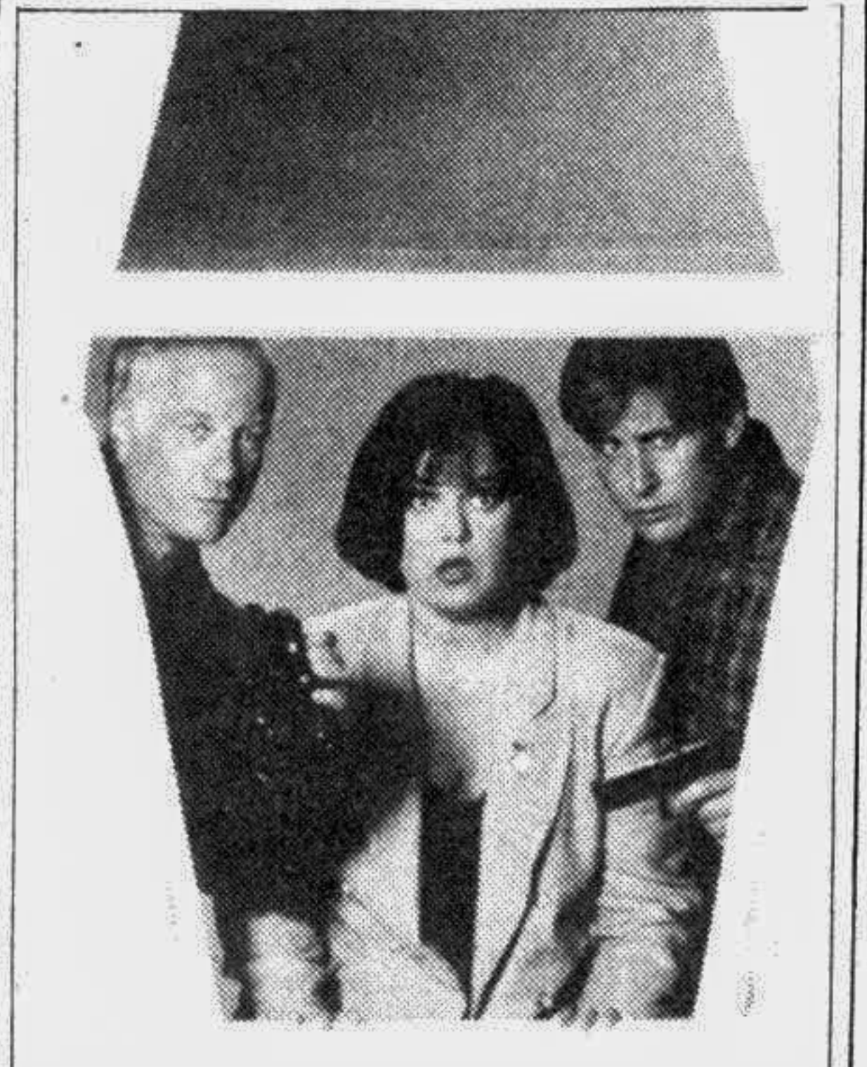
Comedy: Another Stakeout on Star Movies at 2:30 pm

5:30 World Famous Toons 6:30 The Real Adventure of Johnny 7:00 Tom & Jerry Kids 7:30 The Popeye Show 8:00 Scooby & Scrappy Doo 8:30 Perils Of Penelope 9:00