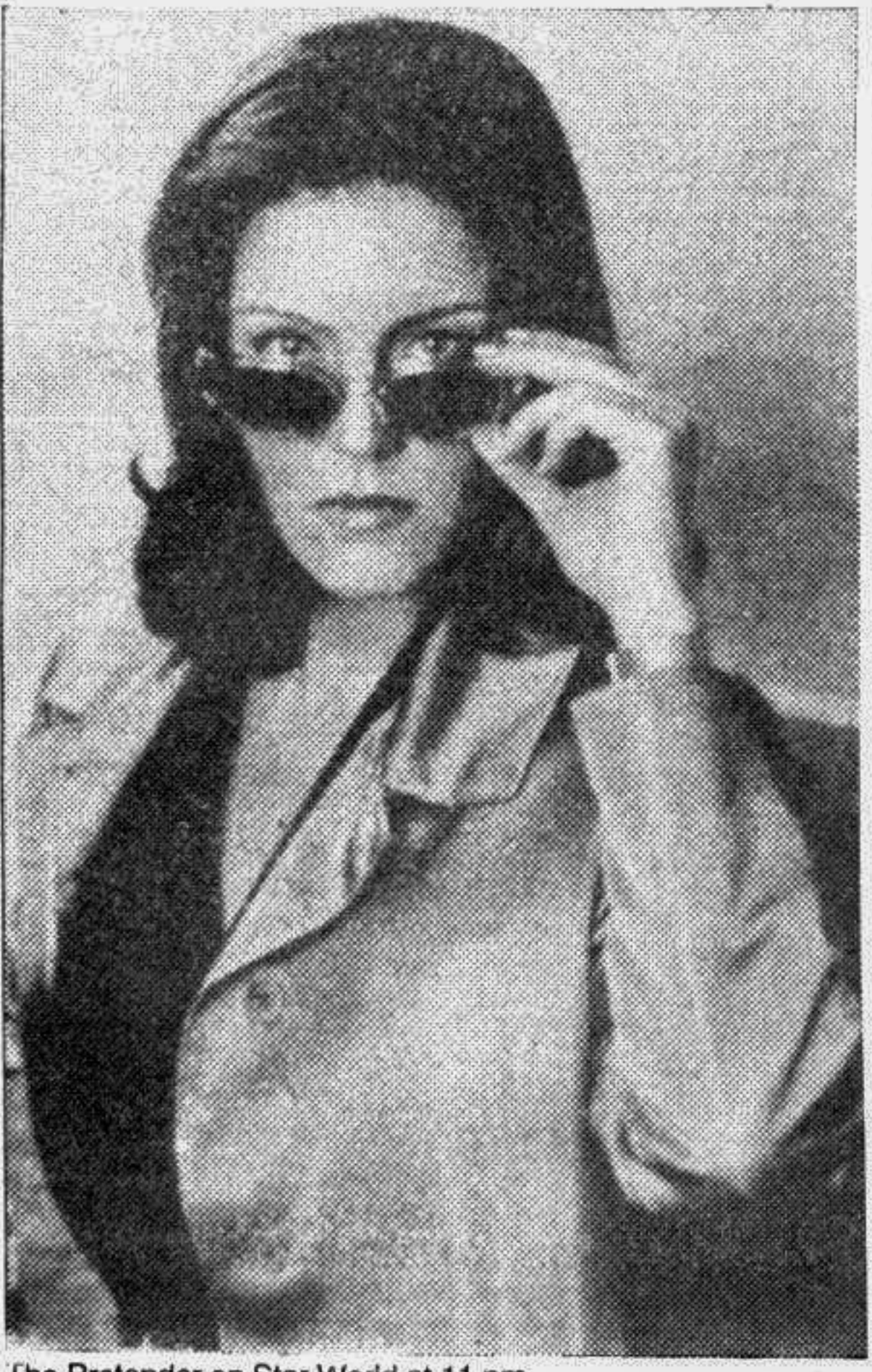
The Pretender on Star World at 11 pm