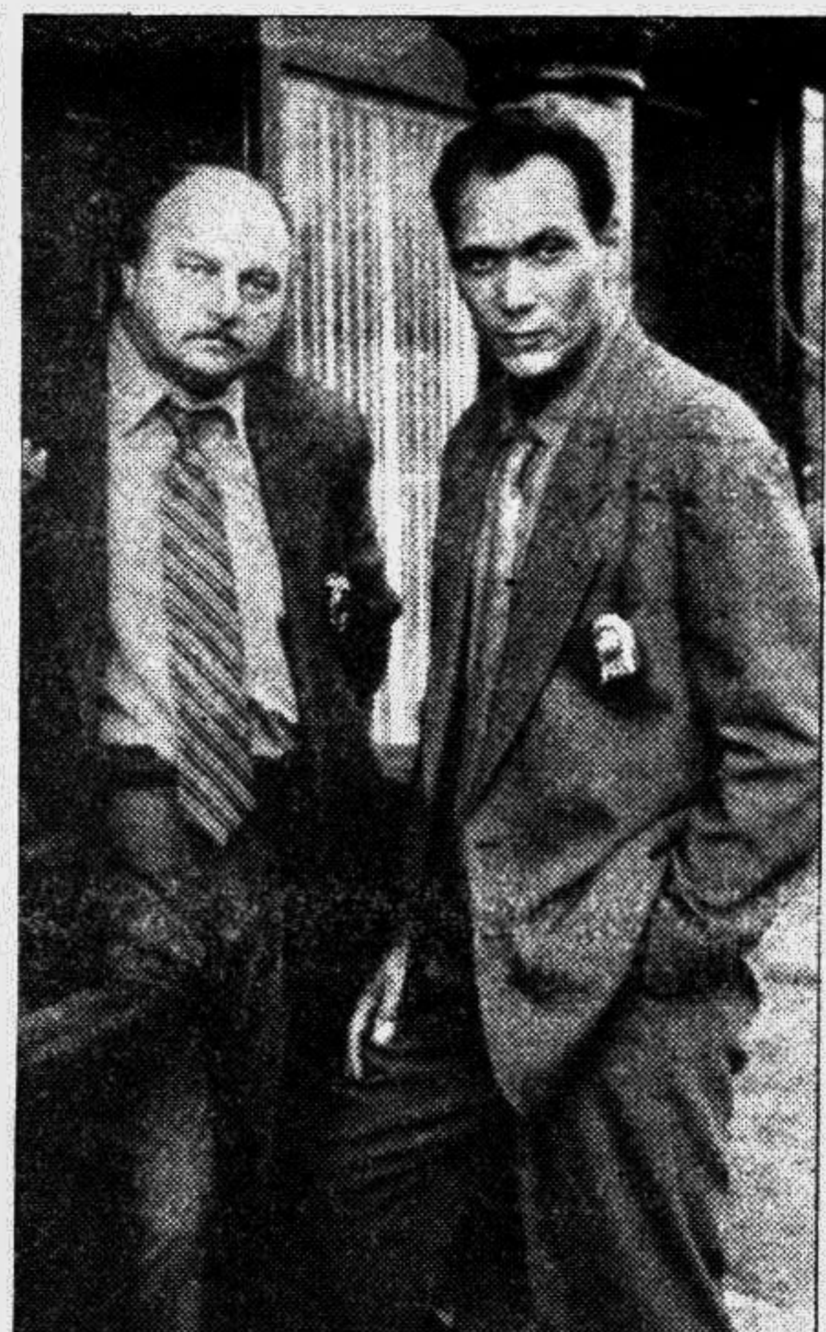
NYPD Blue (Series 5)

6:00 Aerobics Oz Style 6:30 Brittas Empire 7:00 Nathalie Dupree Cooks 7:30 The Wonder Years 8:00 Lassie 8:30 Newhart 9:00 Series: Caroline In The City 9:30 Series: Dhama And Greg 10:00 Series: Chicago Hope 11:00 The Oprah Winfrey Show 12:00 Series: Santa Barbara 1:00 The Bold And The Beautiful 1:30 Tropical Heat 2:30 Media TV 3:00 Lassie 3:30 Small Wonder 4:00 Brittas Empire 4:30 World News 5:00 Asia News Update 5:05 World Business Report 5:30 Home Improvement 6:00 L.A. Heat 7:00 The Pretender 6:00 NYPD Blue 9:00 The Bold And The Beautiful 9:30 Series: Home Improvement 10:00 LA Heat 11:00 The Pretender 12:00 NYPD Blue 1:00 Series: Home Improvement 1:30 Series: Newheart 2:30 Brittas Empire 2:30 The Bold And The Beautiful 3:00 The Wonder Years 3:30 Mr Belvedere 4:00 Life in the Word with Joyce Meyer 4:30 World News 5:00 Home Improvement 5:30 Candid Camera