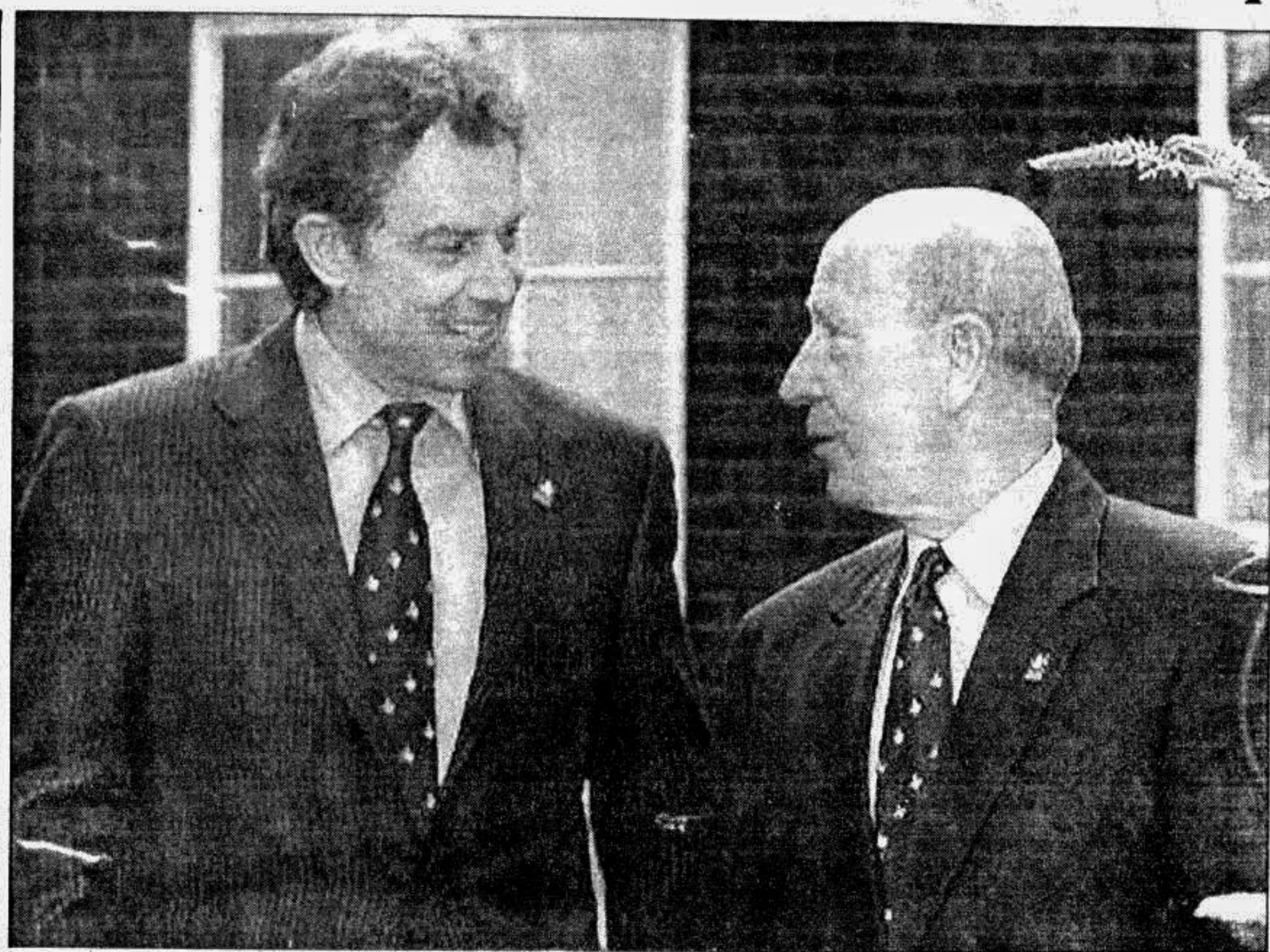
British Prime Minister Tony Blair (L) and former England star Sir Bobby Charlton exchange views while standing outside 10 Downing Street yesterday.