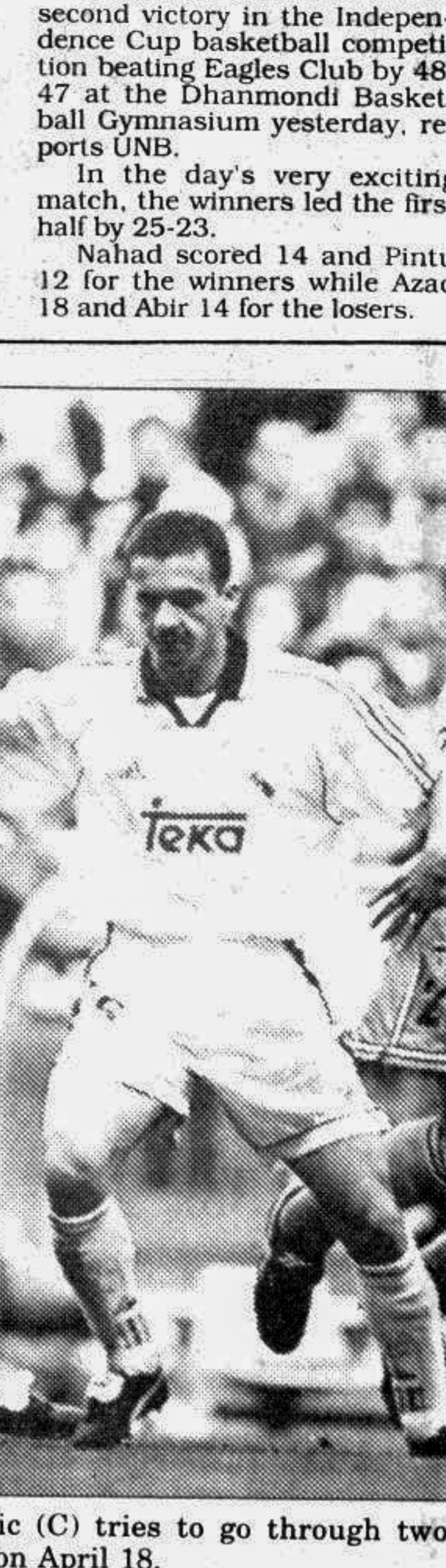
Real Madrid's Pedja Mijatovic (C) tries to go through two Valencia players during their Spanish Primera Liga match on April 18.