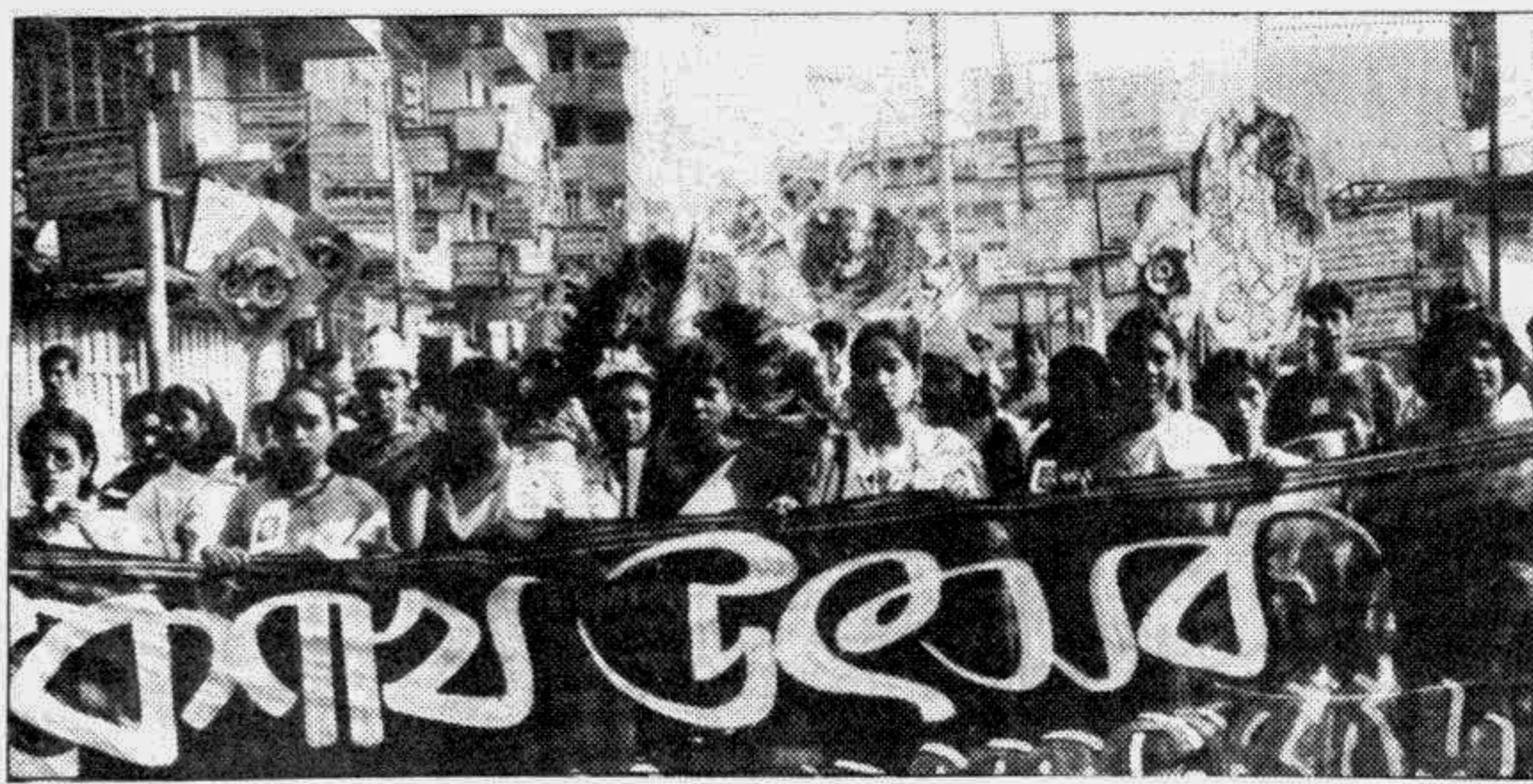
BARISAL: A colourful procession organised by the Charukala Bidyalaya paraded through the streets to welcome the Bengali New Year on Pahela Baishakh.