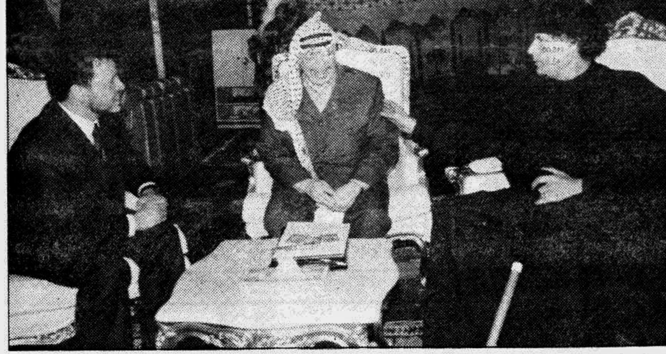
Libyan President Moammer Gaddafi (R) holds a three-way summit with Palestinian leader Yasser Arafat (C) and King Abdallah II of Jordan in the Mediterranean port of Sirte Saturday. The visit of King Abdallah and Arafat follow the suspension of a seven-year air and arms embargo on Tripoli after it handed over for trial two suspects wanted in connection with the bombing of an airliner over Lockerbie, Scotland, that killed 270 people.

Benazir's party plans to stage nationwide protests throughout Pakistan on Tuesday. AFP adds: From detention and exile to the pinnacles of power, Pakistan's Benazir Bhutto has seen it all in a colourful political career, but once again her future hangs in the balance.