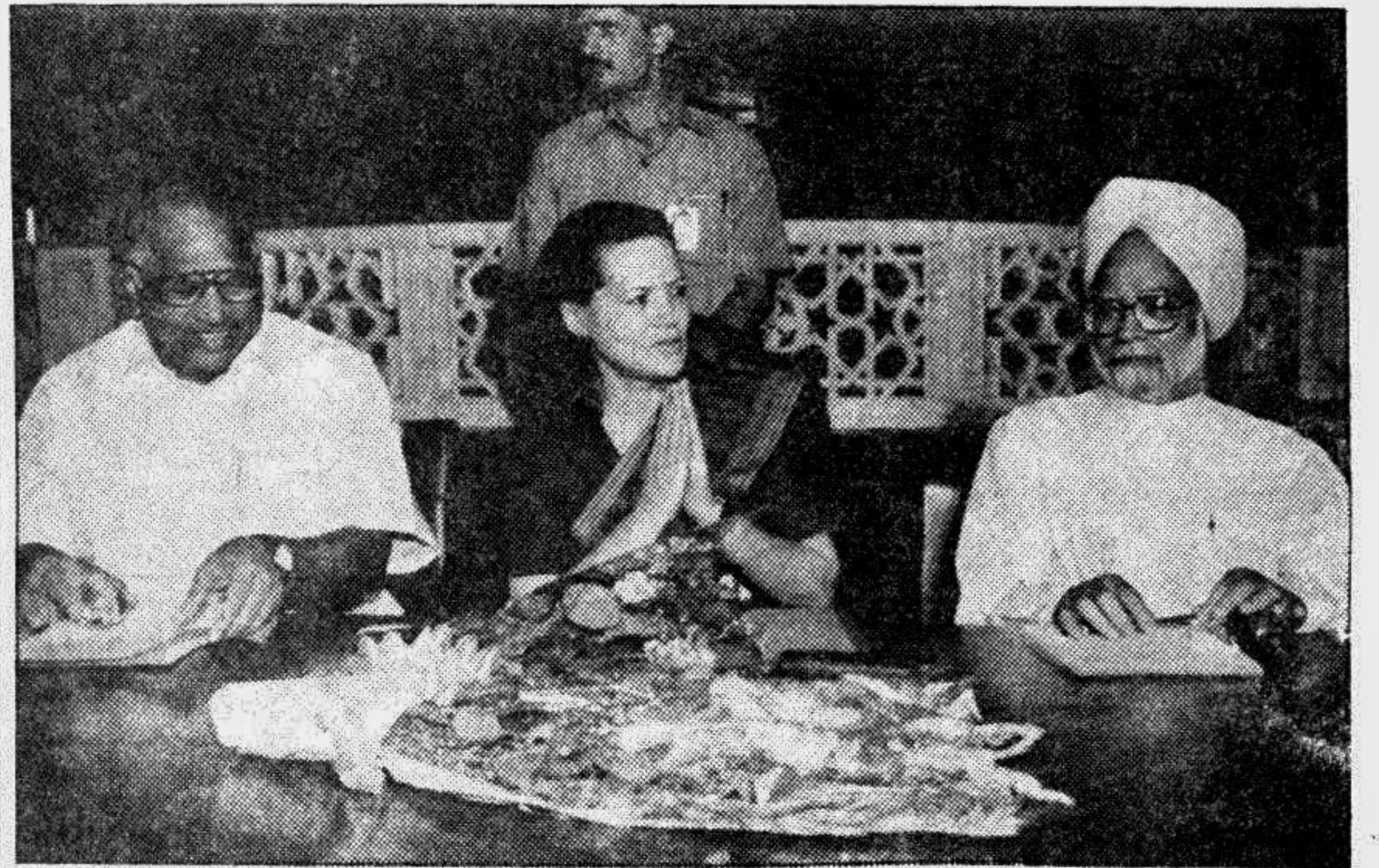
President of the Congress (I) Party Sonia Gandhi (C) greets a colleague as senior Congress leaders Sharad Pawar (L) and Manmohan Singh (R) sit by prior to a Congress Parliamentary Party meeting at parliament Monday in New Delhi. Sonia Gandhi vowed to form an alternative government following the fall of the Hindu nationalist coalition on Saturday.

Clinton said Sunday the allies have no plans to authorize a land invasion. But "if the moment comes when it is necessary," he added, "I'm sure the countries that belong to NATO will be ready to do it."