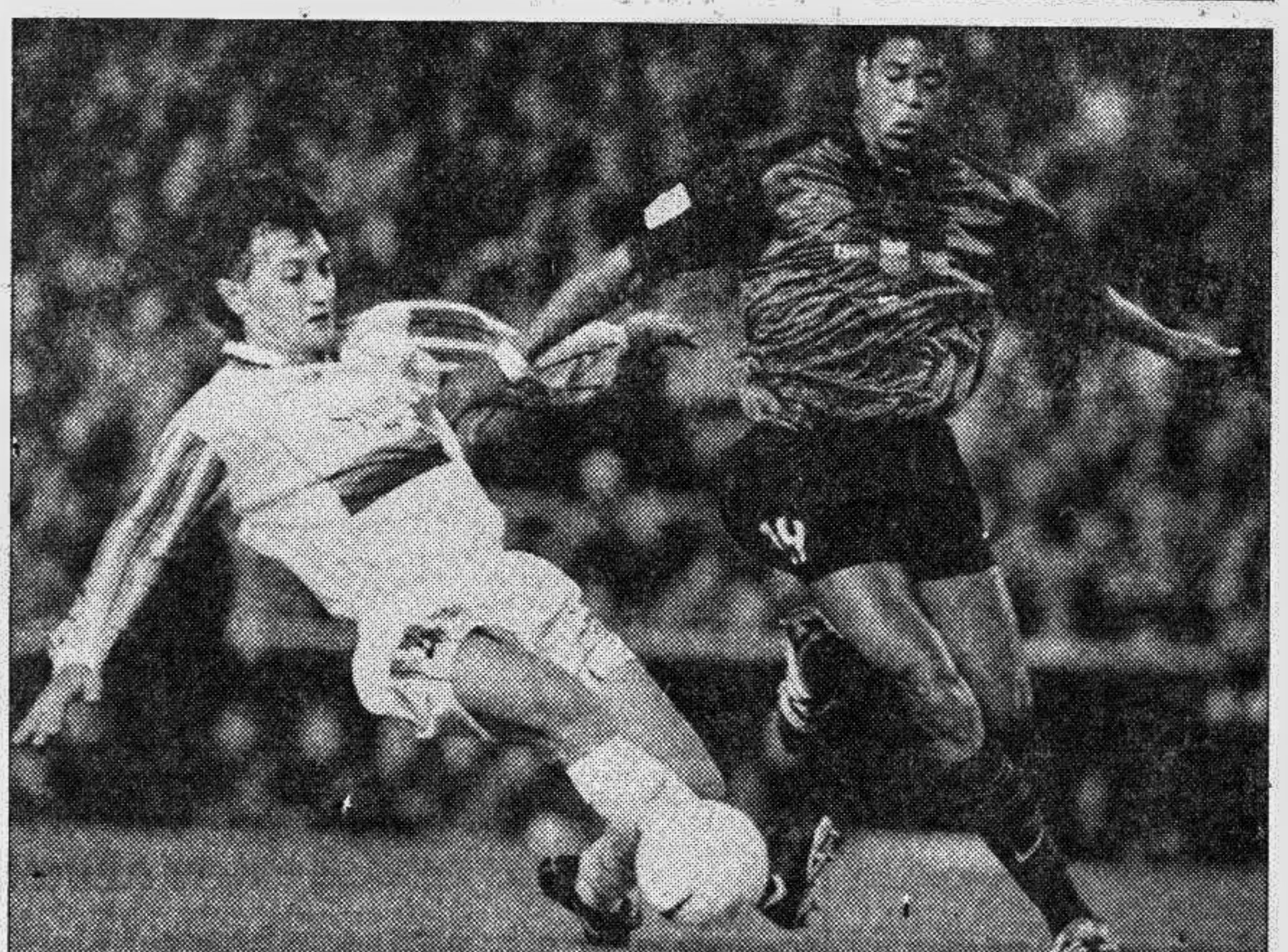
Patrick Kluijvert (R) Barcelona's Dutch international striker, going past Mallorca's Argentine defender Lionel Siviero during their primera liga clash at Nou Camp on April 17. Barca won 2-1.