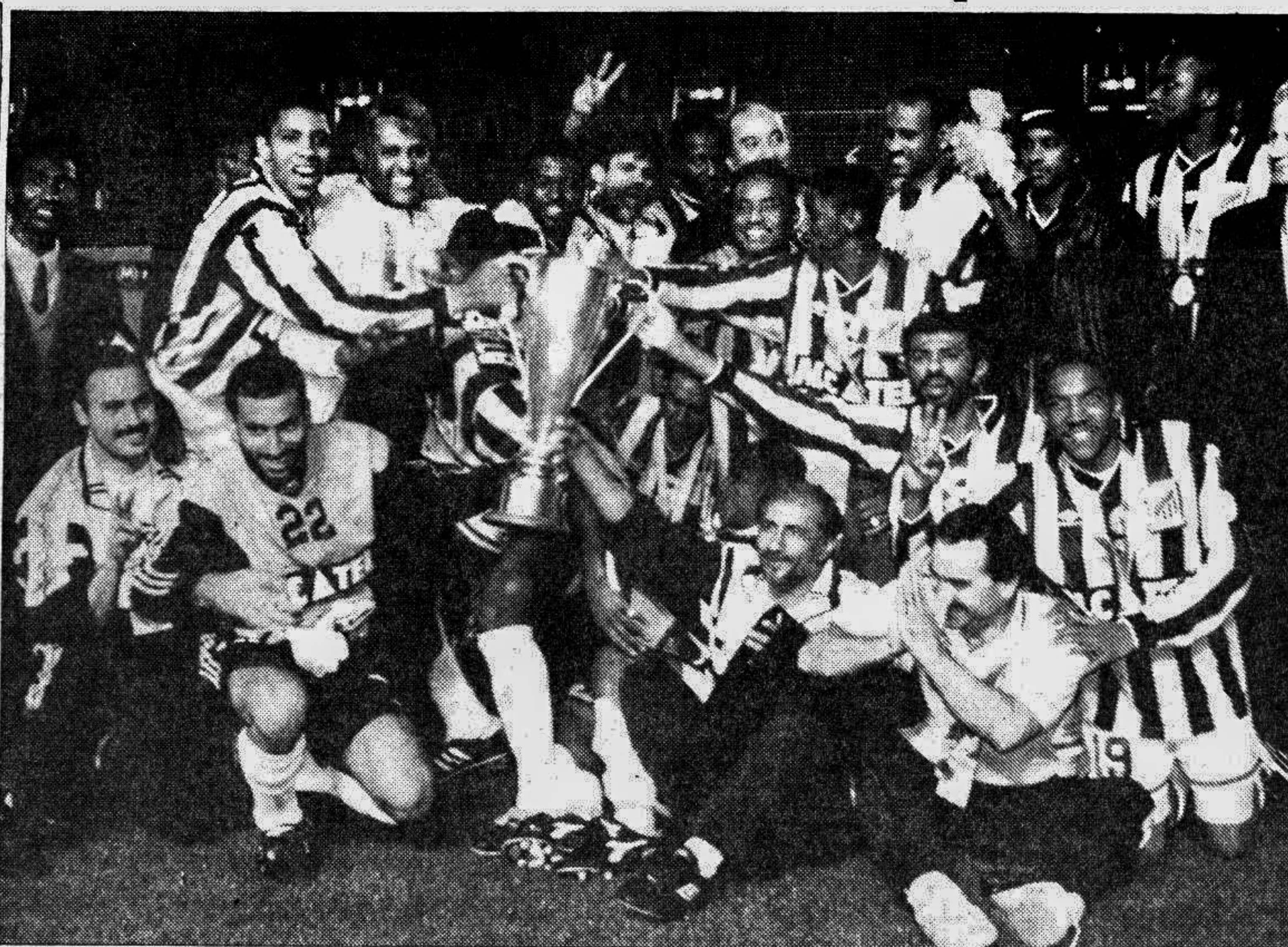
Players and officials of Saudi Arabia's Al-Ittihad soccer team, which won the Asian Cup Winners' Cup, celebrating with the trophy in Tokyo on April 18.

SYDNEY, Apr 18: A resident of Sydney's Bondi Beach vowed to lie in the path of bulldozers in a bid to stop the Olympic volleyball competition from being on the popular beach strip next year, reports AP.