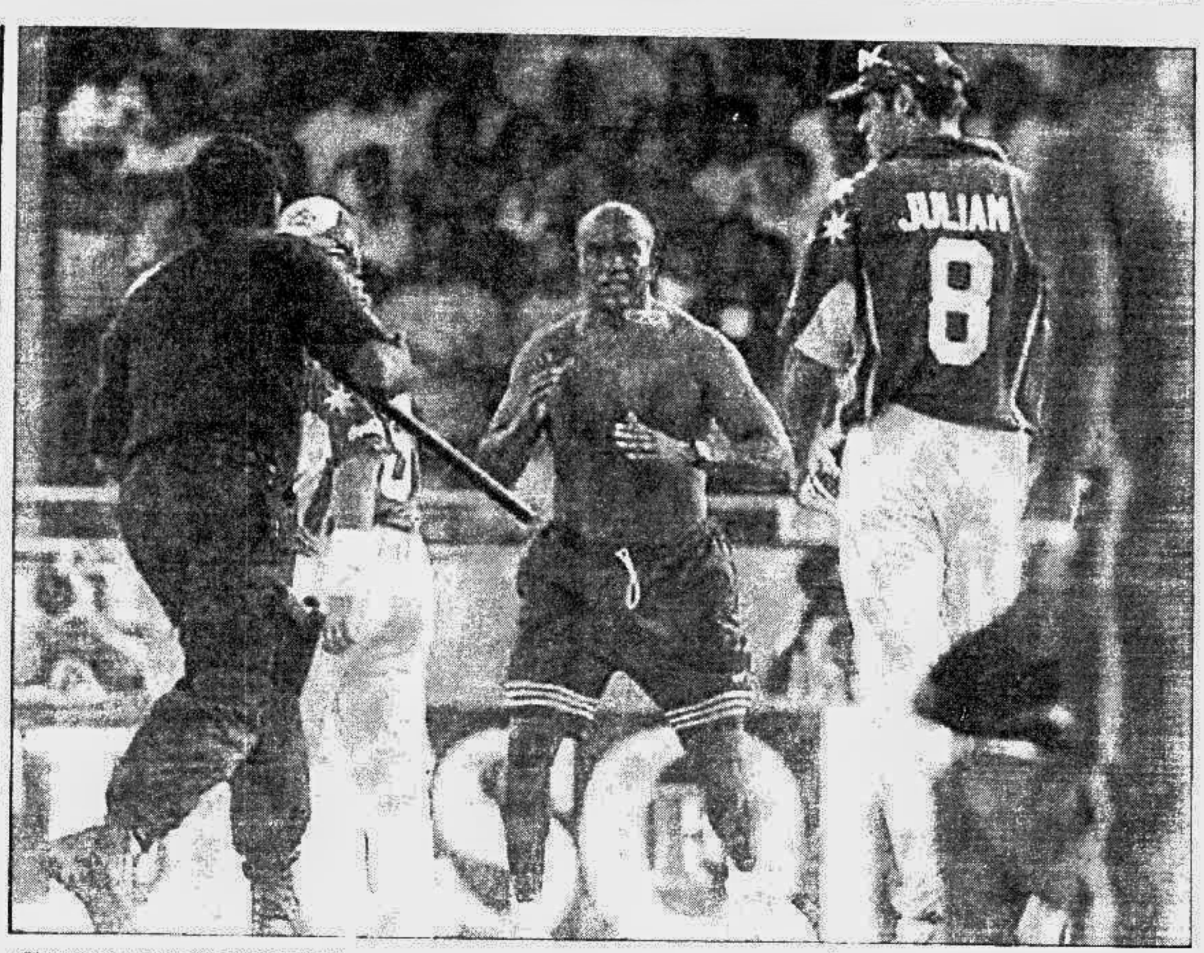
TRINIDADIAN TERROR! An imposing looking West Indian fan invades the Queen's Park Oval pitch after the home side won the third one-day international against Australia on April 17.