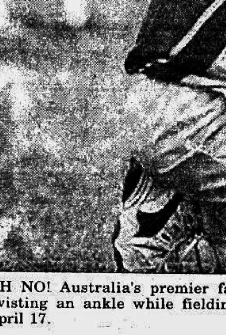
OH NO! Australia's premier fast bowler Glenn McGrath contemplates his future after twisting an ankle while fielding during the third one-day international in Trinidad April 17.

Barcelona just managed to hold on and duly extended their lead at the top of the table to 10 points, although Celta Vigo can reduce the deficit to seven if they win at home to Alaves to-day. Mallorca, with half an eye on Thursday's European Cup Winners' Cup semifinal decider with Chelsea, looked to play a cautious game, packing the midfield and attempting to deny space to Rivaldo and Luis Figo. But the islanders were un-done as early as the fourth minute when their much-vaunted defence went to sleep. A short corner on the left led to a dinked cross and an un-marked Frank de Boer nodded home.