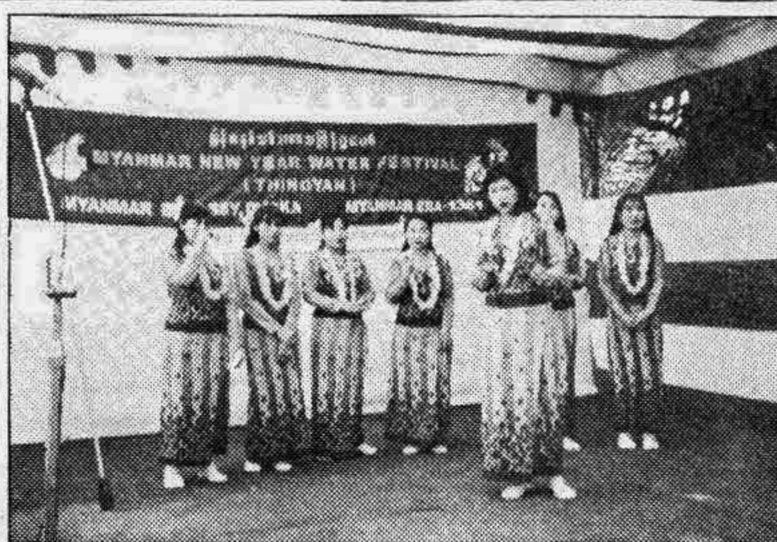
Thingyan festival of Myanmar was celebrated at the premises of the Embassy in Dhaka recently. Photo shows the cultural programme at the festival.