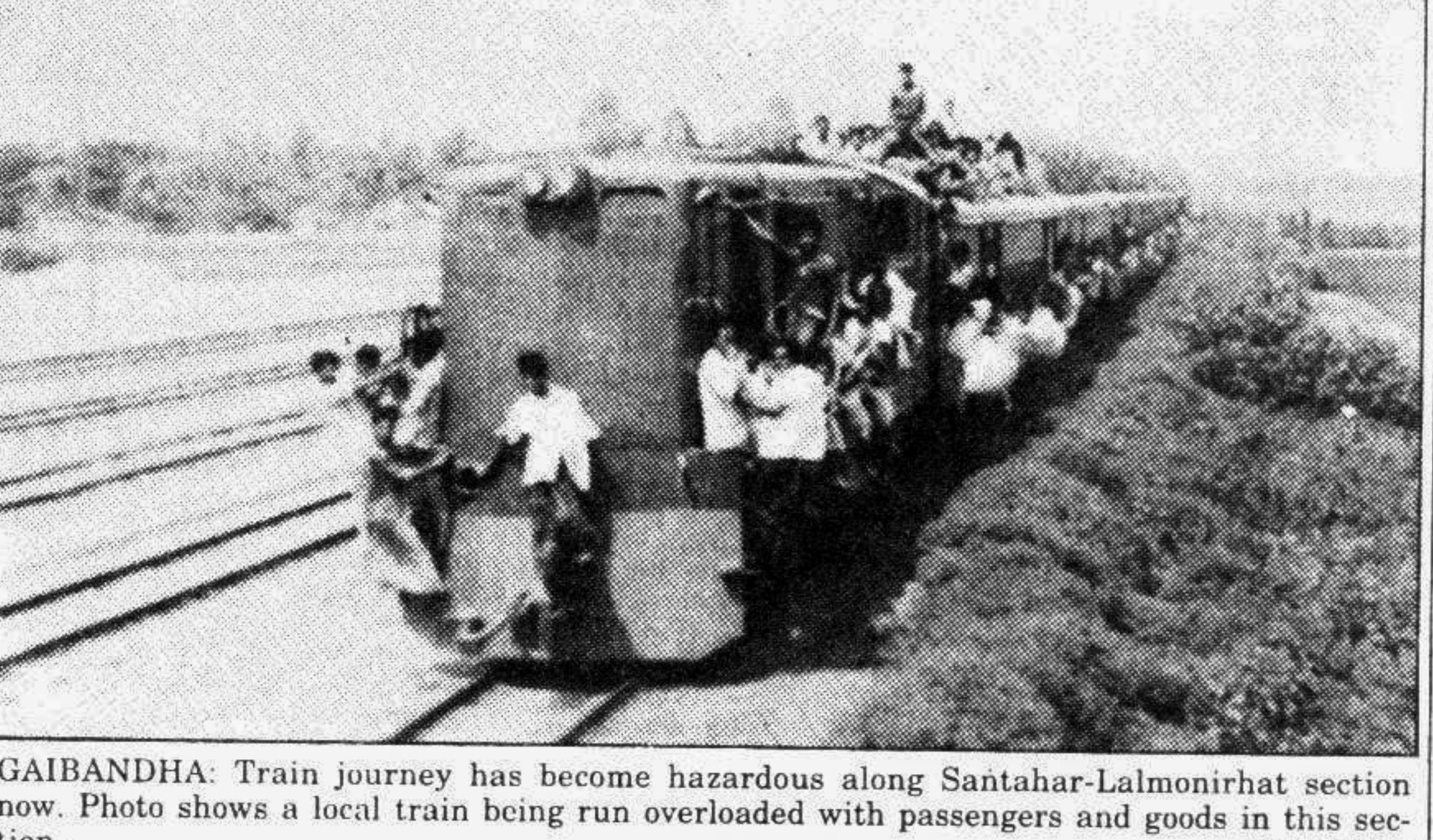
GAIBANDHA: Train journey has become hazardous along Santahar-Lalmonirhat section now. Photo shows a local train being run overloaded with passengers and goods in this section.

From Our Correspondent MYMENSINGH, Apr 17: Navigation is being hampered seriously due to abnormal fall in water level of the river Old Brahmaputra and other rivers of the district. Siltation in the river Old Brahmaputra and other rivers here have created immense sufferings to the people who travel by riverine transports. As navigation along different river routes has been hampered along various river routes, many small businessmen have already closed down their business establishments and many ferry ghat labourers are out of job now. The travelling cost of common people have increased sharply due to massive siltation in river beds. People are suffering a lot who travel from Bhaluka thana to Trishal thana through river Khiru. Now they can not travel at many palces the river as those are dried up totally turning the river bed into 'Boro' paddy fields. Md Kala Mia, a passenger of a particular river route told this correspondent at Kachari Ferry Ghat that due to siltation the movement of small ferry boats have stopped. Many boatmen are now leading a sub-human life due to siltation, he said. As there is no dredging activities for a long time, silts which have been dumped in river beds have created shoals at many places along the river Brahmaputra river.