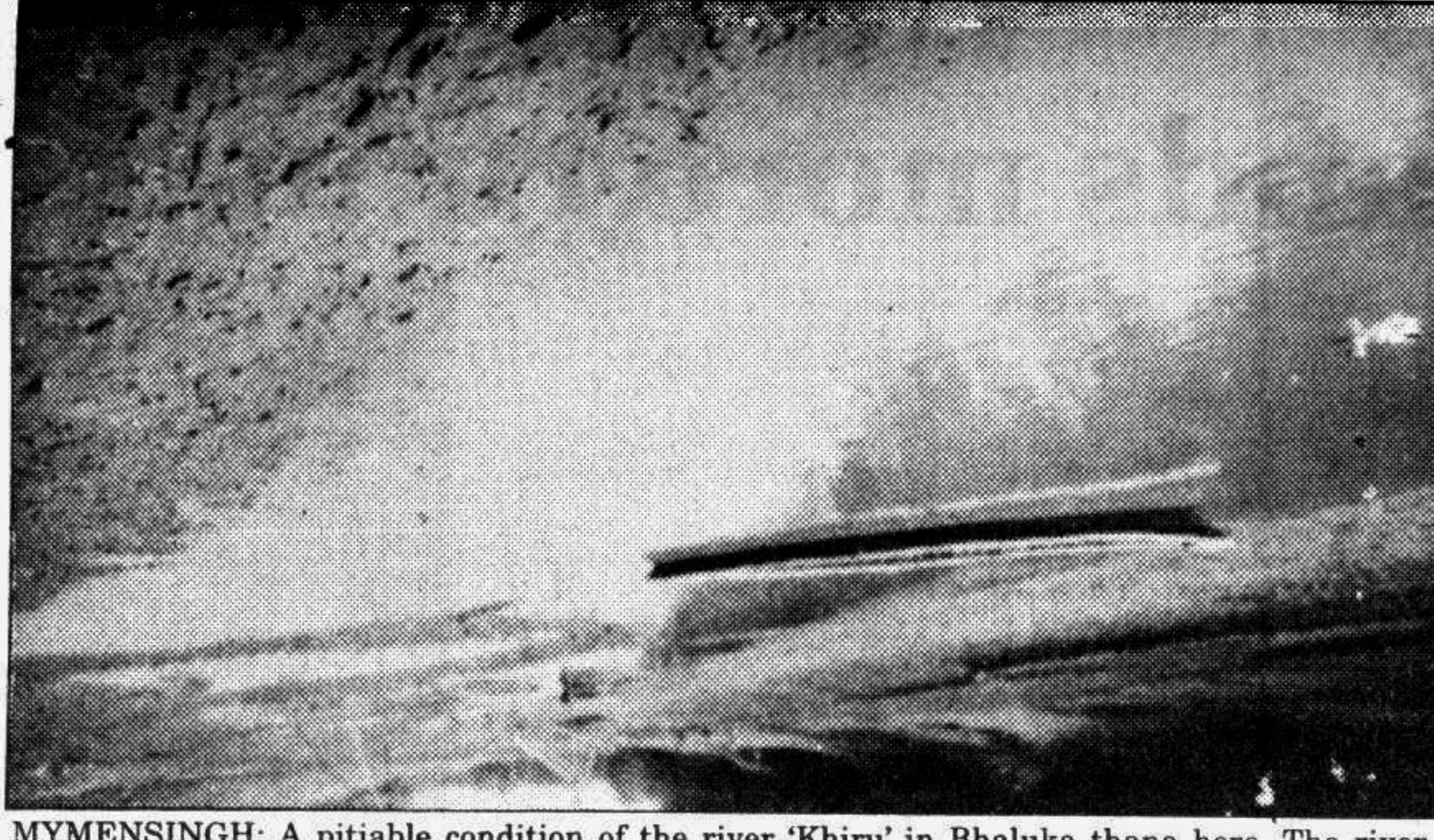
MYMENSINGH: A pitiable condition of the river 'Khiru' in Bhaluka thana here. The river has been turned into a farm land now.

RANGAMATI, Apr 17: Minister for Chittagong Hill Tracts Affairs Kalparanjan Chakma visited the renovation work of the temporary office the Chittagong Hill Tracts Regional Council here, reports BSS. He also visited the repair works of the residence of the chairman of the council.