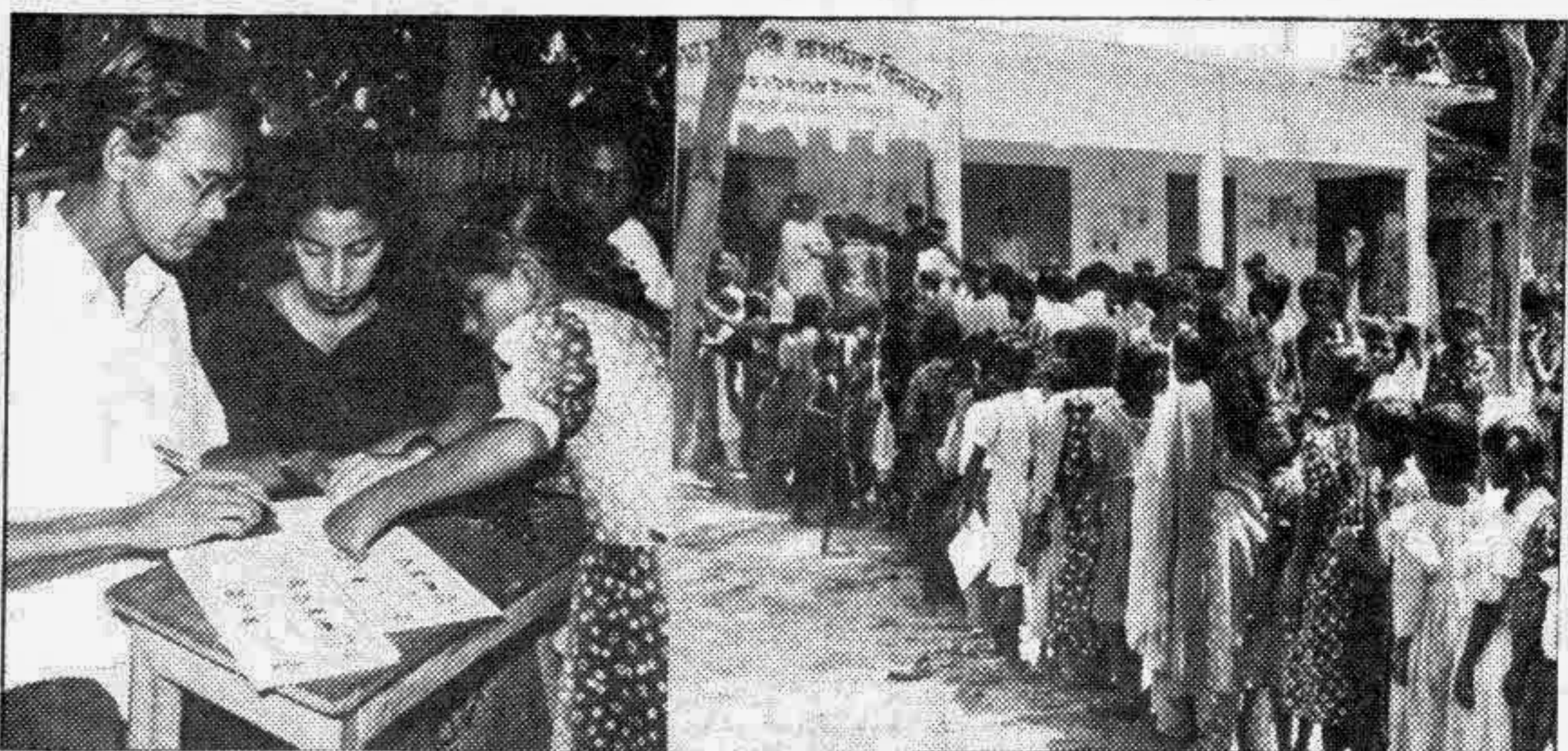
Children aged six to 14 standing in a long queue to cast their votes in Union Child Council (UCC) election at a centre in Tangail yesterday.