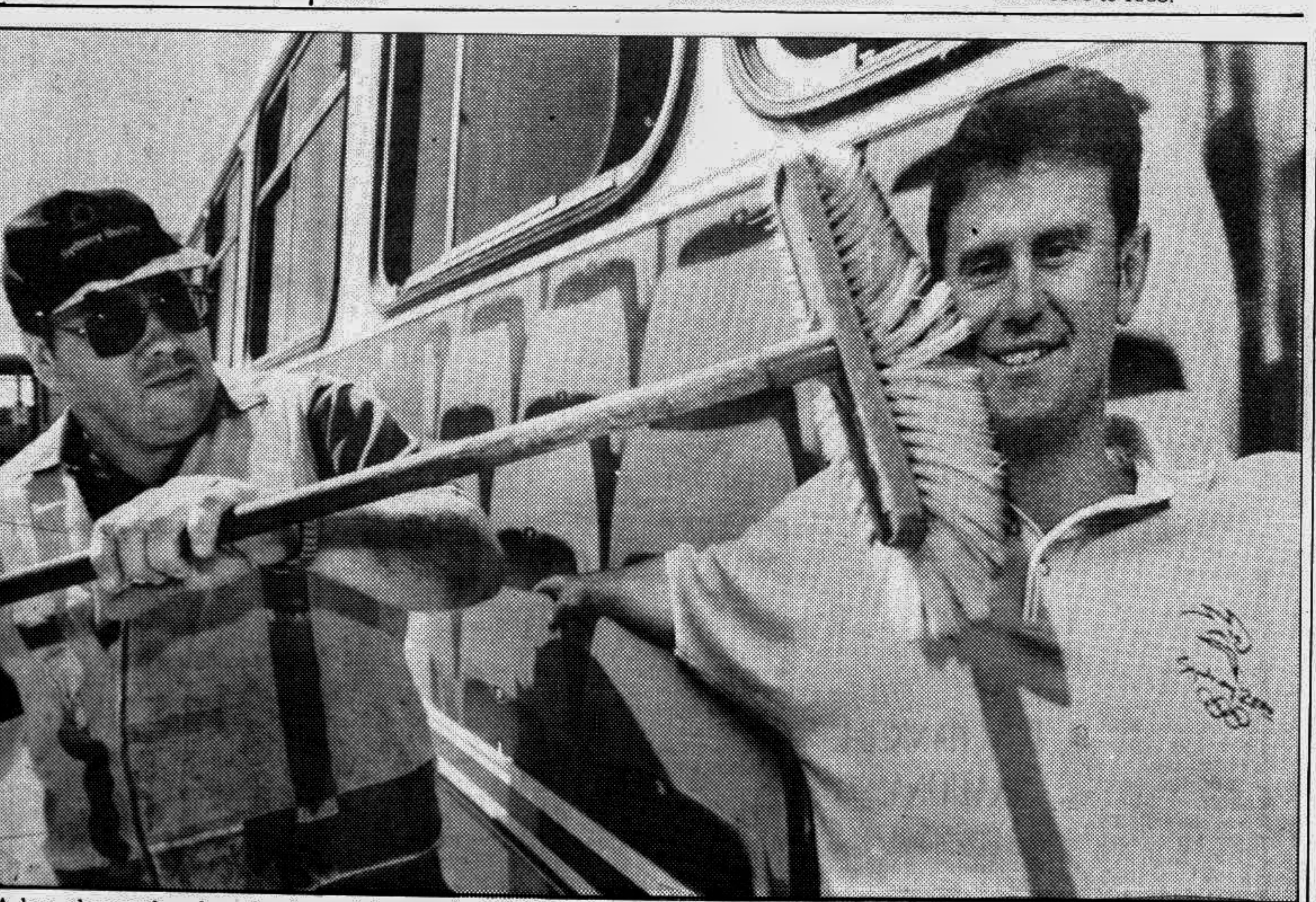
A bus cleaner brushes the face of former Australian skipper Mark Taylor whose picture has been splashed on Sydney buses in an effort to promote the 2000 Games on April 13.