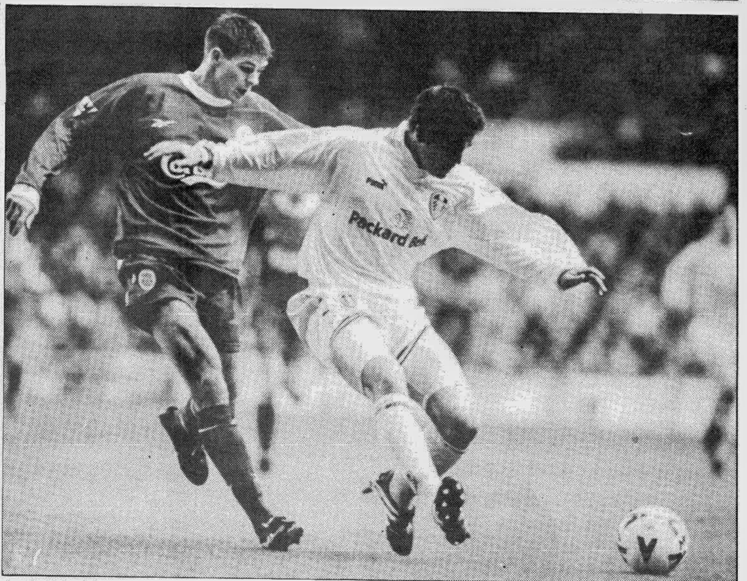
Leeds United Harry Kewell (R) fends off Liverpool defender Steve Gerrard during their Premier League encounter at Elland Road, Leeds on April 12. The game ended goalless.

LONDON, Apr 13: Liverpool denied Leeds United a club record eighth successive win in the top flight by holding them to a goalless draw in the Premier League on Monday, reports Reuters.