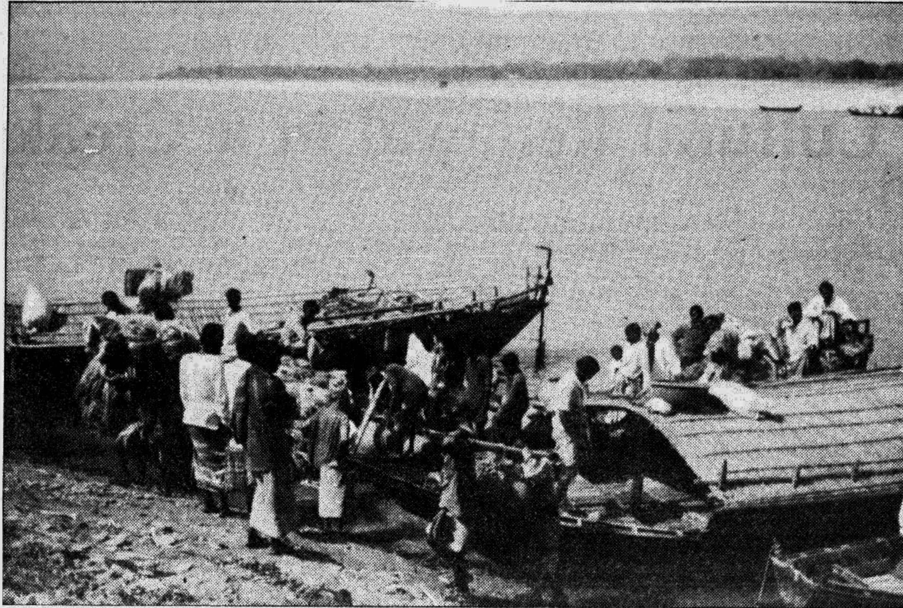
MAGURA: The river Gorai is now flowing normally as its water level has gone up in this dry season. This picture was taken recently from the river ghat at Langabandh bazaar in Sripur thana here. Commodities like jute and molasses are being loaded in a boat for marketing to some other places. The river dried up in the last season. Engine boats could not ply at that time.

FENI, Apr 13: A peace meeting with the participation of all political parties was held at Dagonbhuiyan Thana Council Auditorium on Saturday to stop political violence and terrorism in the areas, reports APB.