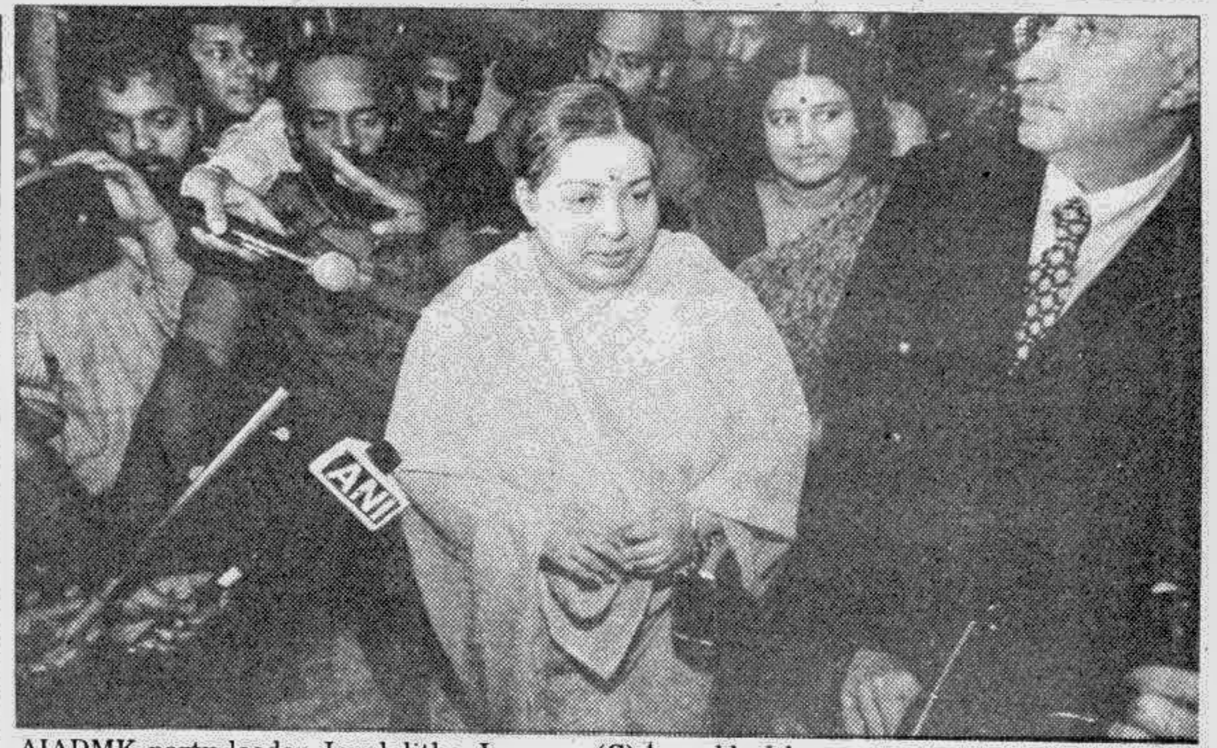
AIADMK party leader Jayalalitha Jayaram (C) is mobbed by reporters as she arrives at a New Delhi hotel Monday. India's political crisis deepened after Jayalalitha declared that she would withdraw her support to the Hindu nationalist coalition, a move that could topple the government.

Tuesday's fence-mending meeting here with Russian Foreign Minister Igor Ivanov follows a North Atlantic Council meeting in Brussels in which the 19 NATO allies considered having Russian and other European troops join in enforcing a settlement in the province if Yugoslavia accepts peace terms.