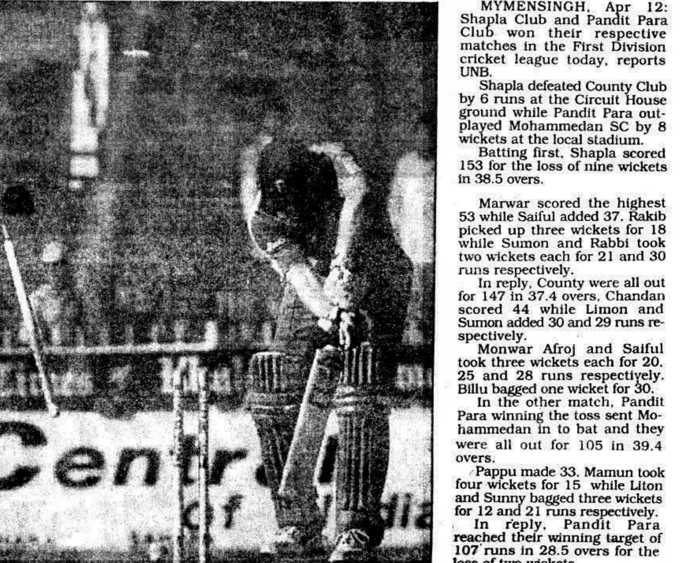
An Azhar Mahmood delivery sends England batsman Andrew Flintoff's off-stump flying.

In the other match, Pandit Para winning the toss sent Mohammedan in to bat and they were all out for 105 in 39.4 overs.